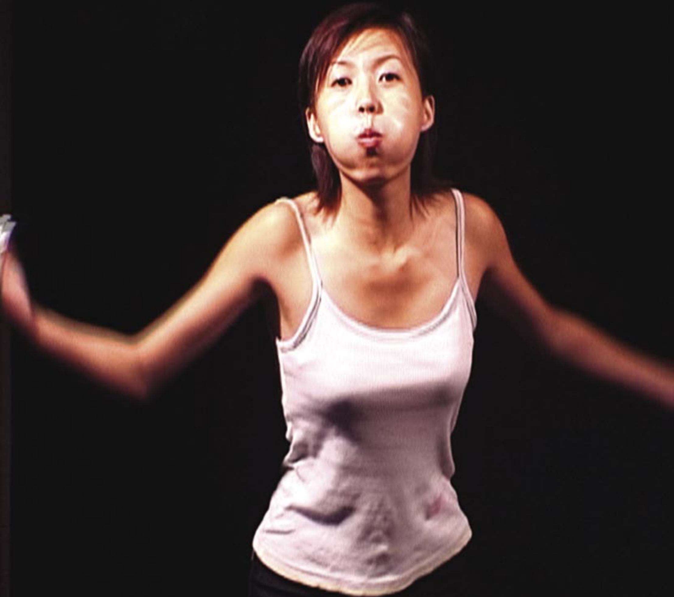
Yang Zhenzhong, Let's Puff , 2002, 2-channel video installation, 6,58', ed. of 5