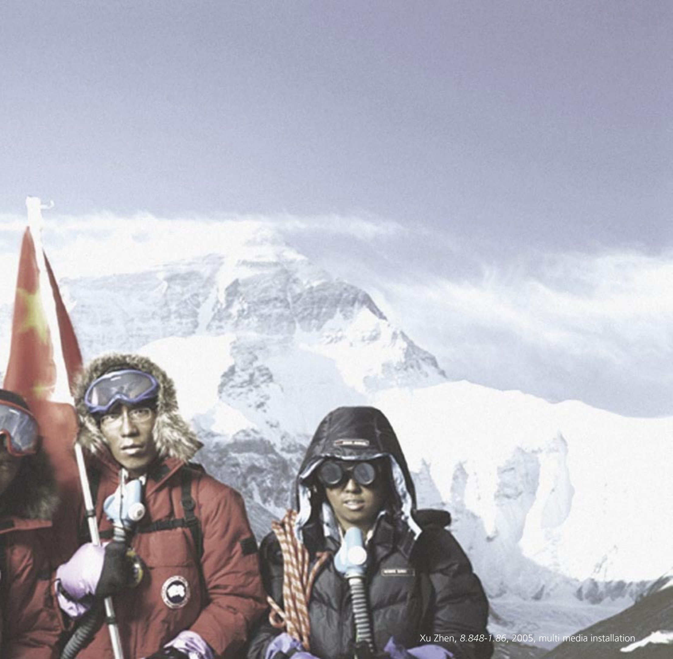
Xu Zhen, 8.848-1.86, 2005, multi media installation