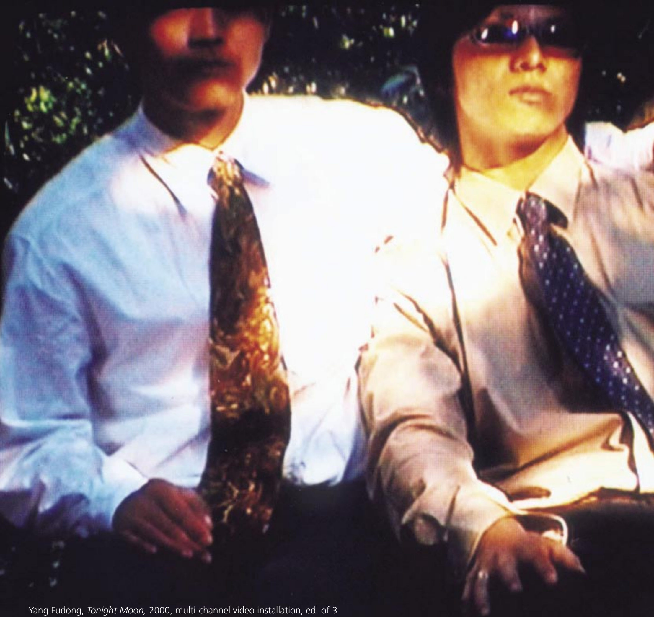
Yang Fudong, Tonight Moon , 2000, multi-channel video installation, ed. of 3