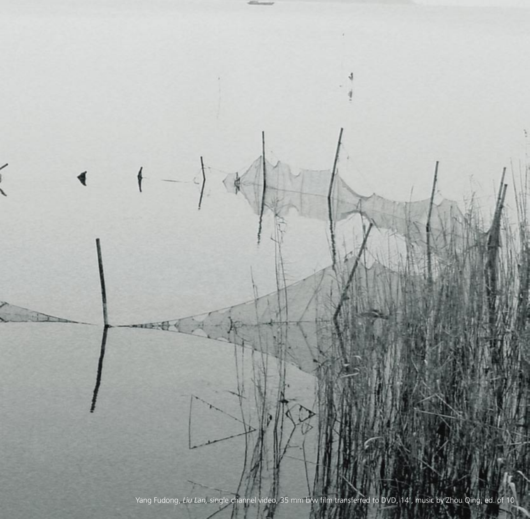
Yang Fudong, Liu Lan , single channel video, 35 mm b/w film transferred to DVD, 14', music by Zhou Qing, ed. of 10