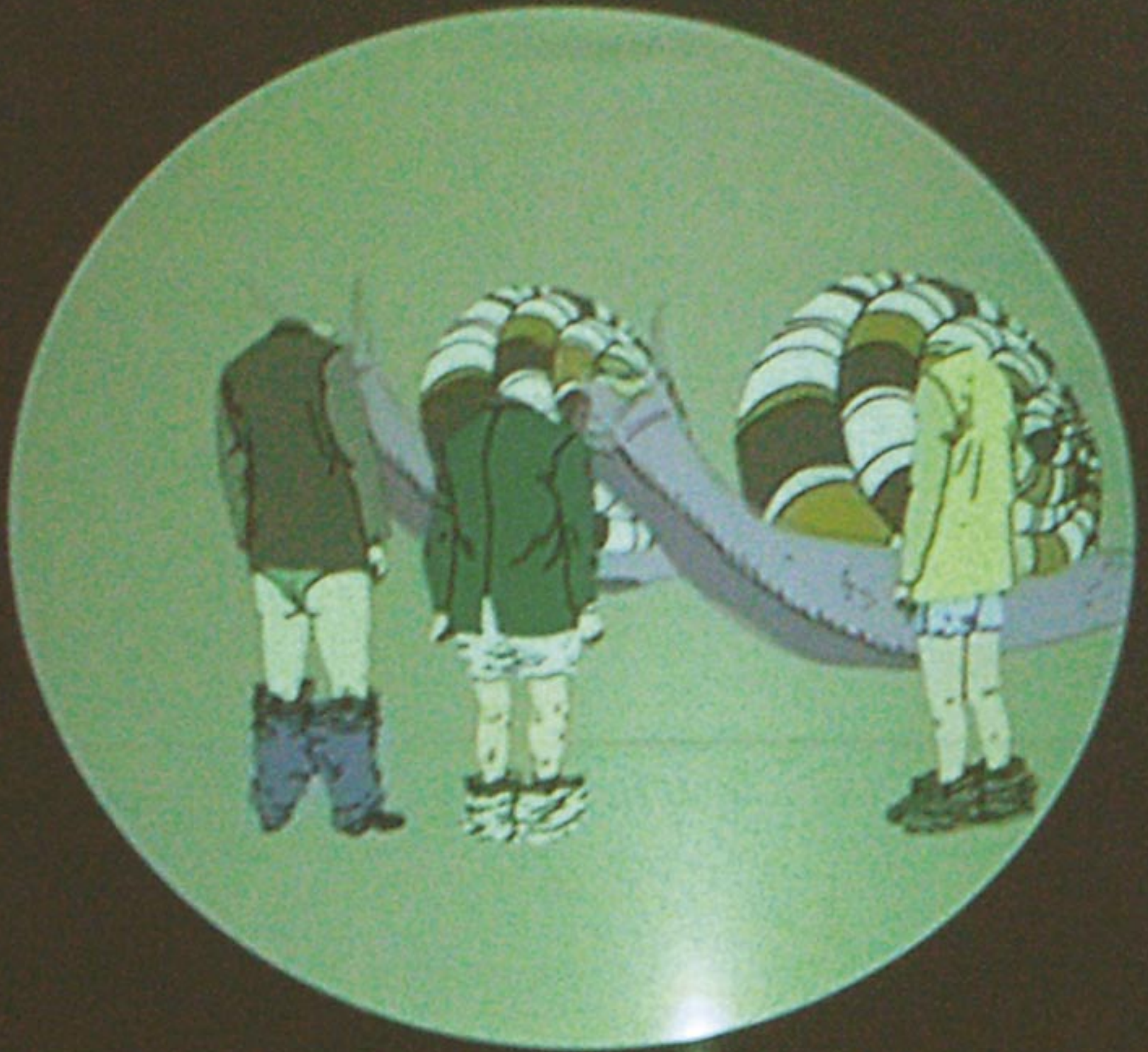
Tang Maohong, Orchid finger , 2004, 3 channel video, 8', ed. of 8