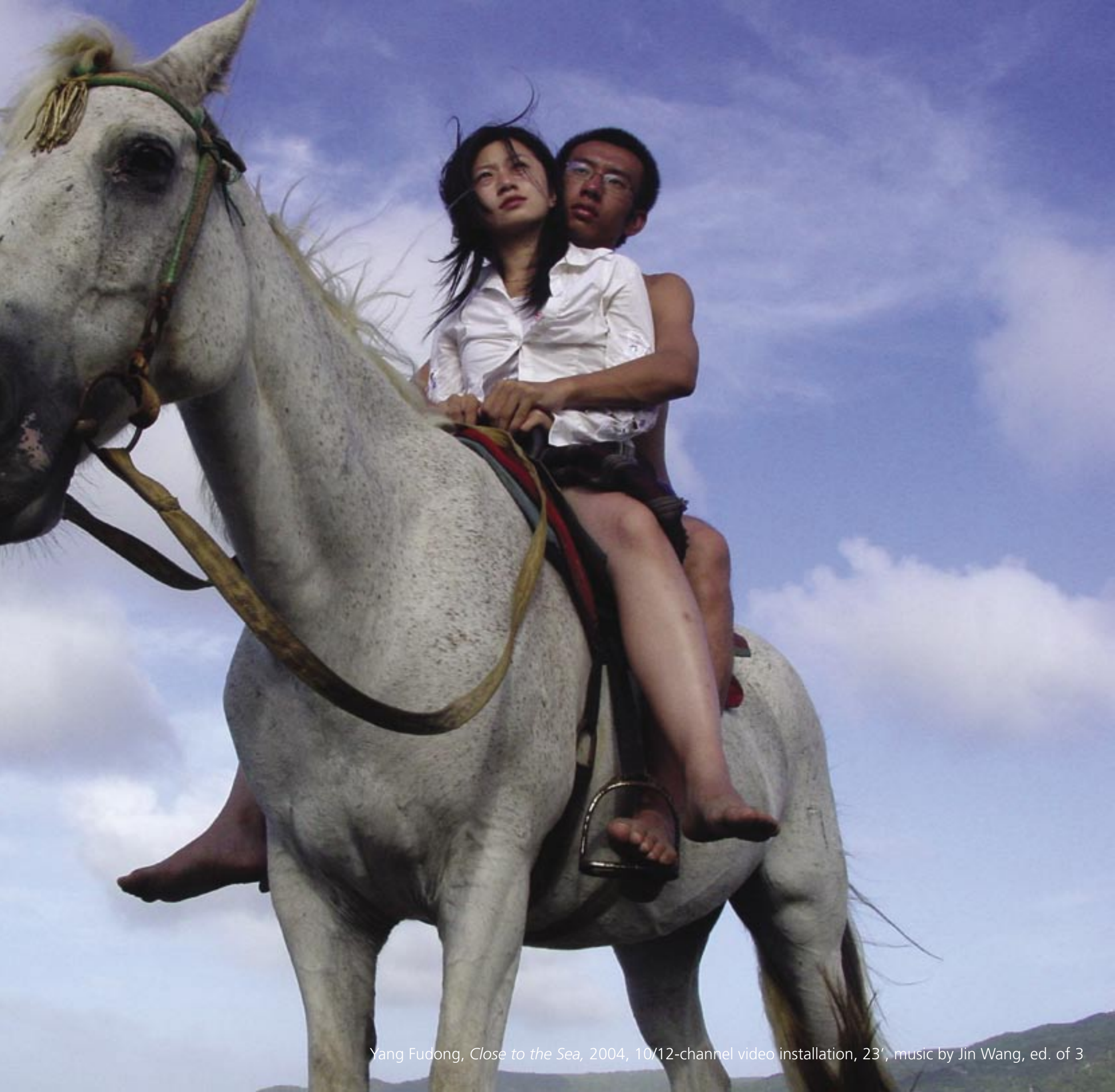
Yang Fudong, Close to the Sea , 2004, 10/12-channel video installation, 23', music by Jin Wang, ed. of 3