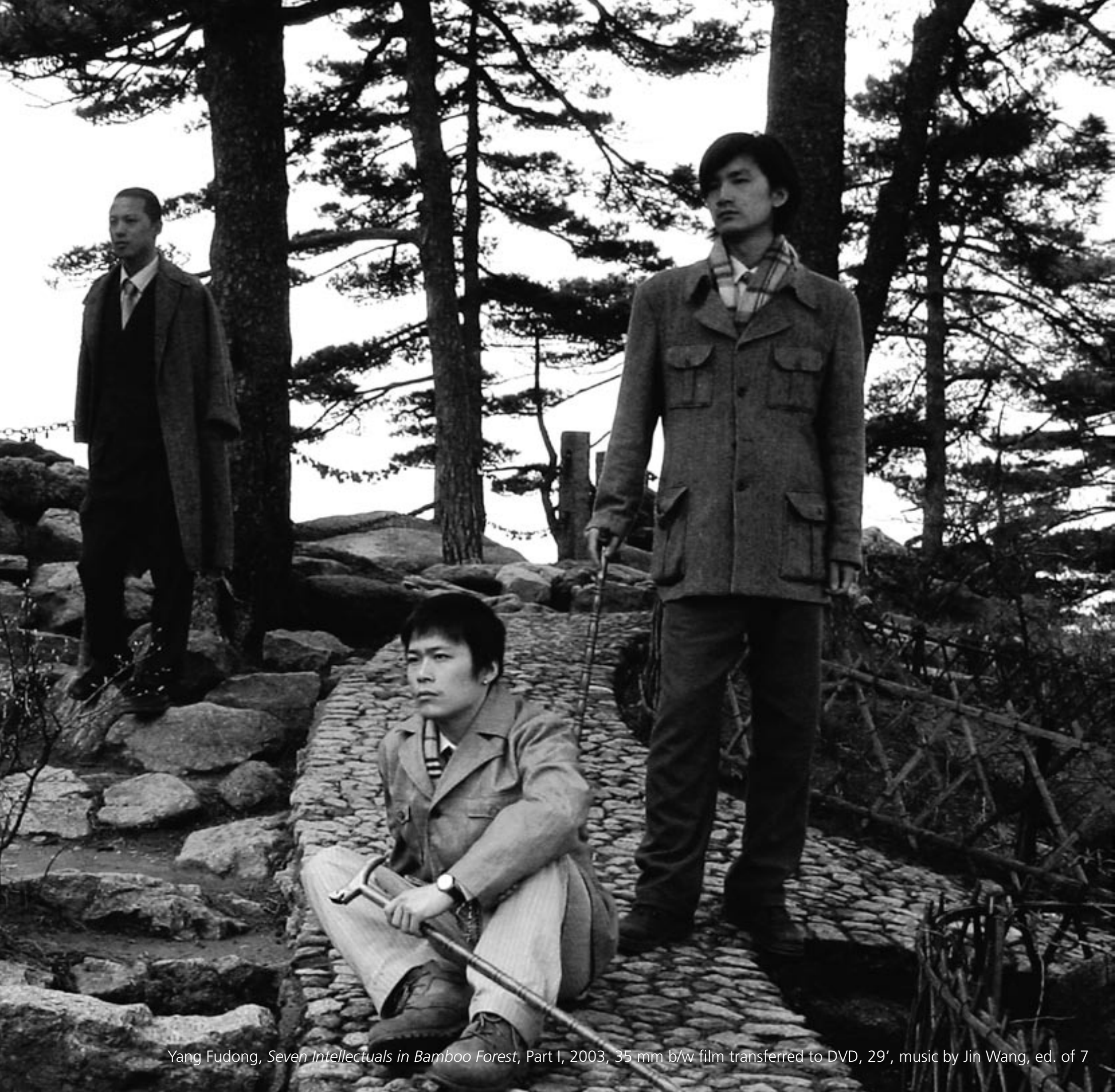
Yang Fudong, Seven Intellectuals in Bamboo Forest, Part I , 2003, 35 mm b/w film transferred to DVD, 29', music by Jin Wang, ed. of 7