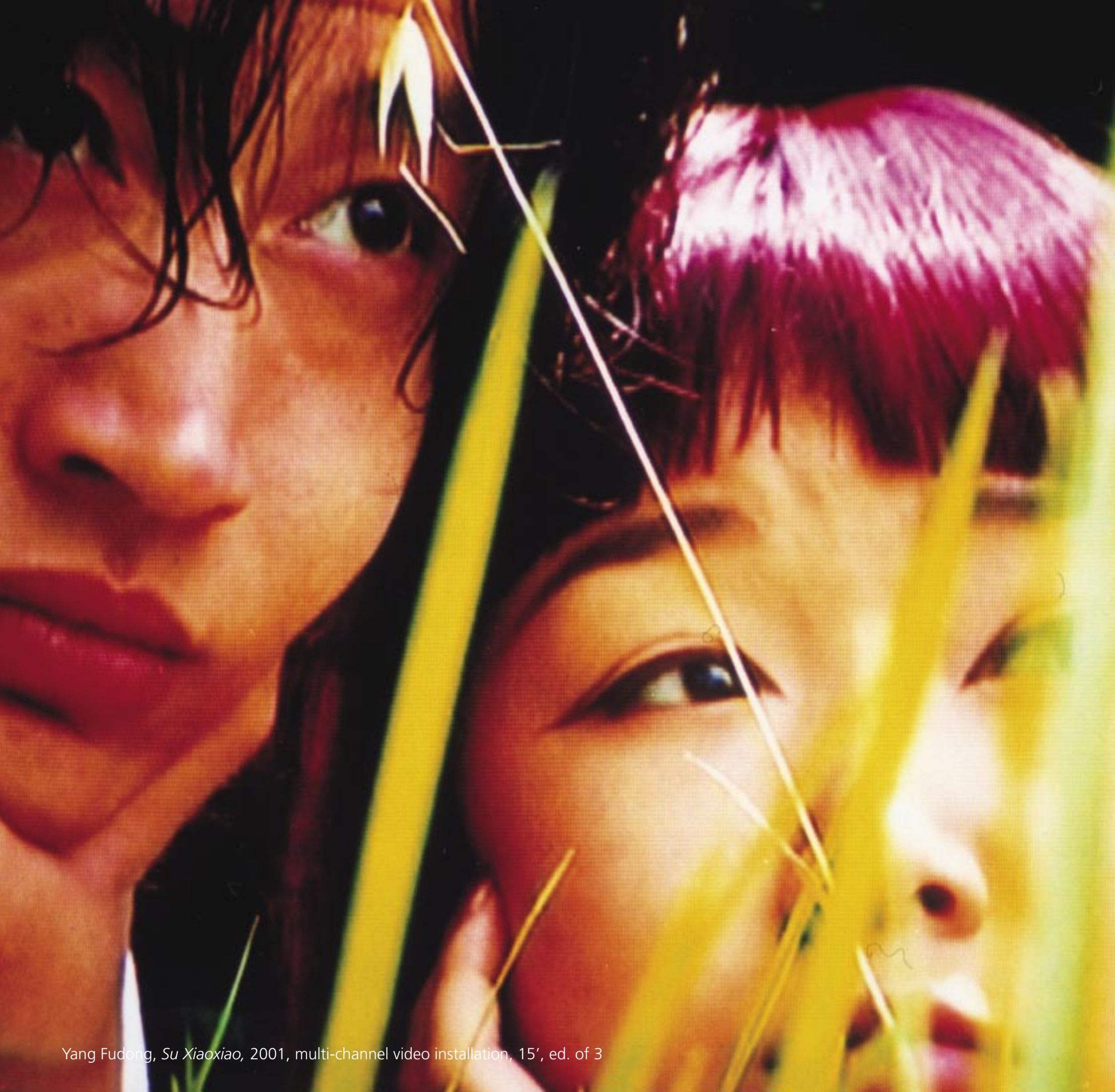
Yang Fudong, Su Xiaoxiao , 2001, multi-channel video installation, 15', ed. of 3