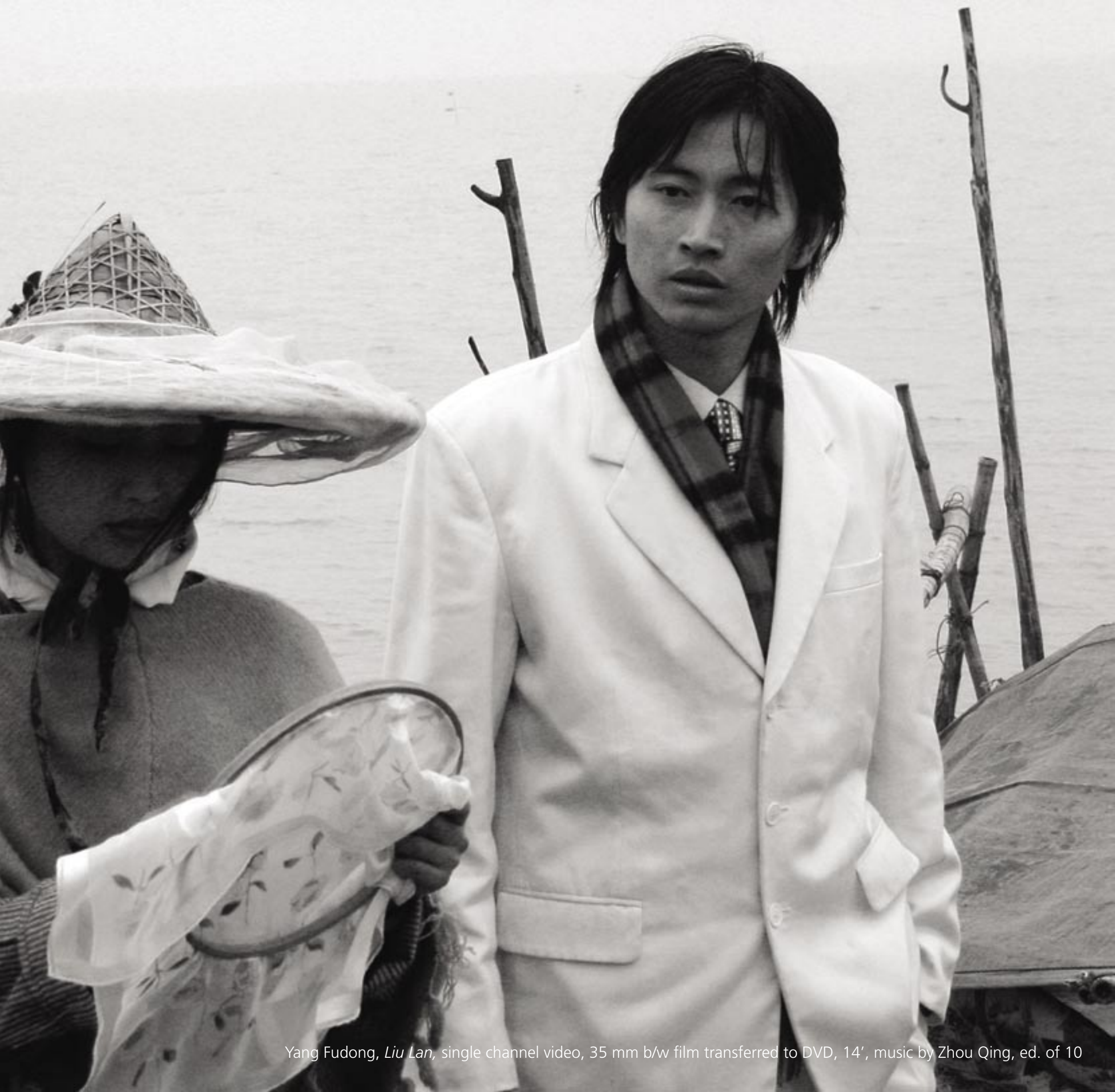
Yang Fudong, Liu Lan , single channel video, 35 mm b/w film transferred to DVD, 14', music by Zhou Qing, ed. of 10