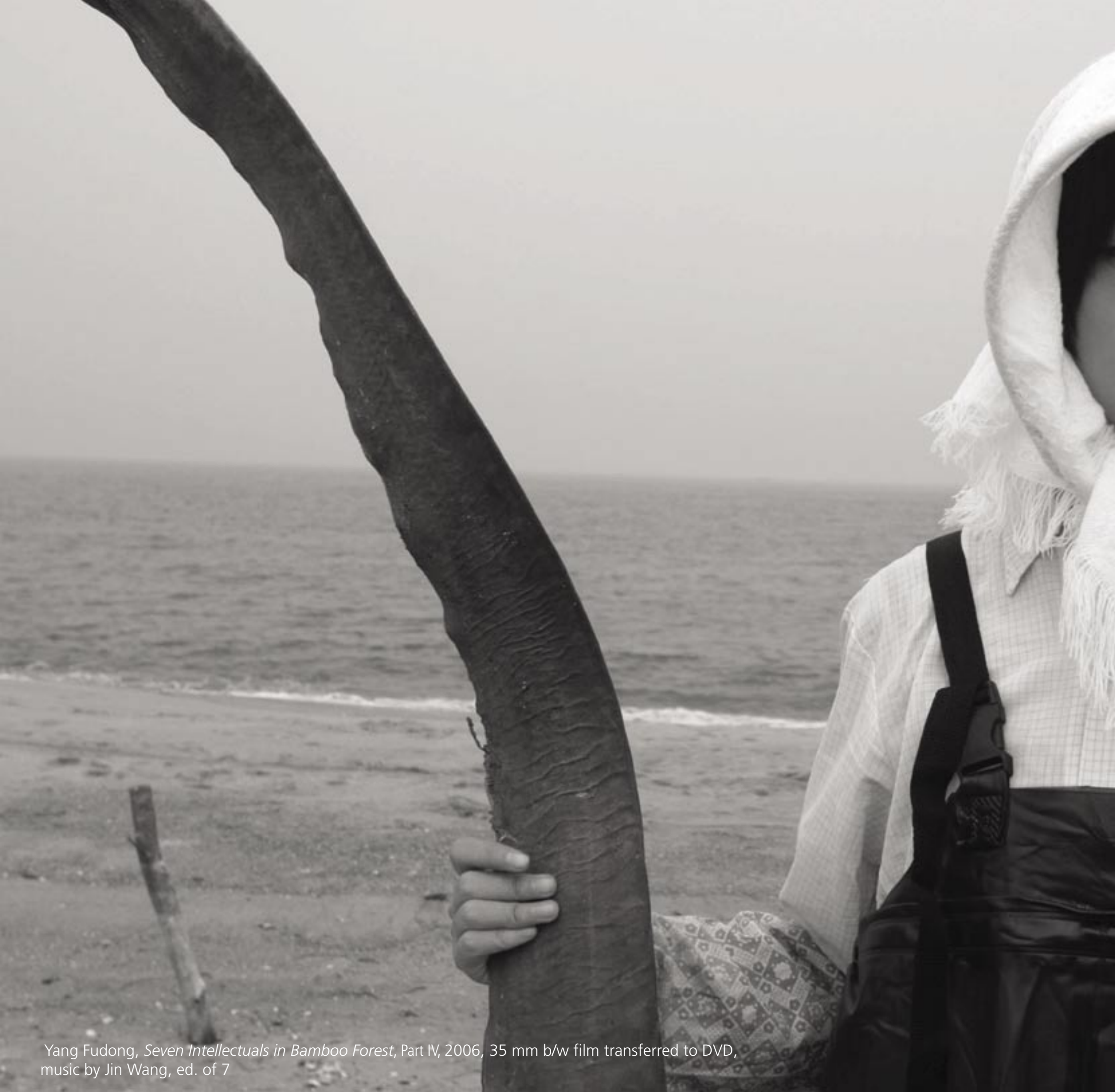
Yang Fudong, Seven Intellectuals in Bamboo Forest, Part IV , 2006, 35 mm b/w film transferred to DVD, music by Jin Wang, ed. of 7