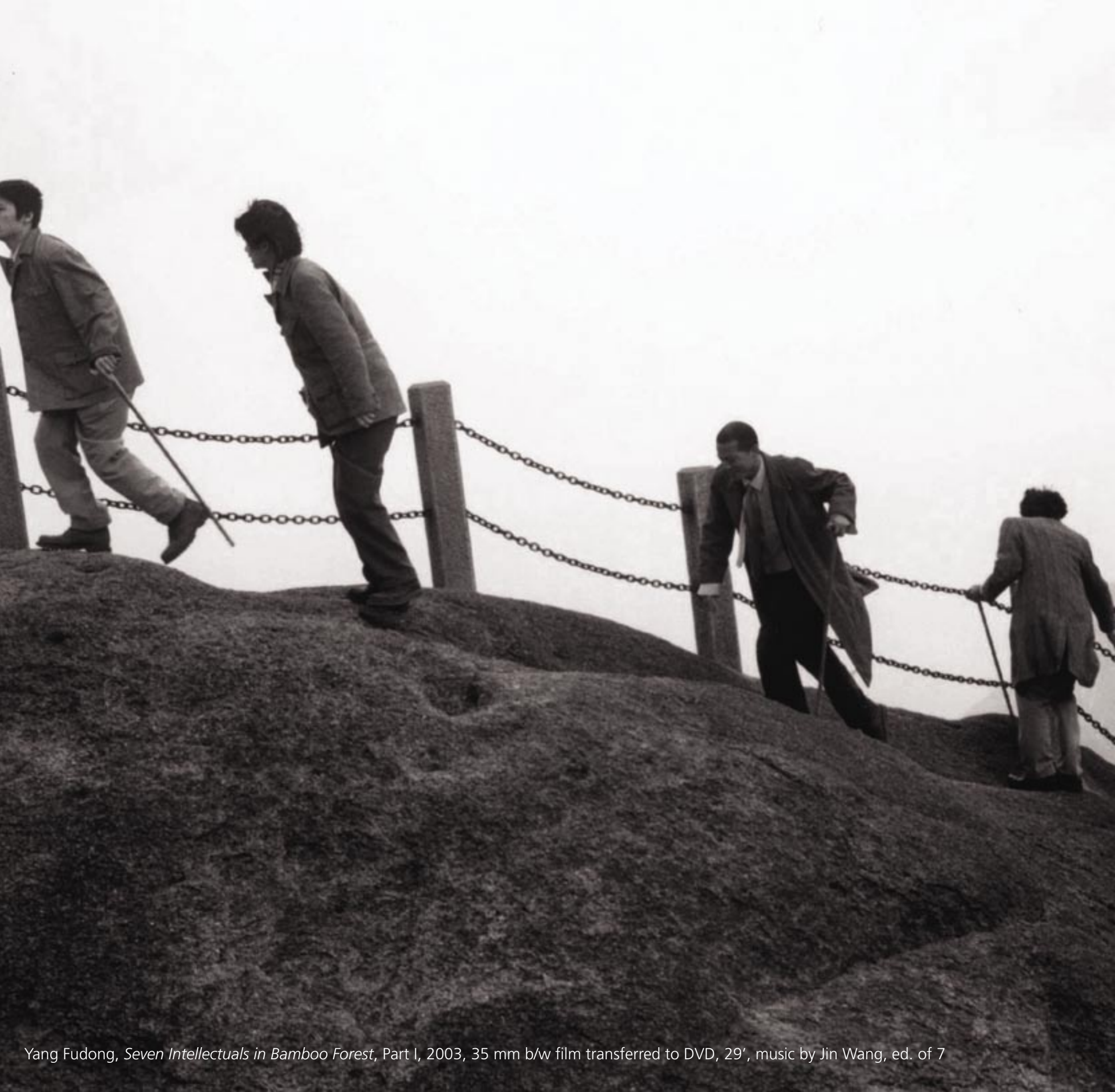
Yang Fudong, Seven Intellectuals in Bamboo Forest, Part I , 2003, 35 mm b/w film transferred to DVD, 29', music by Jin Wang, ed. of 7