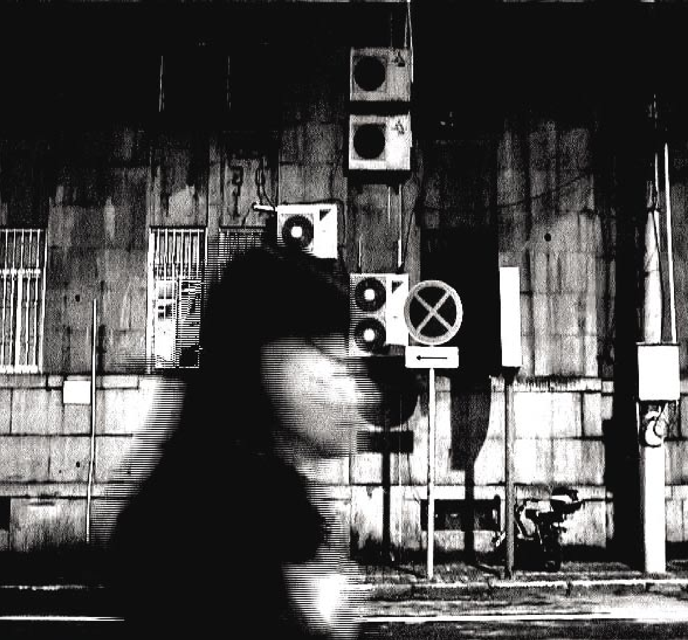
Song Tao, Three Days Ago , 2005, single channel video, 8', ed. of 5