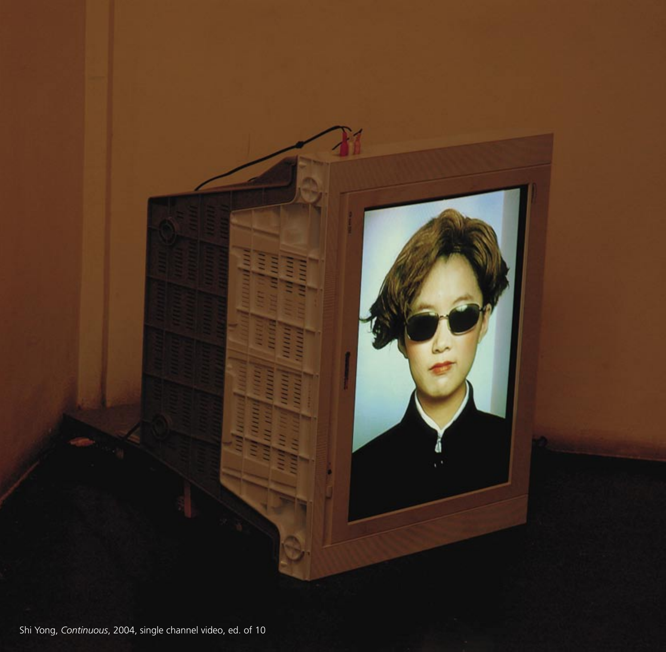
Shi Yong, Continuous , 2004, single channel video, ed. of 10