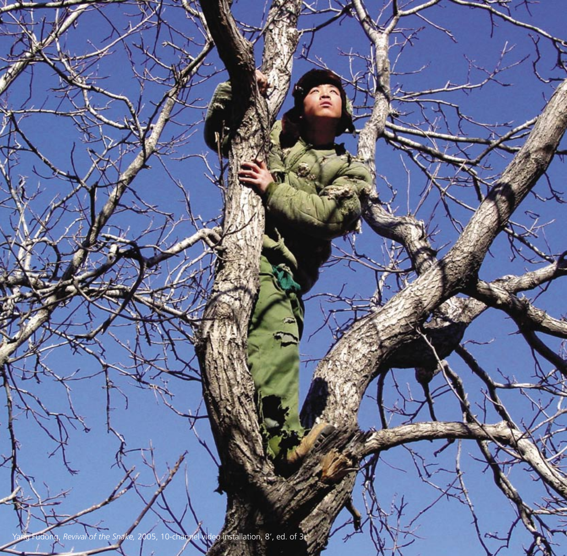
Yang Fudong, Revival of the Snake , 2005, 10-channel video installation, 8', ed. of 3