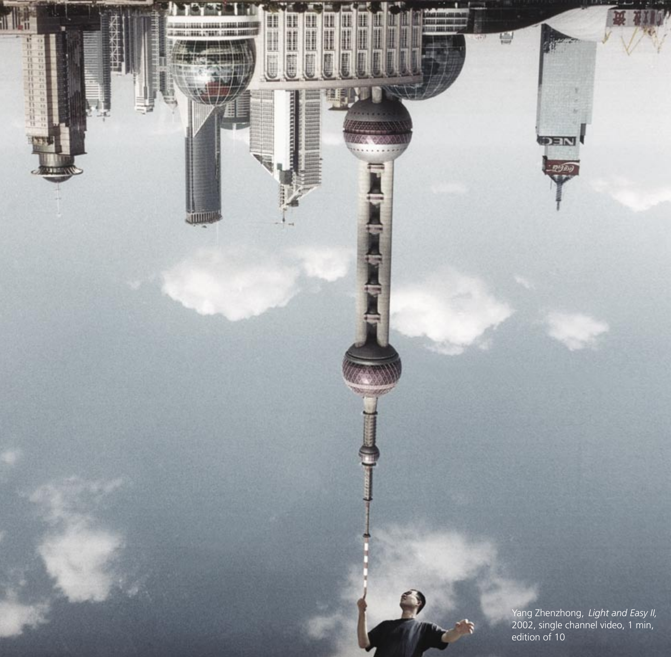
Yang Zhenzhong, Light and Easy II , 2002, single channel video, 1 min, edition of 10