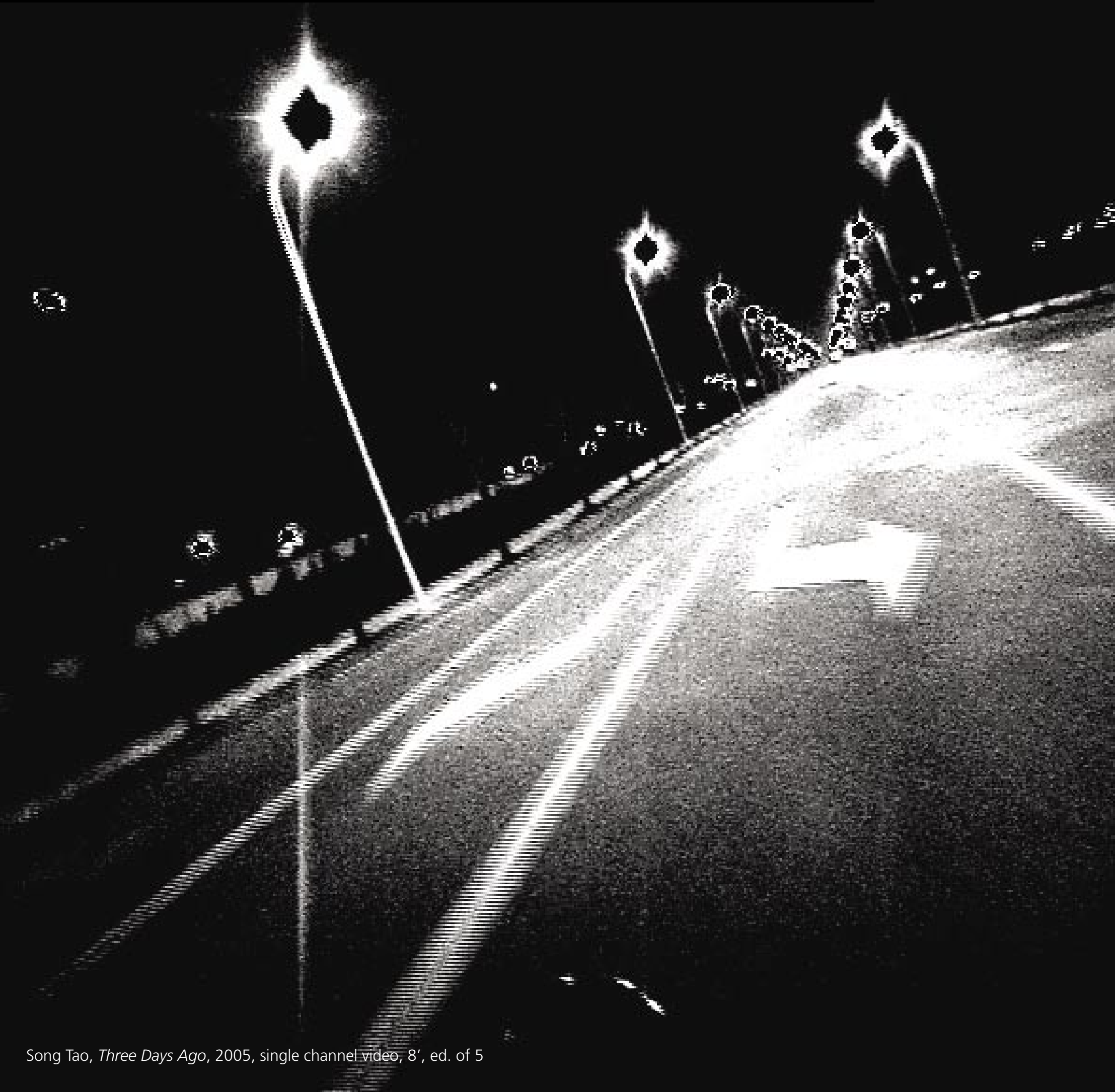
Song Tao, Three Days Ago , 2005, single channel video, 8', ed. of 5