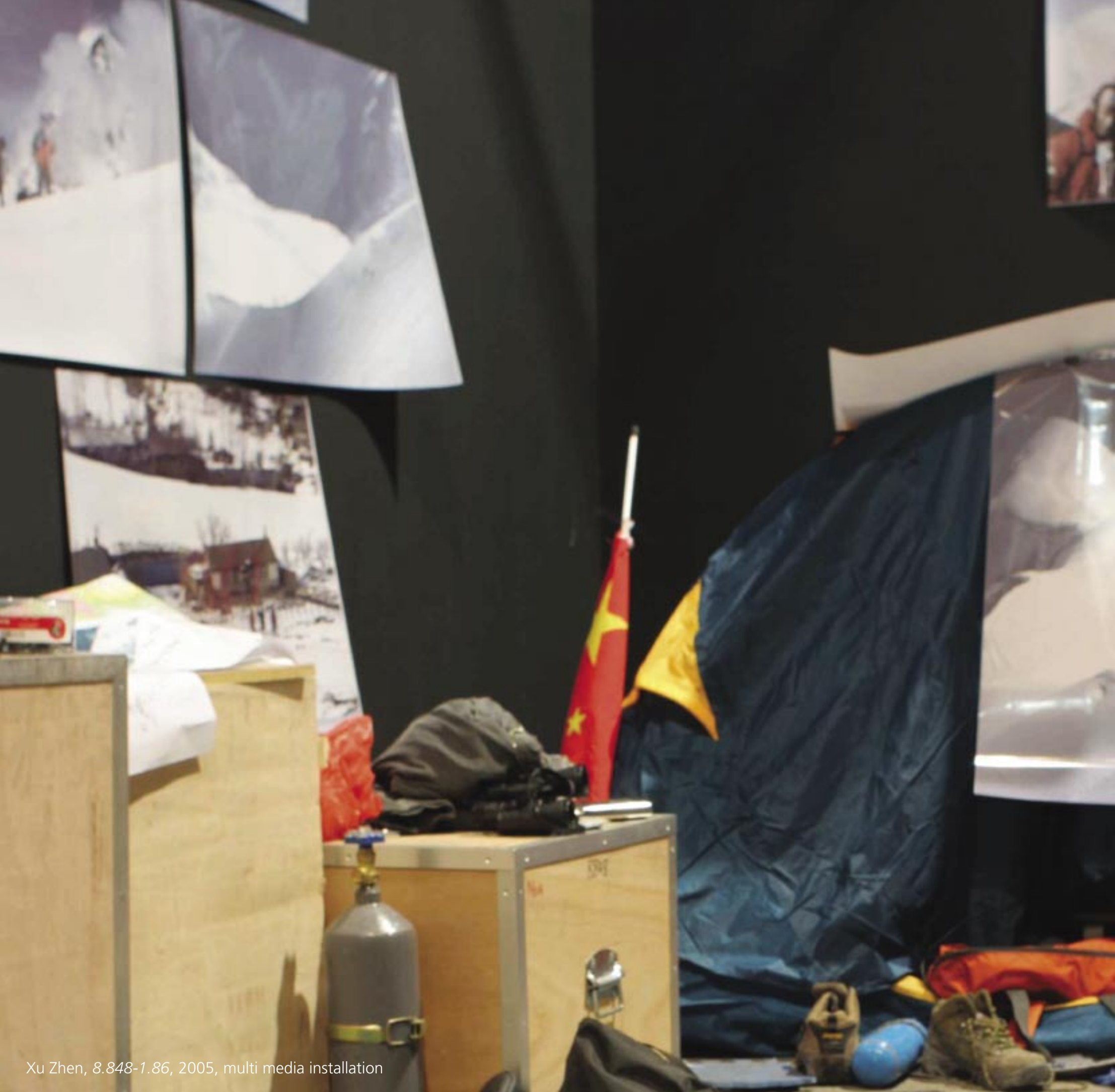
Xu Zhen, 8.848-1.86, 2005, multi media installation