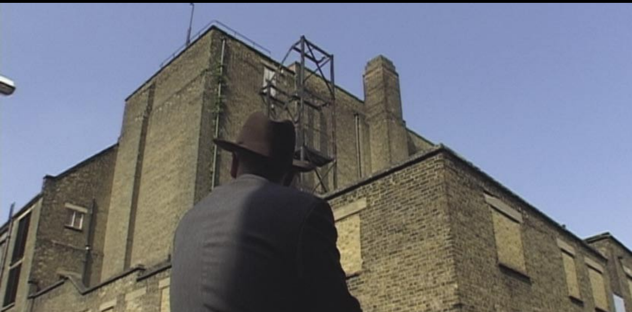
Lu Chunsheng, History of Chemistry II , 2006, single channel video, 95 min, edition of 5