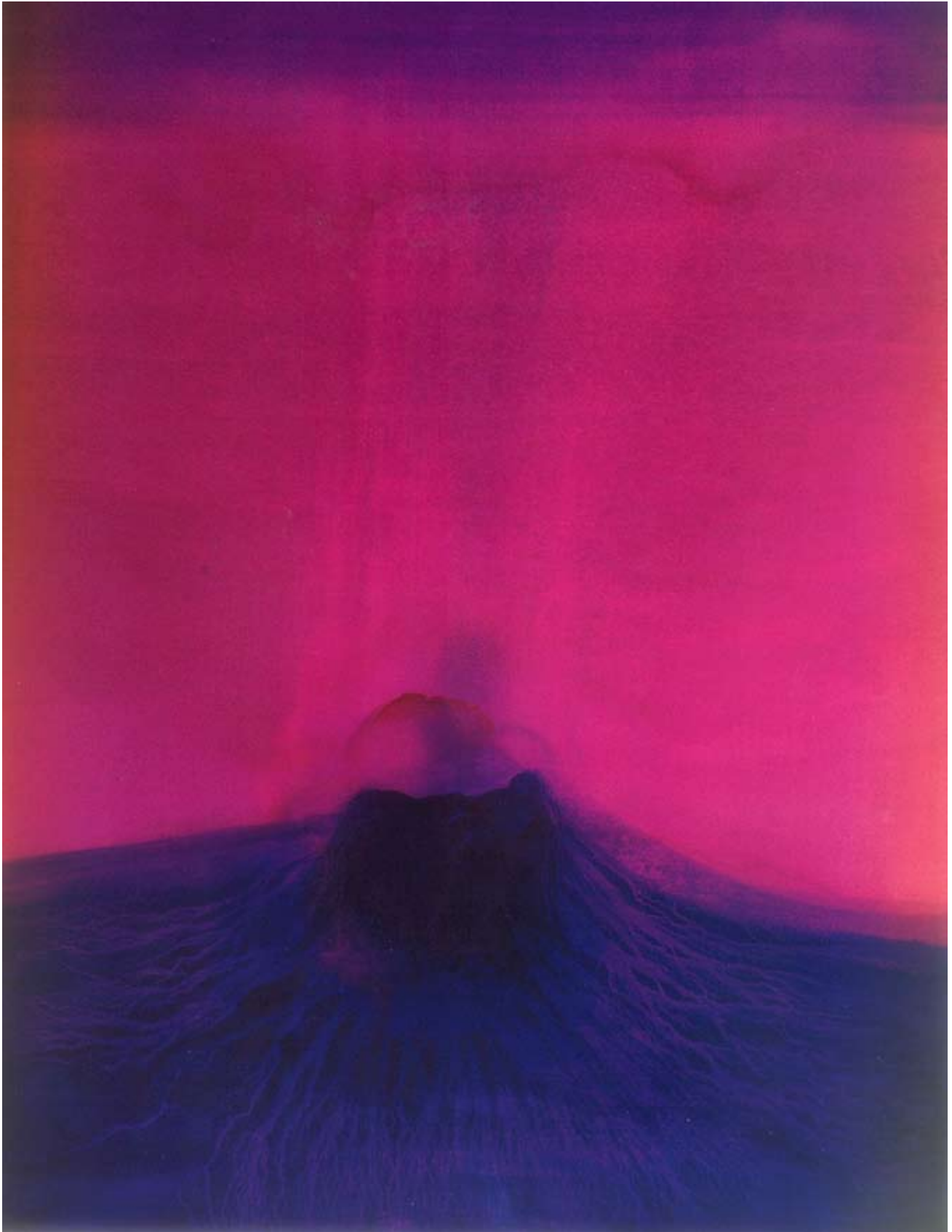
The Flowing River, 2002 Ink color on canvas 180x140 cm