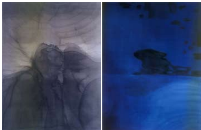
New Hydrological Survey No 1, 2002 Ink color on canvas, 180x140cm