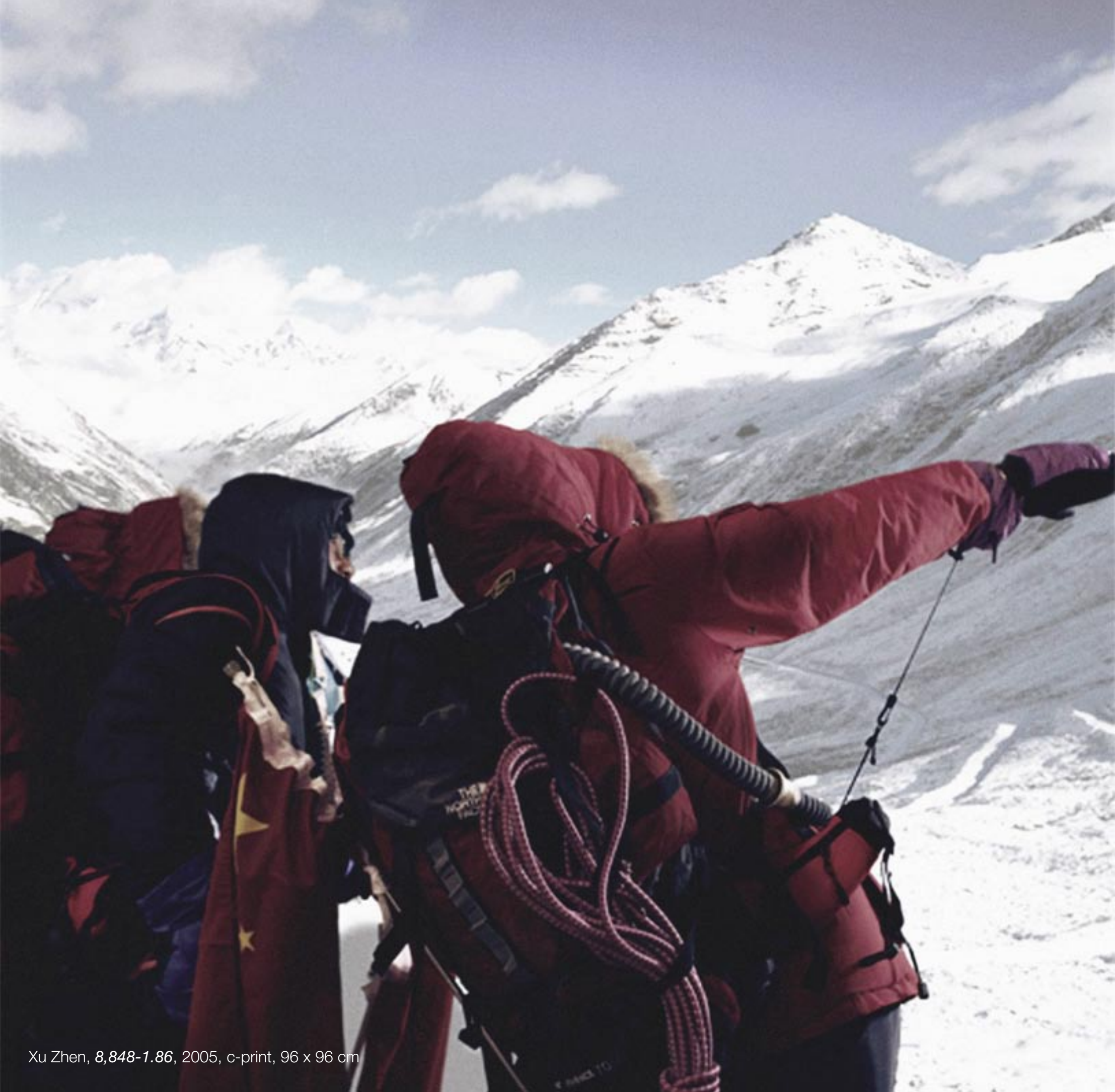
Xu Zhen, 8,848-1.86, 2005, c-print, 96 x 96 cm