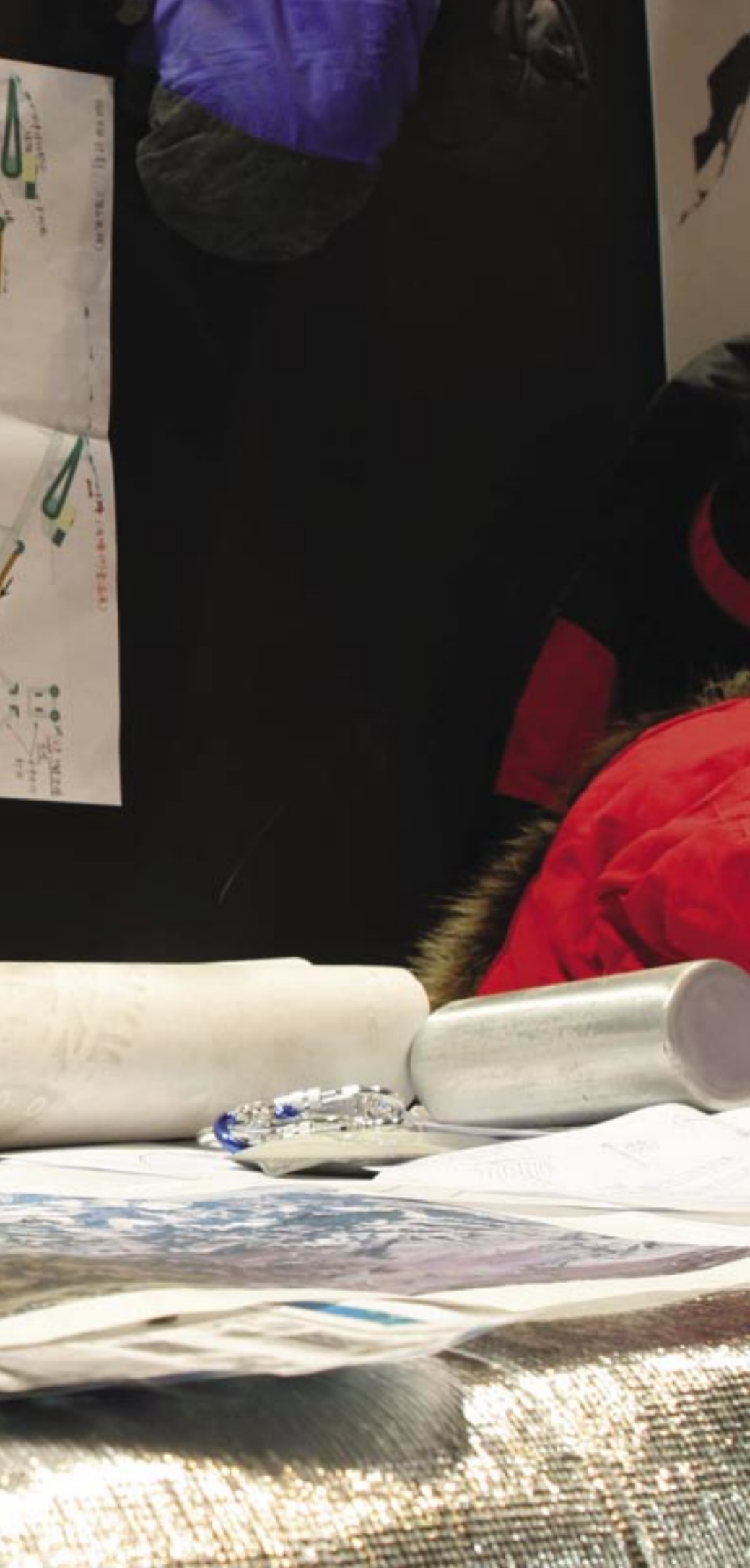
Xu Zhen, 8,848-1.86, 2005, multi media installation, installation shot