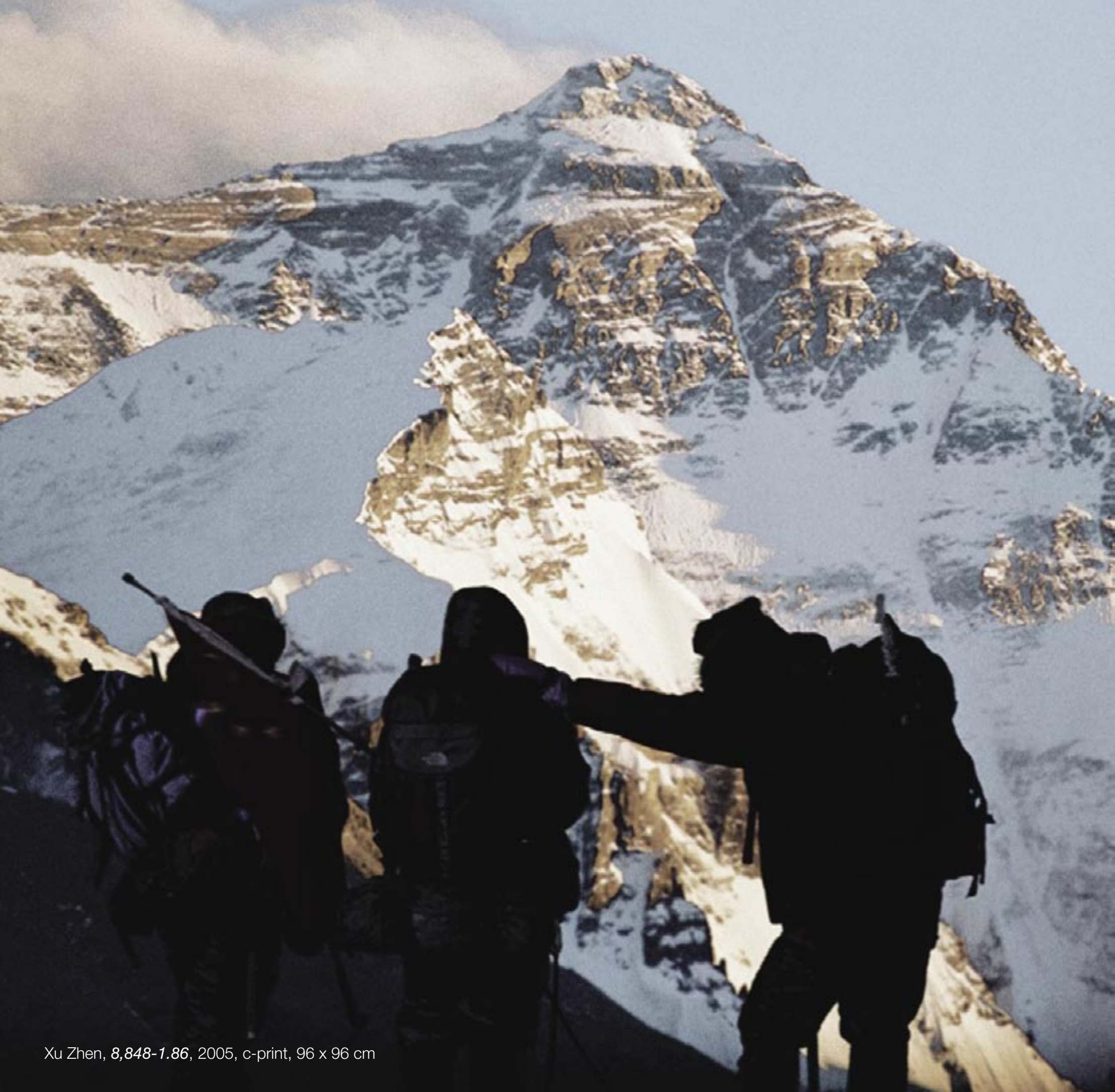
Xu Zhen, 8,848-1.86, 2005, c-print, 96 x 96 cm