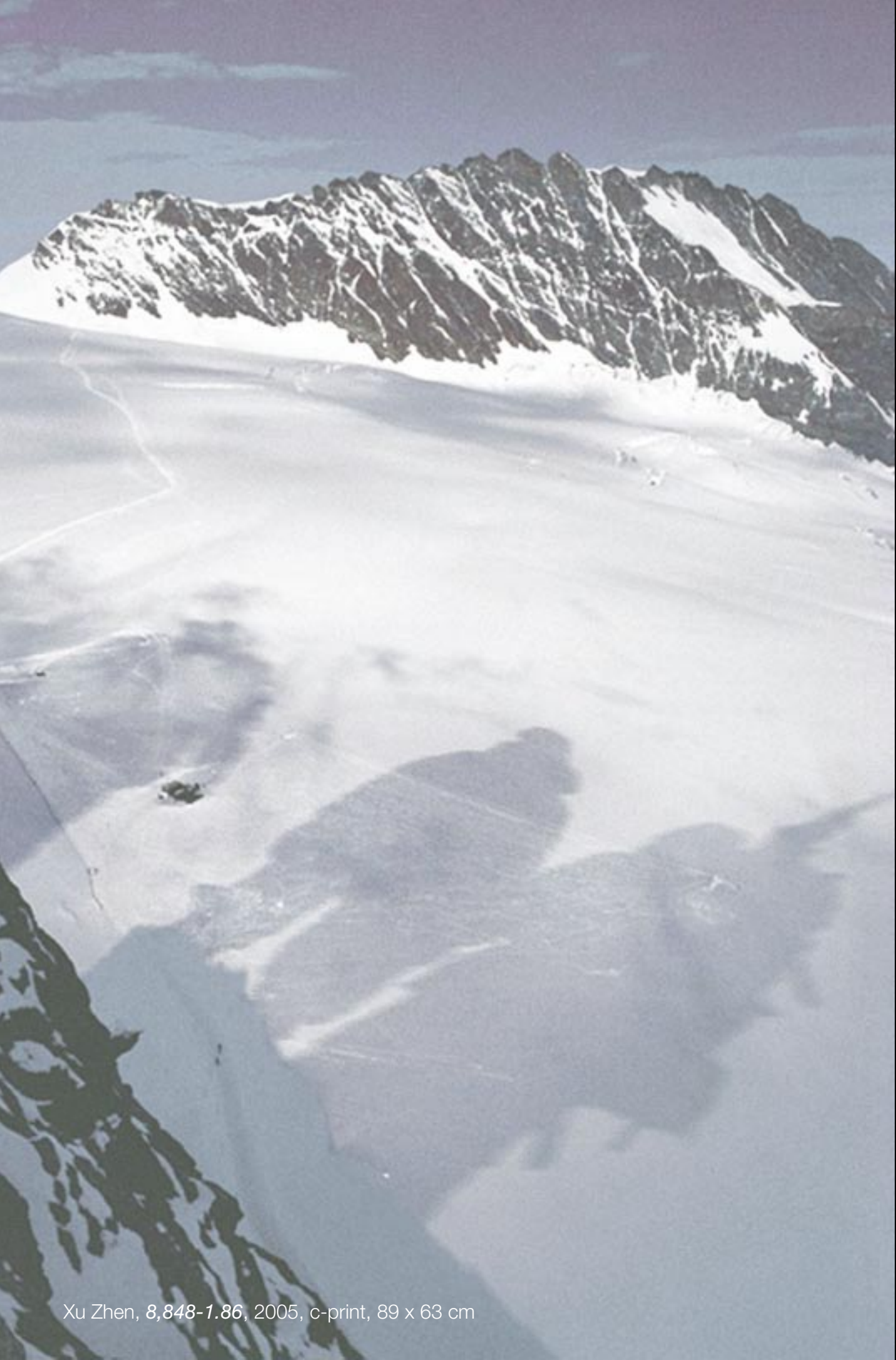
Xu Zhen, 8,848-1.86, 2005, c-print, 89 x 63 cm