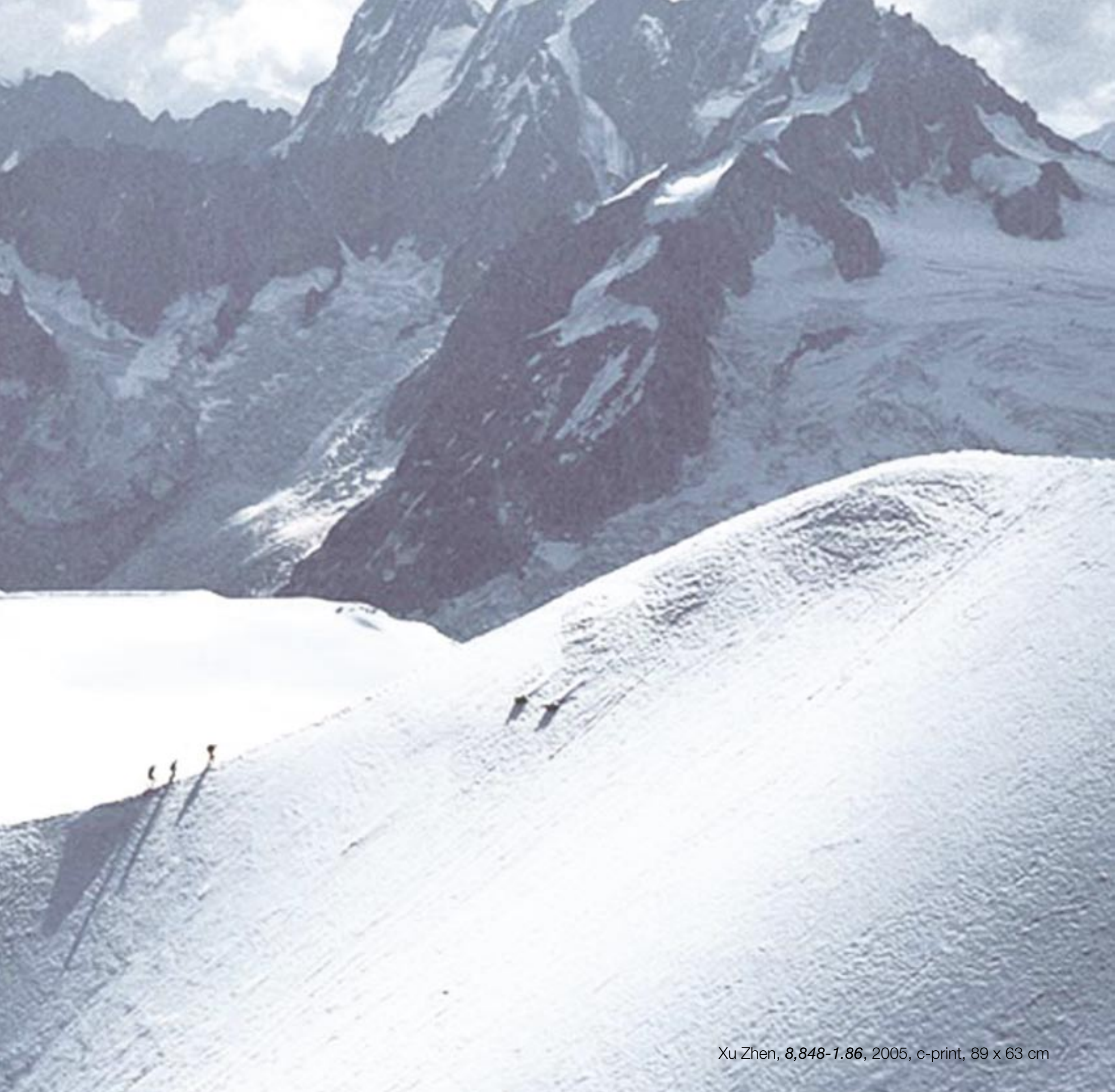
Xu Zhen, 8,848-1.86, 2005, c-print, 89 x 63 cm