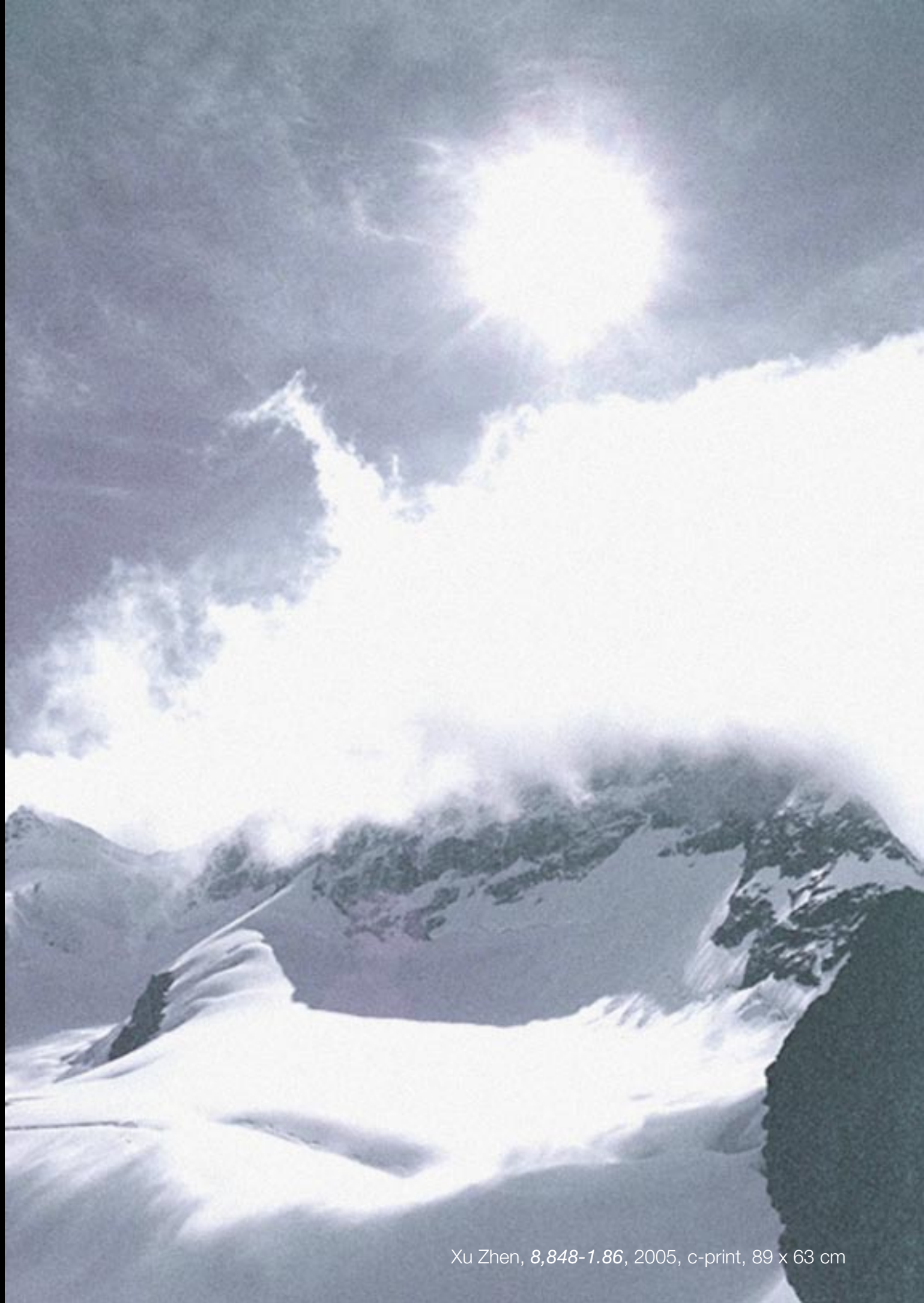
Xu Zhen, 8,848-1.86, 2005, c-print, 89 x 63 cm