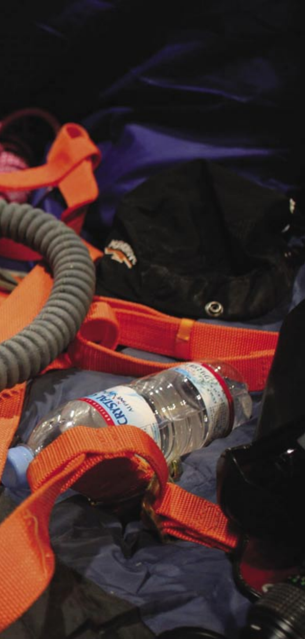
Xu Zhen, 8,848-1.86, 2005, multi media installation, installation shot