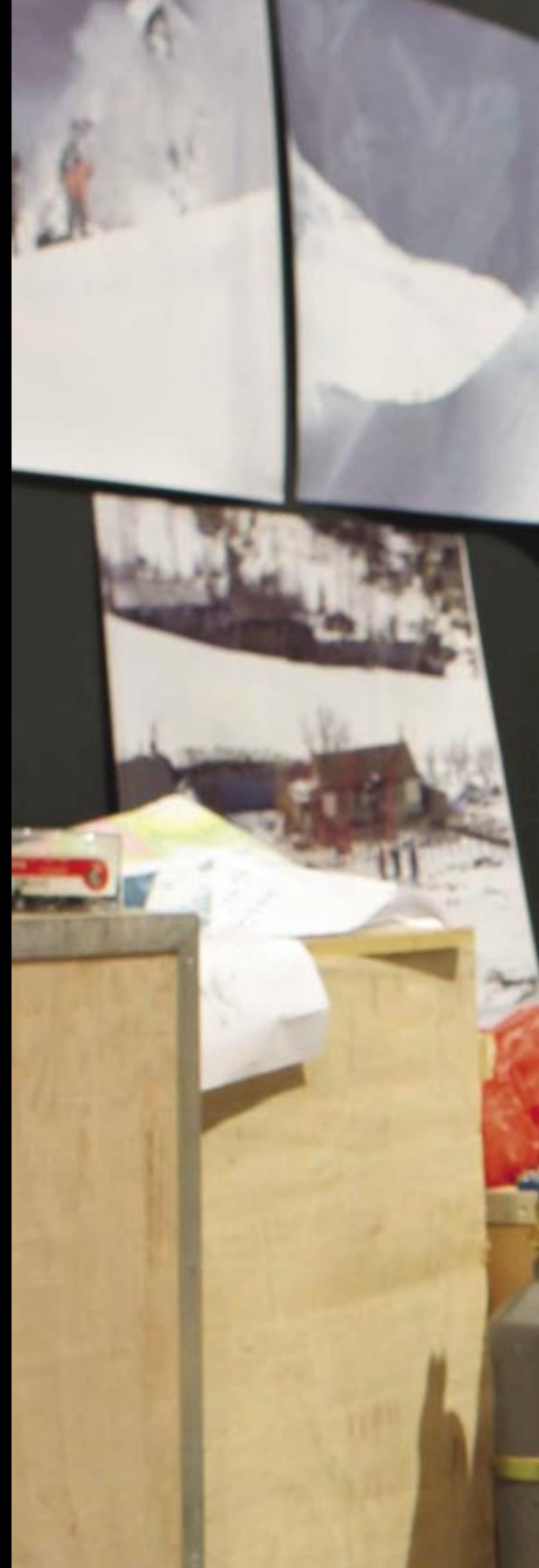
Xu Zhen, 8,848-1.86 , 2005, multi media installation, installation shot