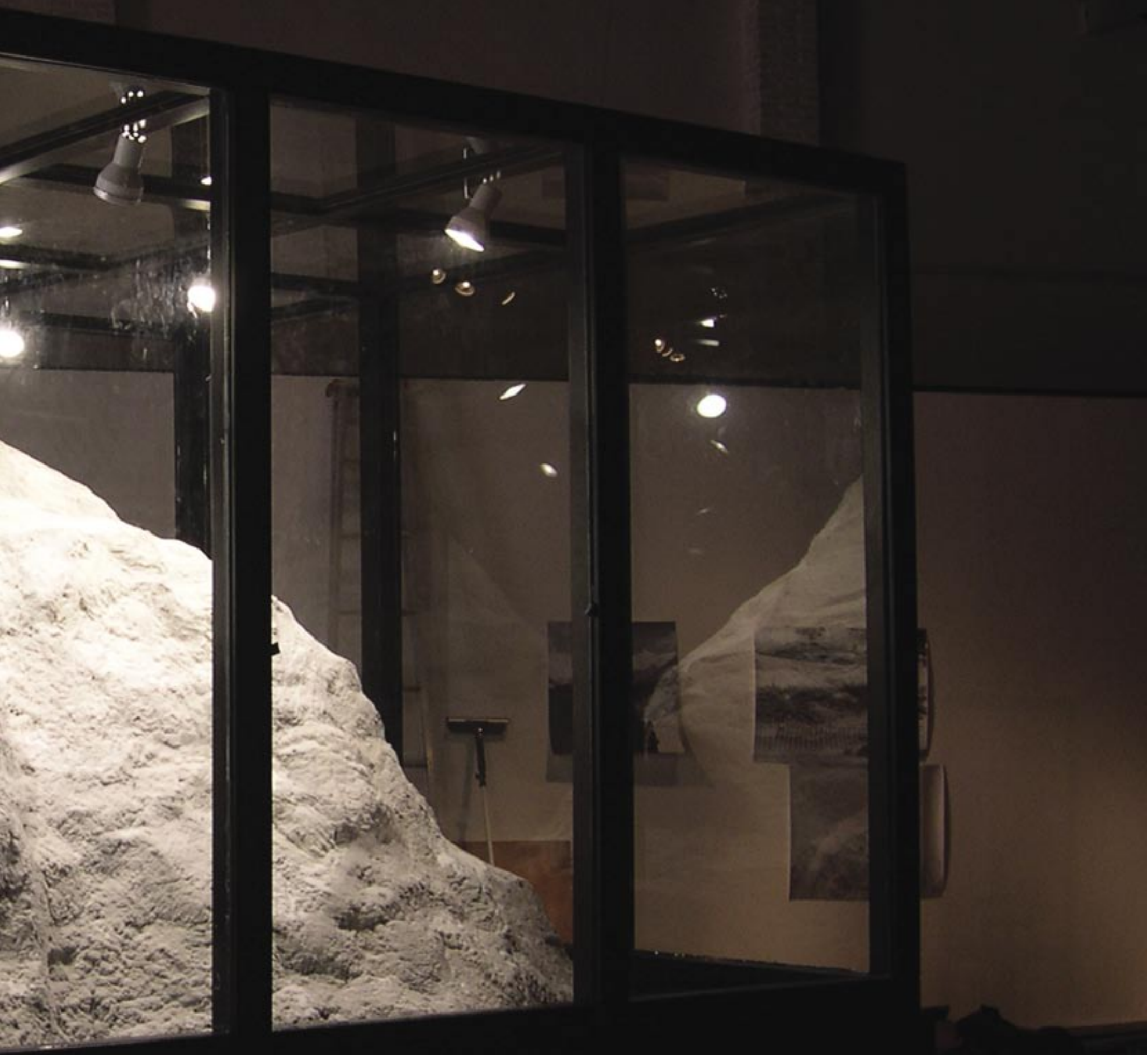
Xu Zhen, 8,848-1.86, 2005, multi media installation, installation shot