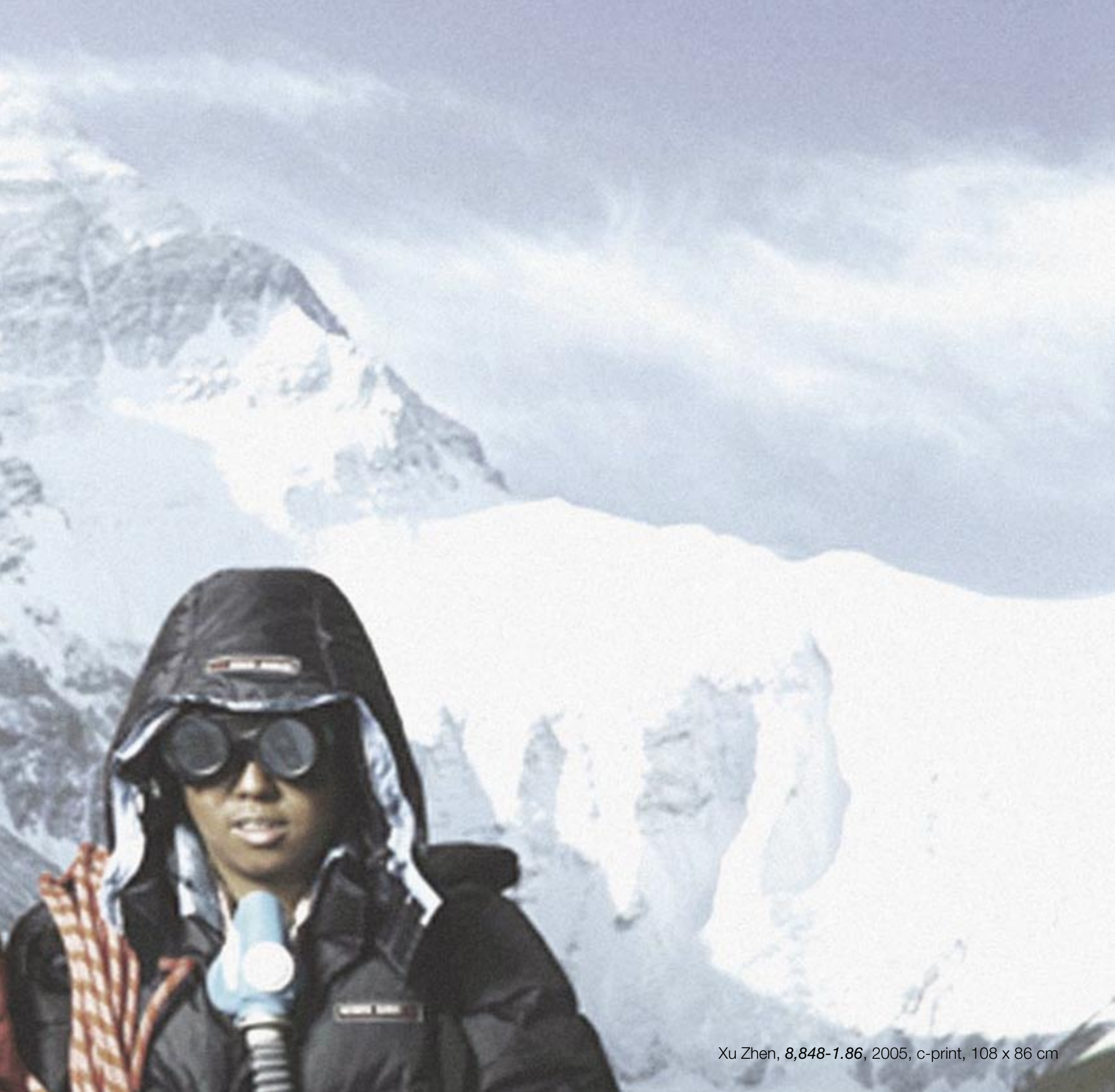
Xu Zhen, 8,848-1.86, 2005, c-print, 108 x 86 cm