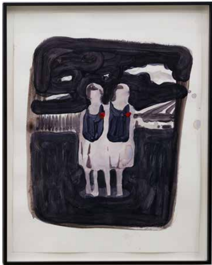
无题之一 Untitled No.1

纸上丙烯 | Acrylic on paper 42*30cm, 2018 LS2_0065-10