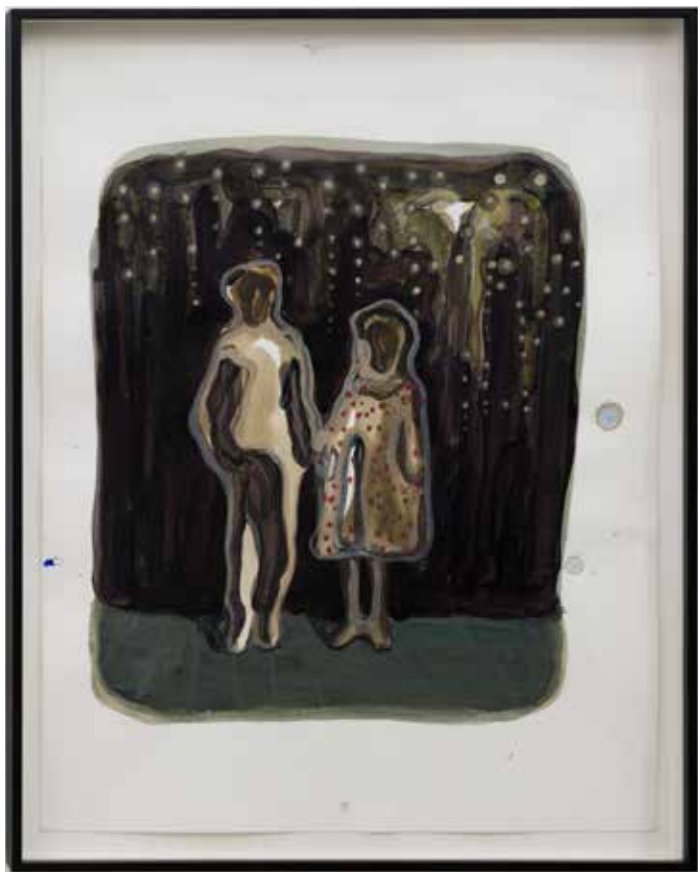
星空之四 Starry Night No.4

纸上丙烯 | Acrylic on paper 42*30cm, 2018 LS2_0065-11