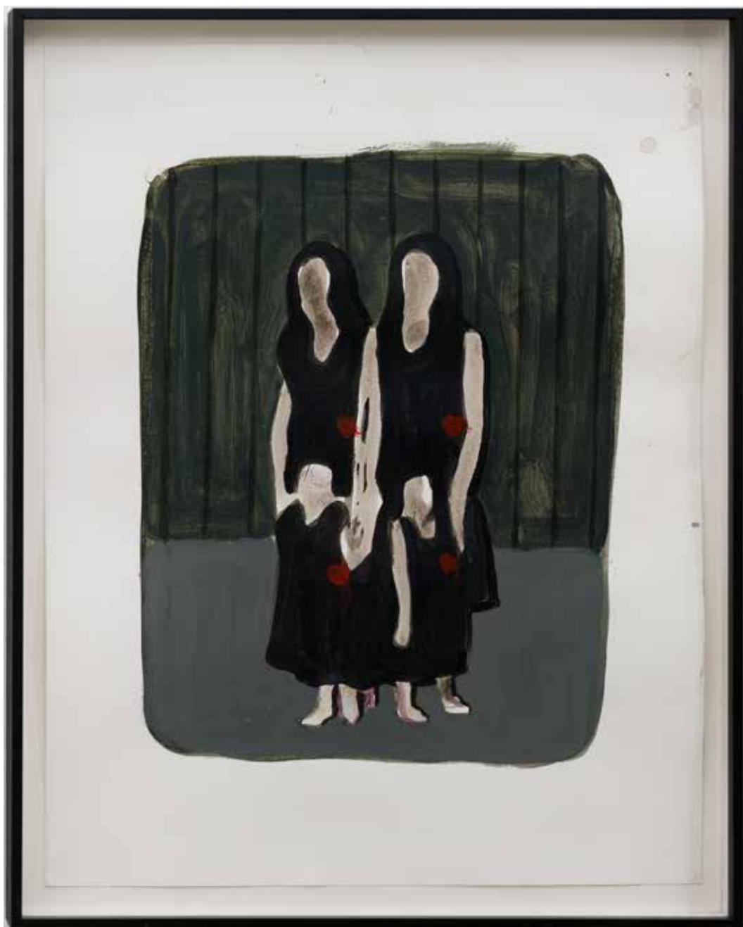
无题之二 Untitled No.2

纸上丙烯 | Acrylic on paper 42*30cm, 2018 LS2_0065-8