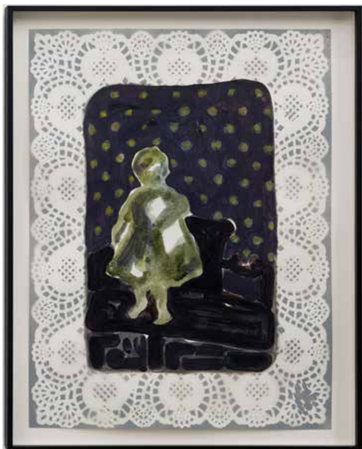
星空之一 Starry Night No.1

纸上丙烯 | Acrylic on paper 42*30cm, 2018 LS2_0065-2