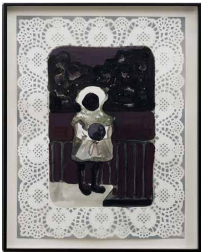
公园 The Park

纸上丙烯 | Acrylic on paper 42*30cm, 2018 LS2_0065-2