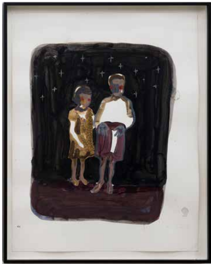
星空之二 Starry Night No.2

纸上丙烯 | Acrylic on paper 42*30cm, 2018 LS2_0065-11