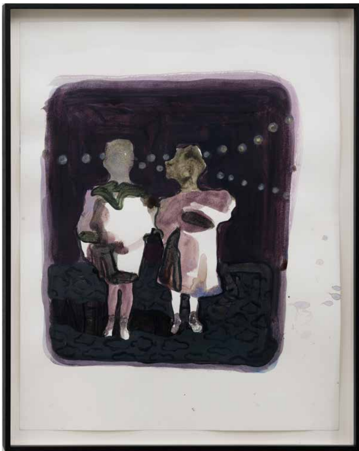
星空之四 Starry Night No.4

纸上丙烯 | Acrylic on paper 42*30cm, 2018 LS2_0065-5