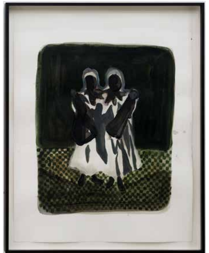
双生手稿之一 Gemination Sketch No.1

纸上丙烯 | Acrylic on paper 42*30cm, 2018 LS2_0065-9