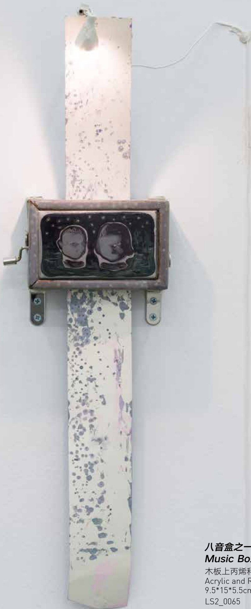
八音盒之一 Music Box No.1

木板上丙烯和树脂 | Acrylic and Resin on Wood 9.5*15*5.5cm LS2_0065