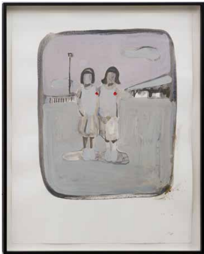
无题之四 Untitled No.4

纸上丙烯 | Acrylic on paper 42*30cm, 2018 LS2_0065-10