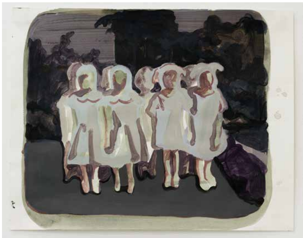
回忆墙 Memory Wall

纸上丙烯 | Acrylic on paper 24*17cm, 2018 LS2_7736-11