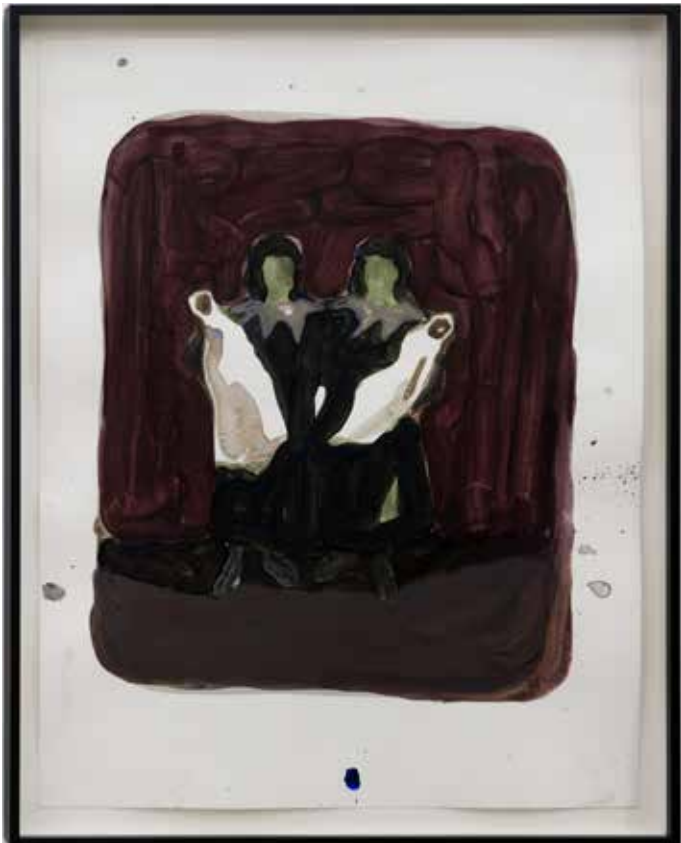
无题之三 Untitled No.3

纸上丙烯 | Acrylic on paper 42*30cm, 2018 LS2_0065-9