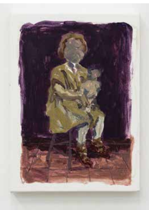
回忆墙 Memory Wall

纸上丙烯 | Acrylic on paper 24*17cm, 2018 LS2_7736-11