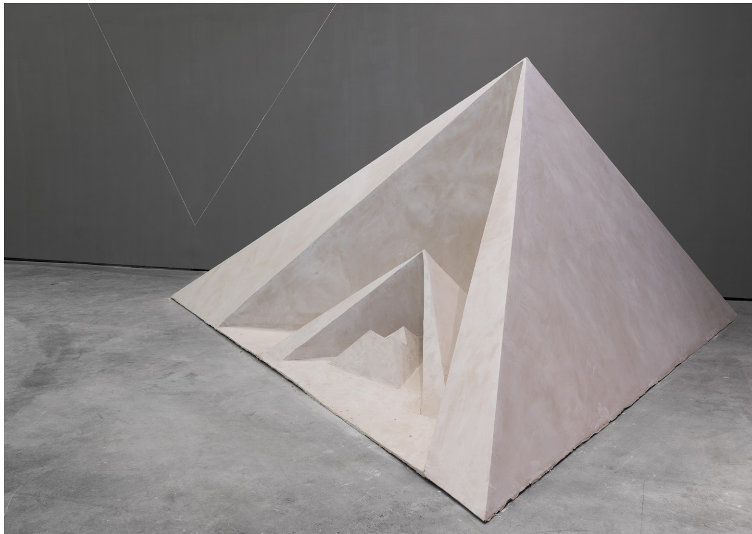
体积 - 香格纳 M50 06 Volume - ShanghART M50 06