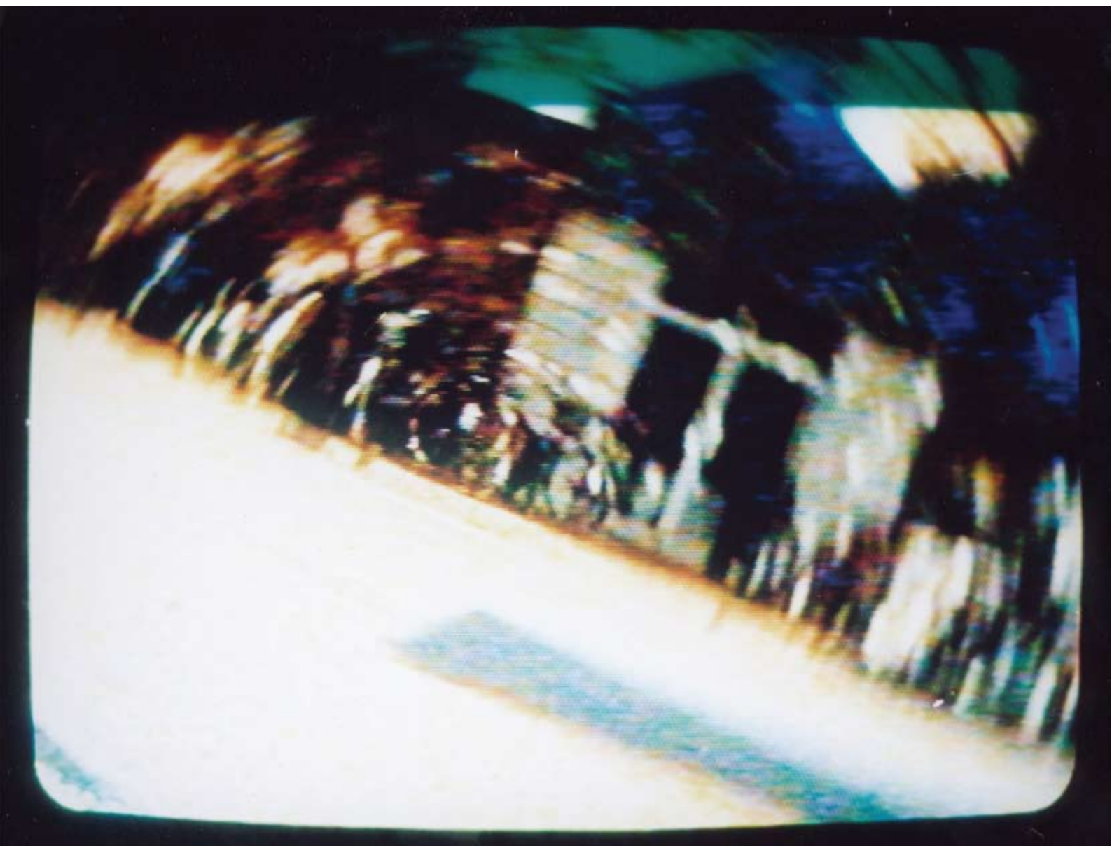
Zhu Jia, Forever (1994), video installation, 27'