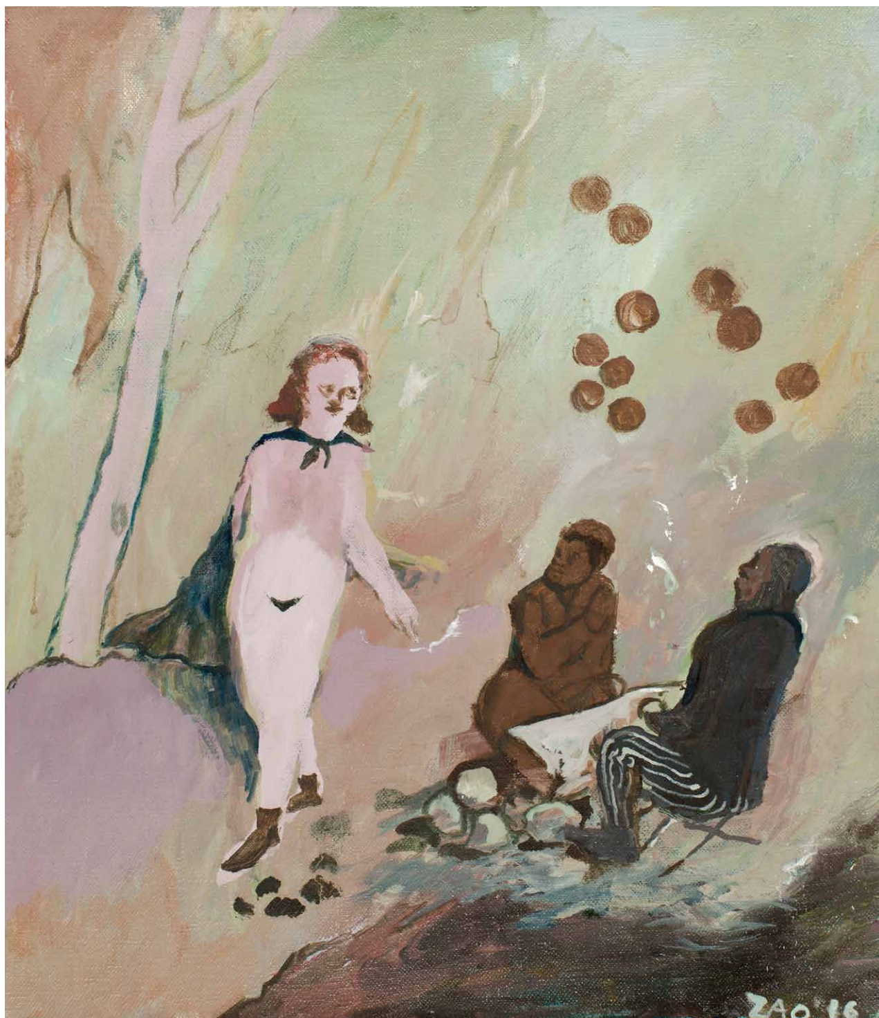
罗马是个湖 - 飞行与火焰 2 Roma Is a Lake - Flight and Flame 2 , 2016 布面油彩 & 丙烯 Oil & Acrylic on Canvas 47x41cm | ZY_7387