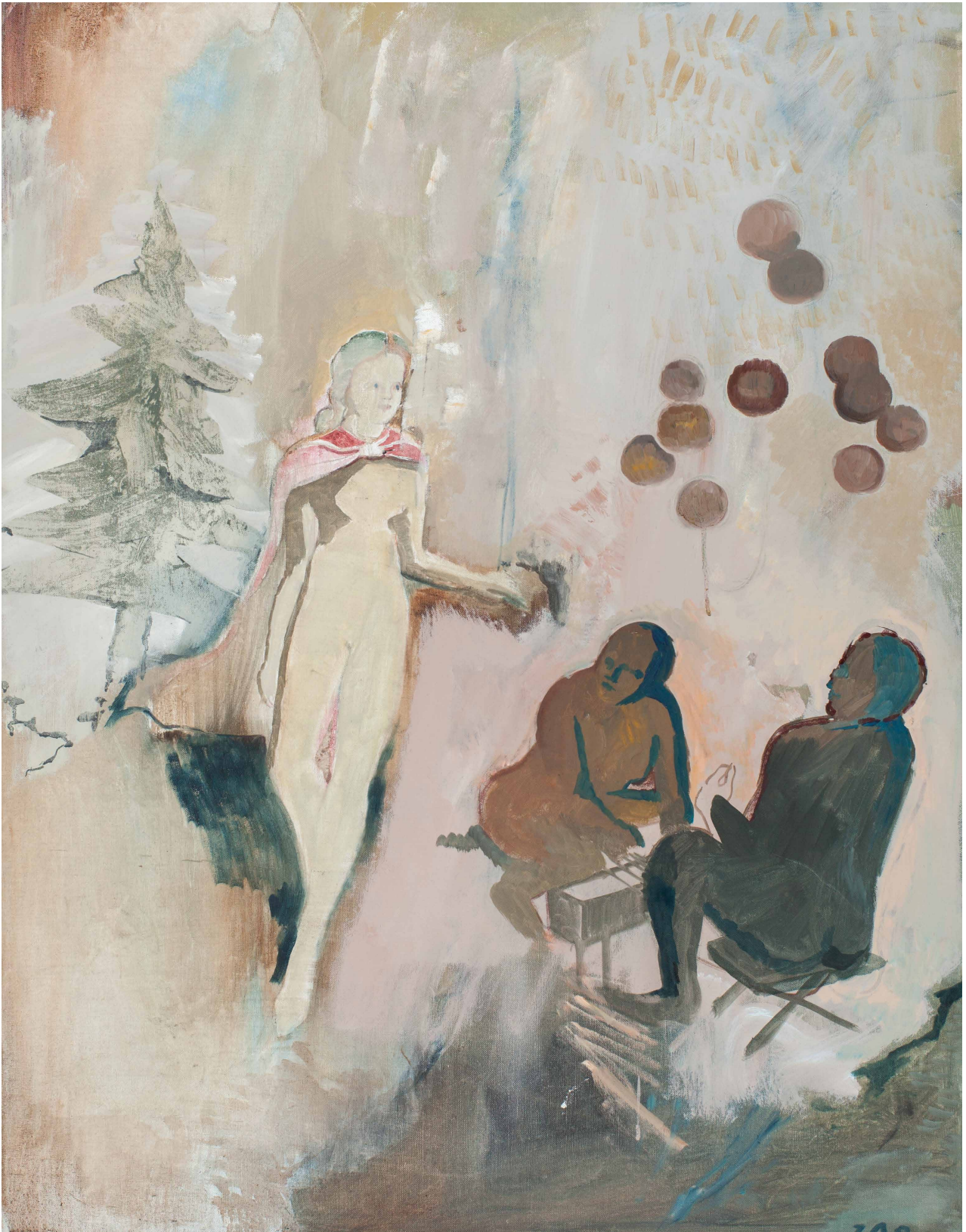
罗马是个湖 - 飞行与火焰 1 Roma Is a Lake - Flight and Flame 1 , 2014 布面油画 Oil c on Canvas 90x70cm | ZY_4704