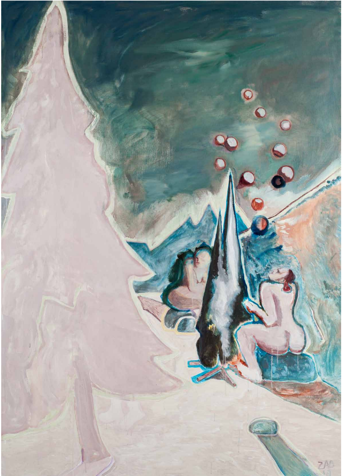
罗马是个湖 - 飞行与火焰 4 Roma Is a Lake - Flight and Flame 4 , 2019 布面油彩 & 丙烯 Oil & Acrylic on Canvas 210x150cm | ZY_8457