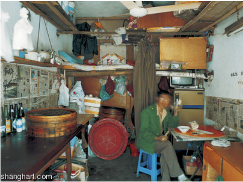
shanghart.com HY_SH51, p.140