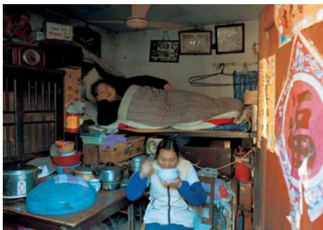
HY_SH74, p. 40