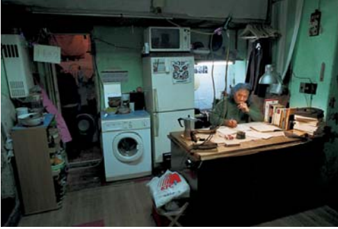
HY_SH68, p. 120