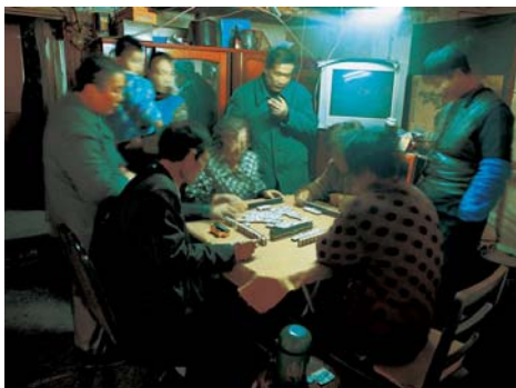
HY_SH73, p. 135