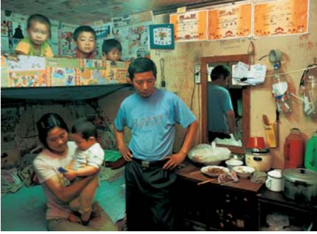
HY_SH61, p. 144