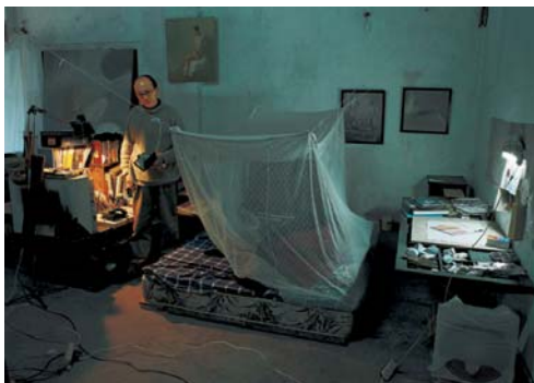
HY_SH64, p. 71