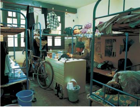
HY_SH52, p. 56