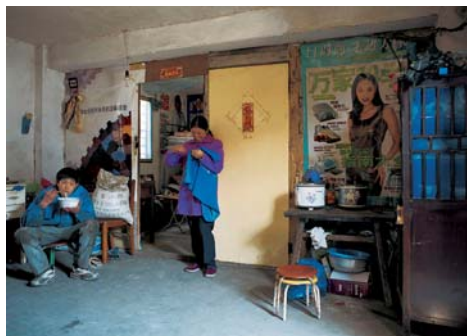
HY_SH59, p. 137