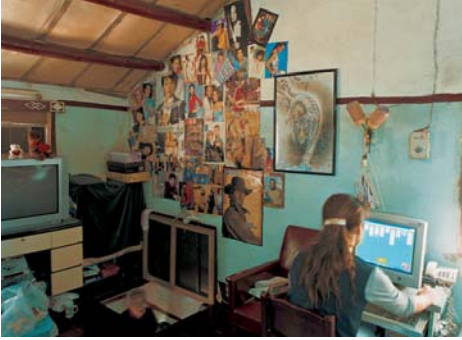
HY_SH76, p. 156