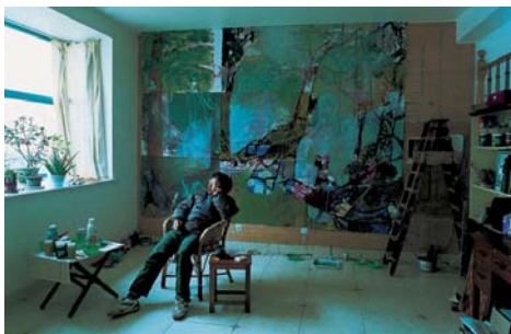
HY_SH60, p. 68