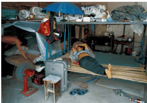
HY_SH53, p. 76