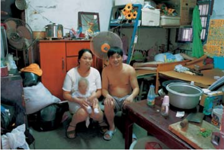
HY_SH62, p. 160