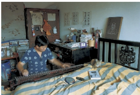
HY_SH78, p. 130