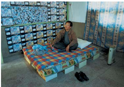
HY_SH56, p. 52