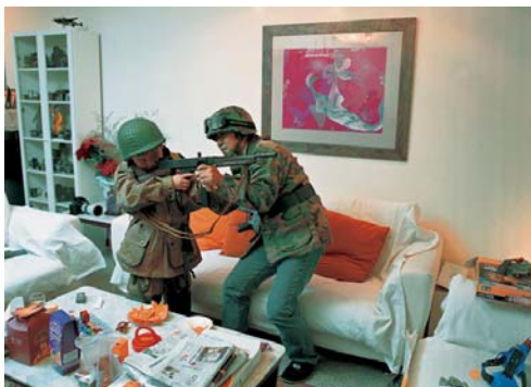
HY_SH151, p. 159