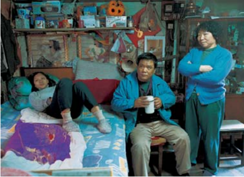
HY_SH81, p. 149