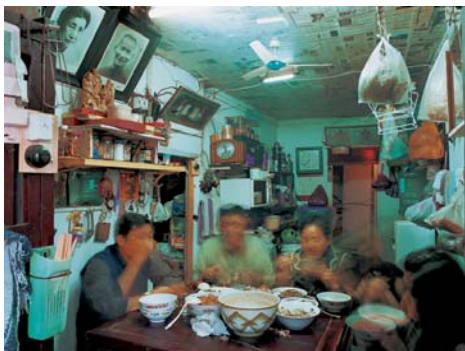
HY_SH69, p. 132