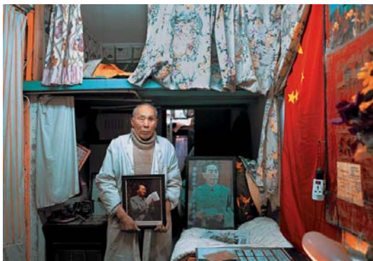
HY_SH160, p. 115