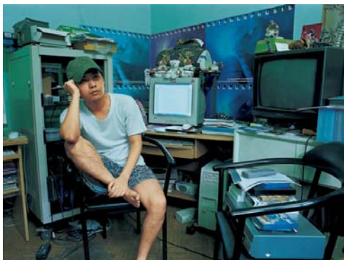
HY_SH58, p. 89