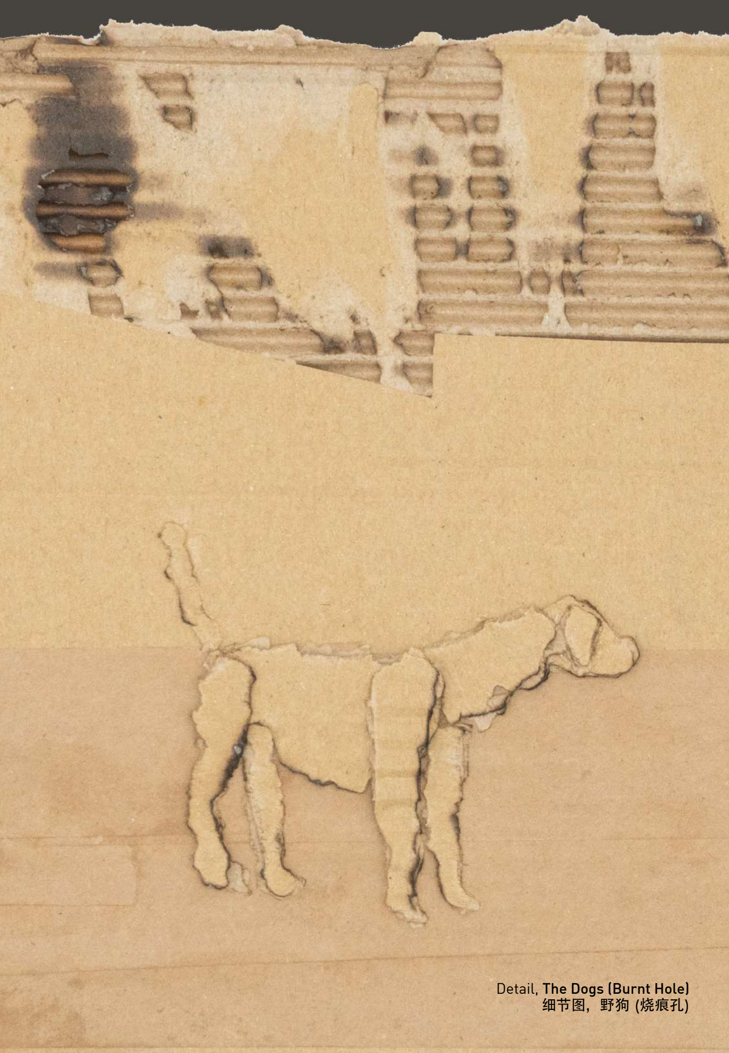
Detail, The Dogs (Burnt Hole) 细节图, 野狗 (烧痕孔)