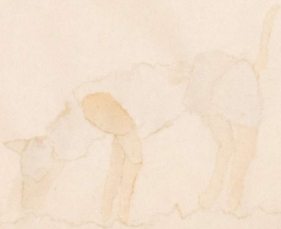
Detail, The Dogs (Grazing) 细节图, 野狗 (觅食)