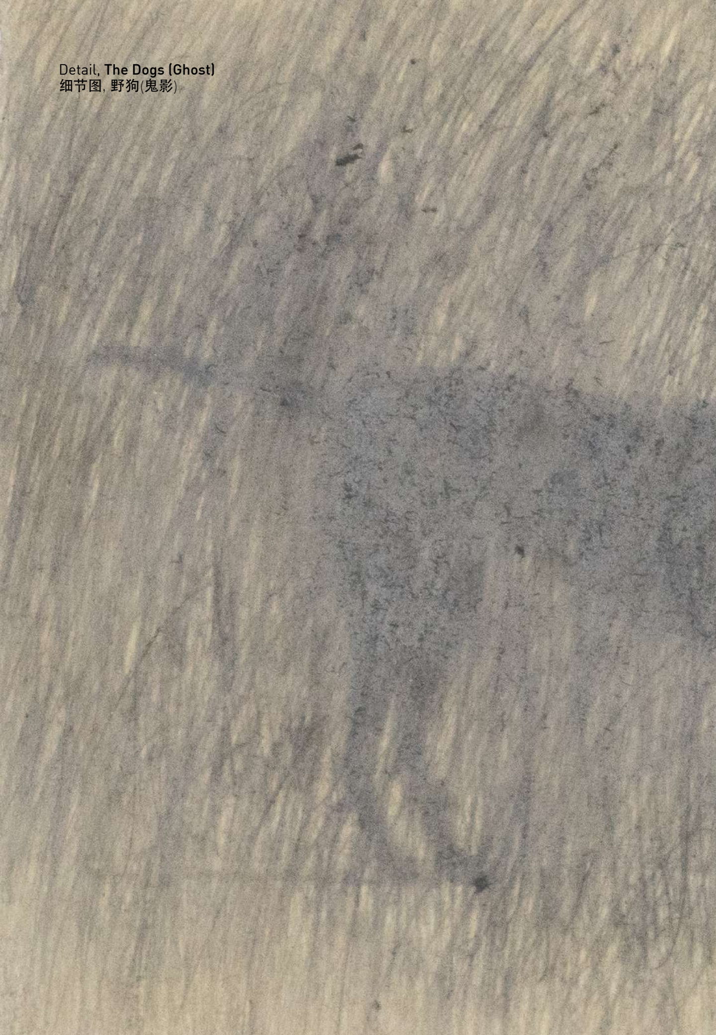
Detail, The Dogs (Ghost) 细节图, 野狗(鬼影)