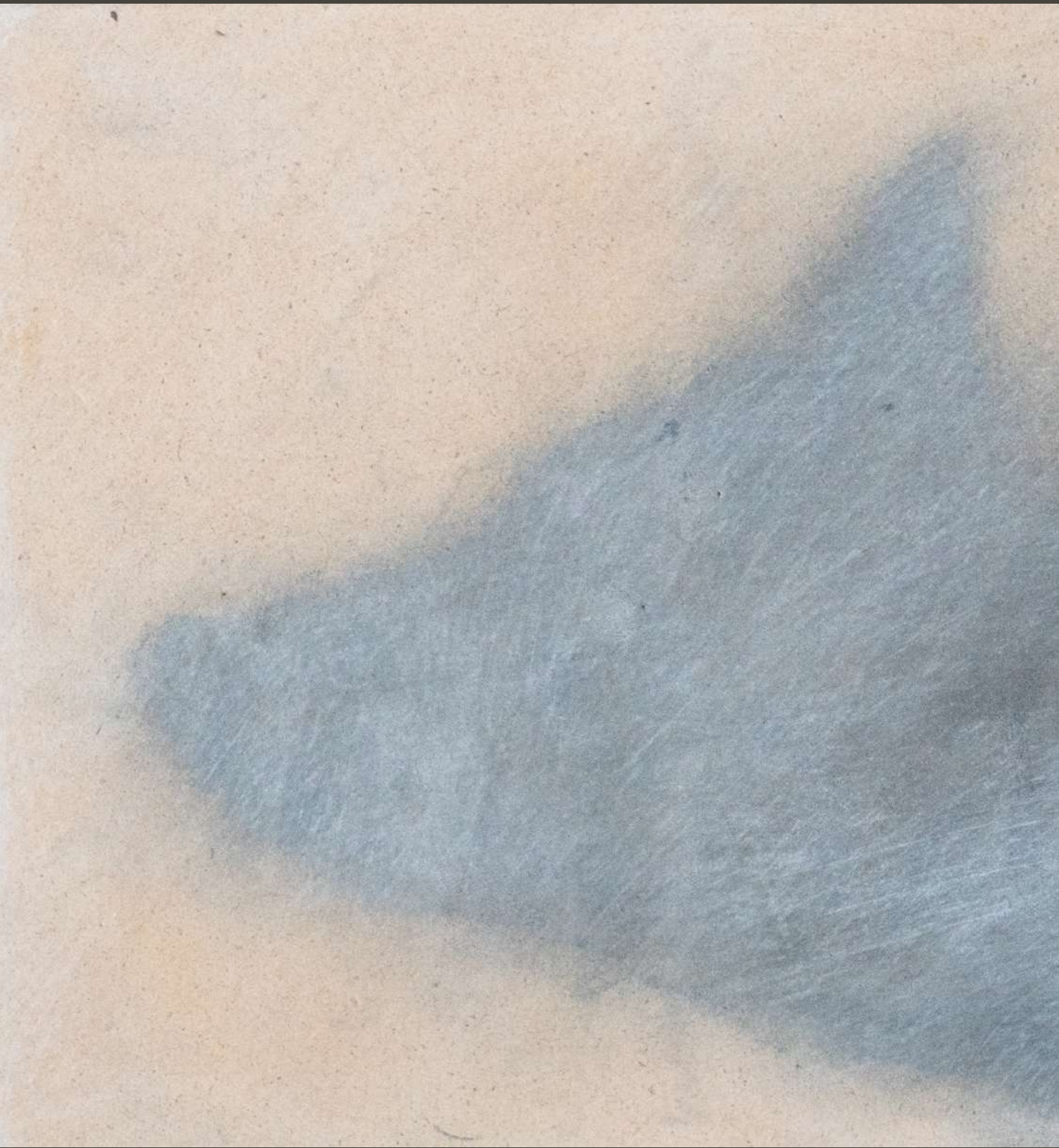
Detail, The Dogs (Love) 细节图, 野狗(爱)