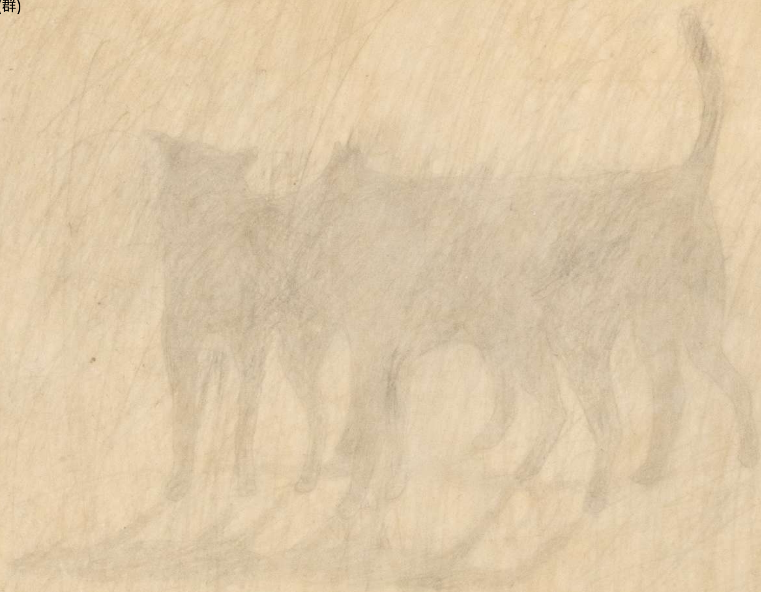
Detail, The Dogs (Group) 细节图, 野狗 (群)