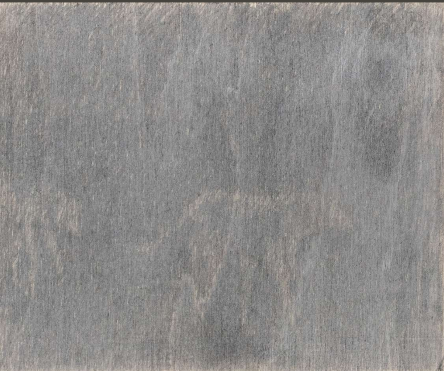
Detail, The Dogs (Mexico) 细节图, 野狗 (墨西哥)