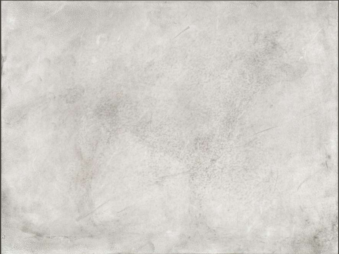
The Dogs (Tall) 野狗 (高) 2025

Soft pastel on gesso board 软粉彩绘于石膏板 Grey pinewood frame with museum glass 灰色松木框配博物馆级玻璃 22.5(H)*30*2cm | Framed 62(H)*79*4.5cm LYT_3188