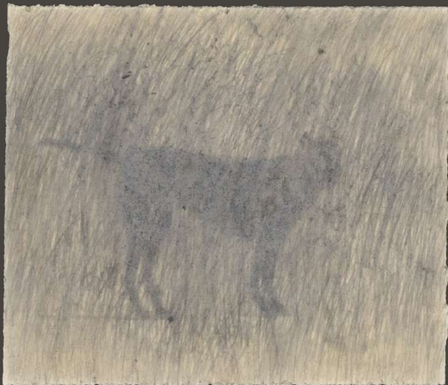
The Dogs (Ghost) 野狗(鬼影) 2025

Graphite on paper, beeswax 石墨绘于纸本, 蜂蜡 Grey pinewood frame with museum glass 灰色松木框配博物馆级玻璃 17(H)*19.5cm | Framed 47(H)*62*4.5cm LYT_5394