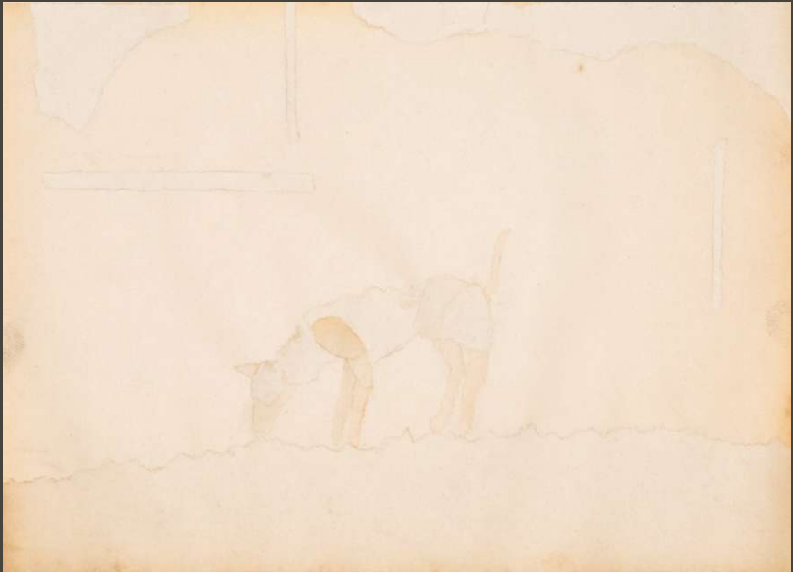
The Dogs (Grazing) 野狗 (觅食) 2025