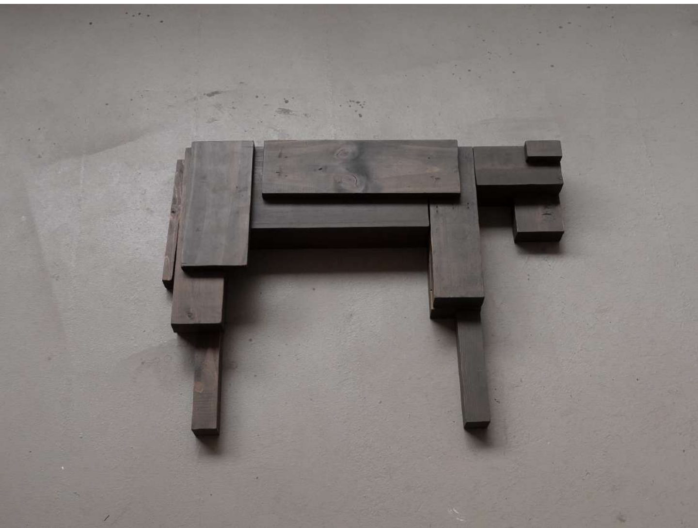
Dog (Greywash) 狗 (灰洗) 2025

Emulsion paint on pine wood 乳胶漆绘于松木 55(H)*80*12cm LYT_2910