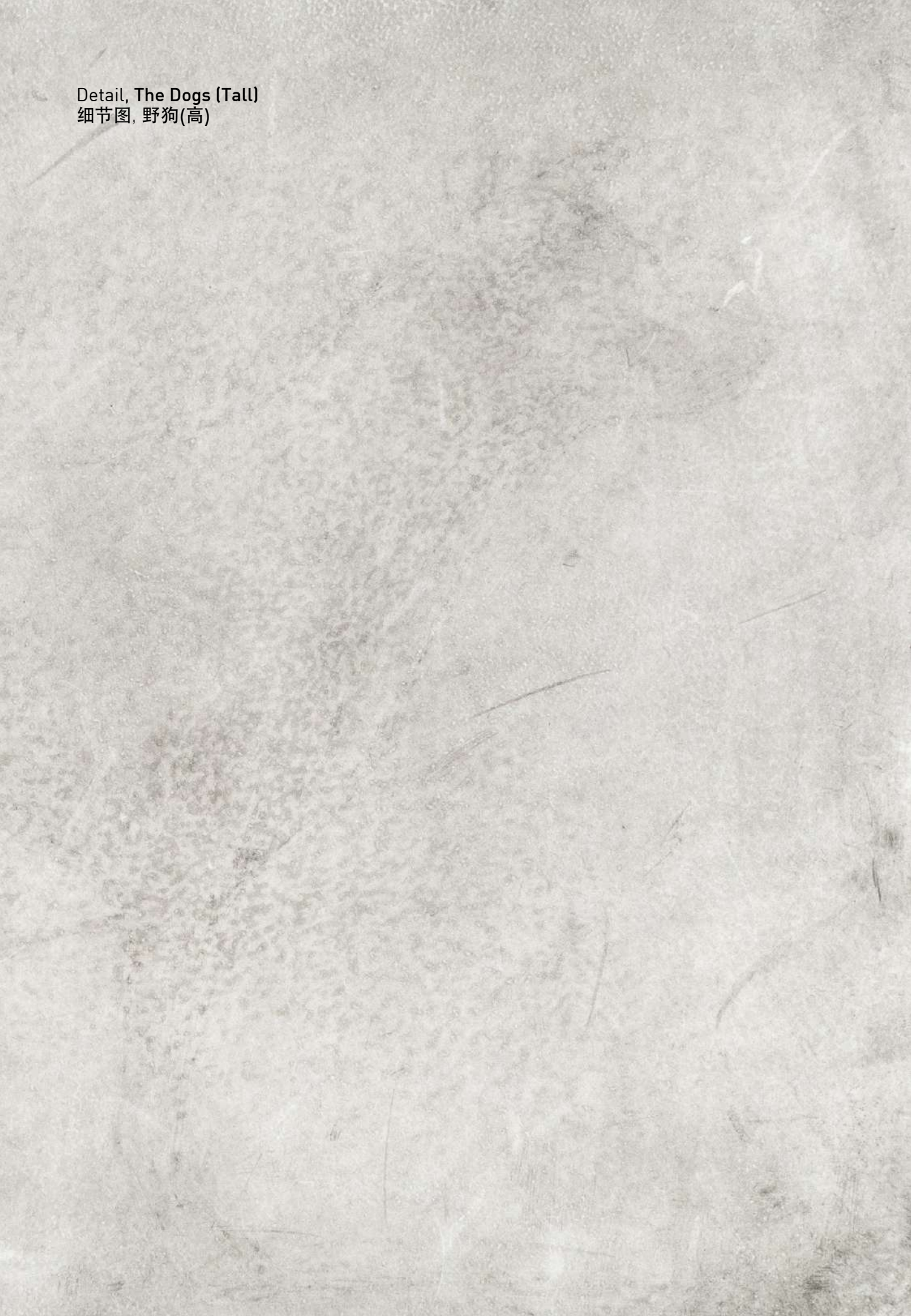
Detail, The Dogs (Tall) 细节图, 野狗(高)