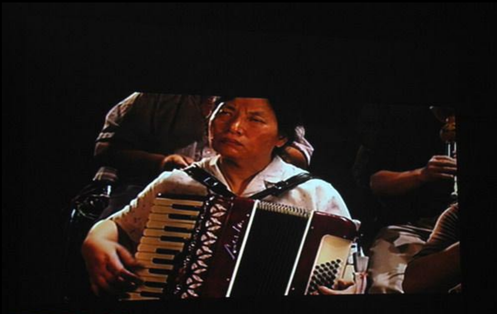
Love you big boss(2008) color video, 4'