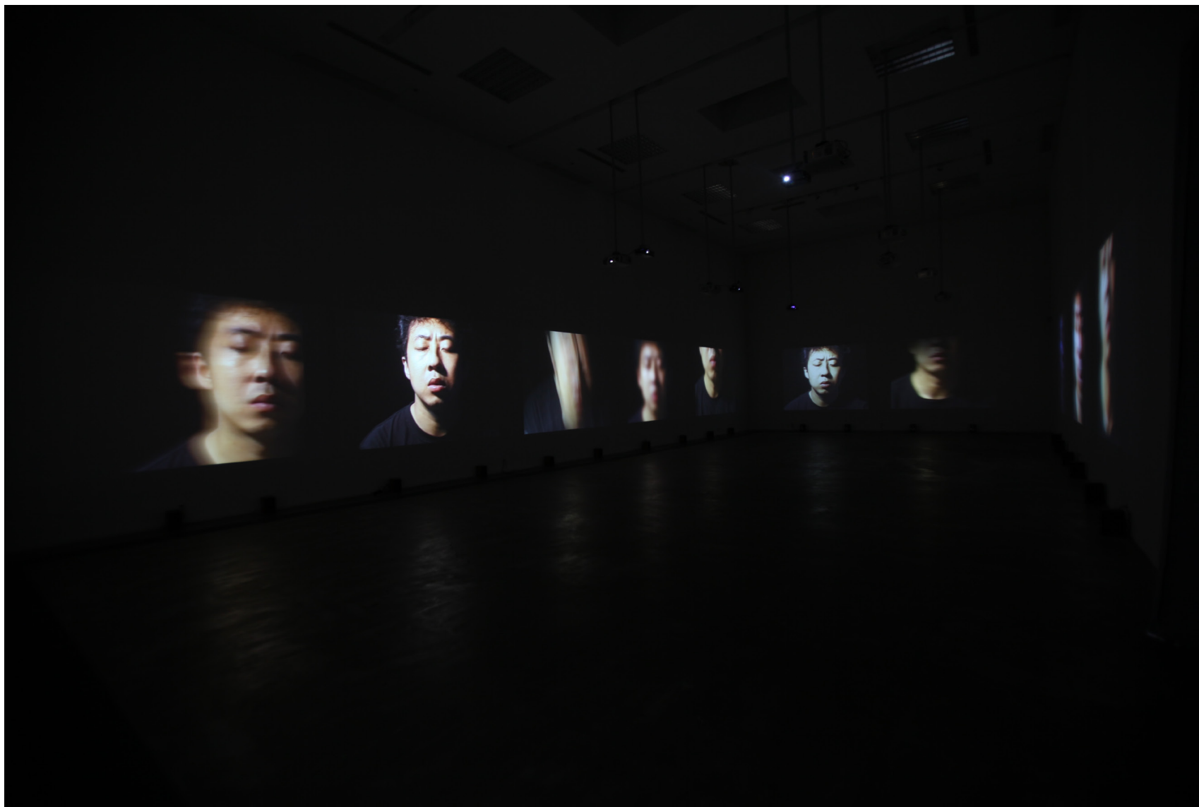
不要动 | Don't Move 尺寸可变 录像装置 | VideoInstallation (12DVD) Edition of 3 2001