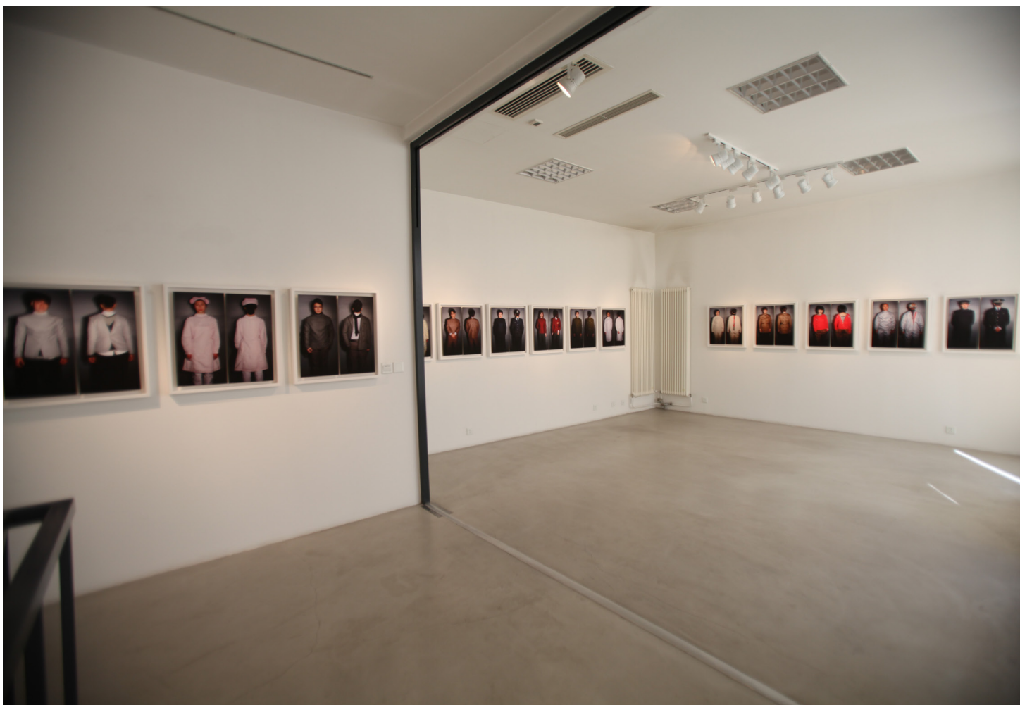
无题 | Wrong Way Round 60.0×28.0 cm (24" × 11") 摄影 | C-Print 2011