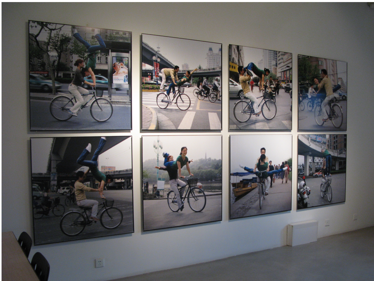
自行车 2 | Cycle Arobics (Level 2) 100.0×100.0 cm×8 Pieces (17"×20") 摄影 | Photo (C-Print) Edition of 5 2005