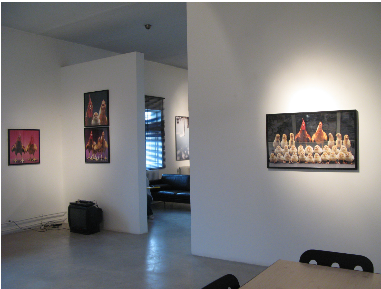
全家福 | Lucky Family 摄影 | Photo (C-Print) Edition of 10 1995