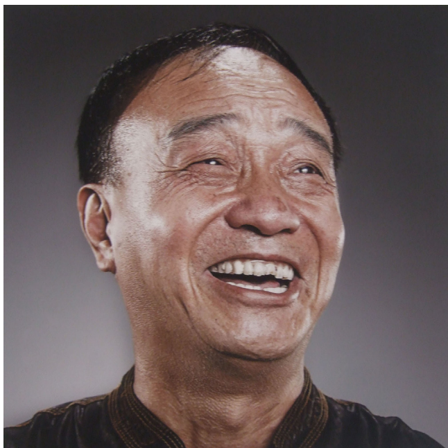
临时演员 | Extras 100.0×100.0 cm (39"×39") 摄影 | Photo (C-Print) Edition of 3 2010