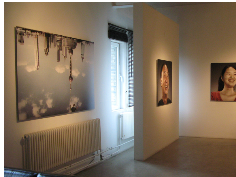
轻而易举 1 | Light as Fuck 1 120.0×80.0 cm (47"×31") 摄影 | Photo (C-Print) Edition of 10 2002