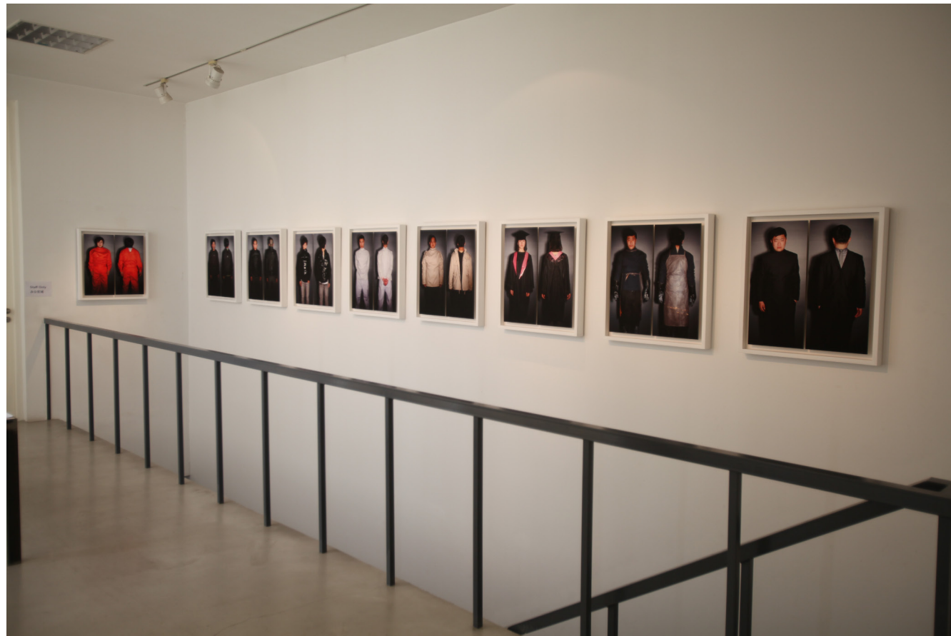
无题 | Wrong Way Round 60.0×28.0 cm (24" × 11") 摄影 | C-Print 2011

照片中的人物来自各行各业。他们虽然身着各自的衣服或者工作制服，前后却被穿反了。每个人物分别有面对和背对镜头两个画面，肖像的正反面构成一组照片。他们或是脸面对观众，而身上的衣服为背面；或是他们的社会身份（制服）正对观众，而脸却是隐匿着的。