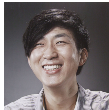
临时演员 | Extras 100.0×100.0 cm (39"×39") 摄影 | Photo (C-Print) Edition of 3 2010