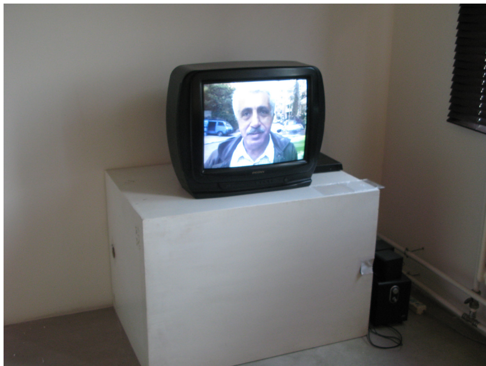
我会死的 | I Will Die 1 hour 57minutes 57 seconds 录像(单路) | Video (Single Channel) 2000-2005