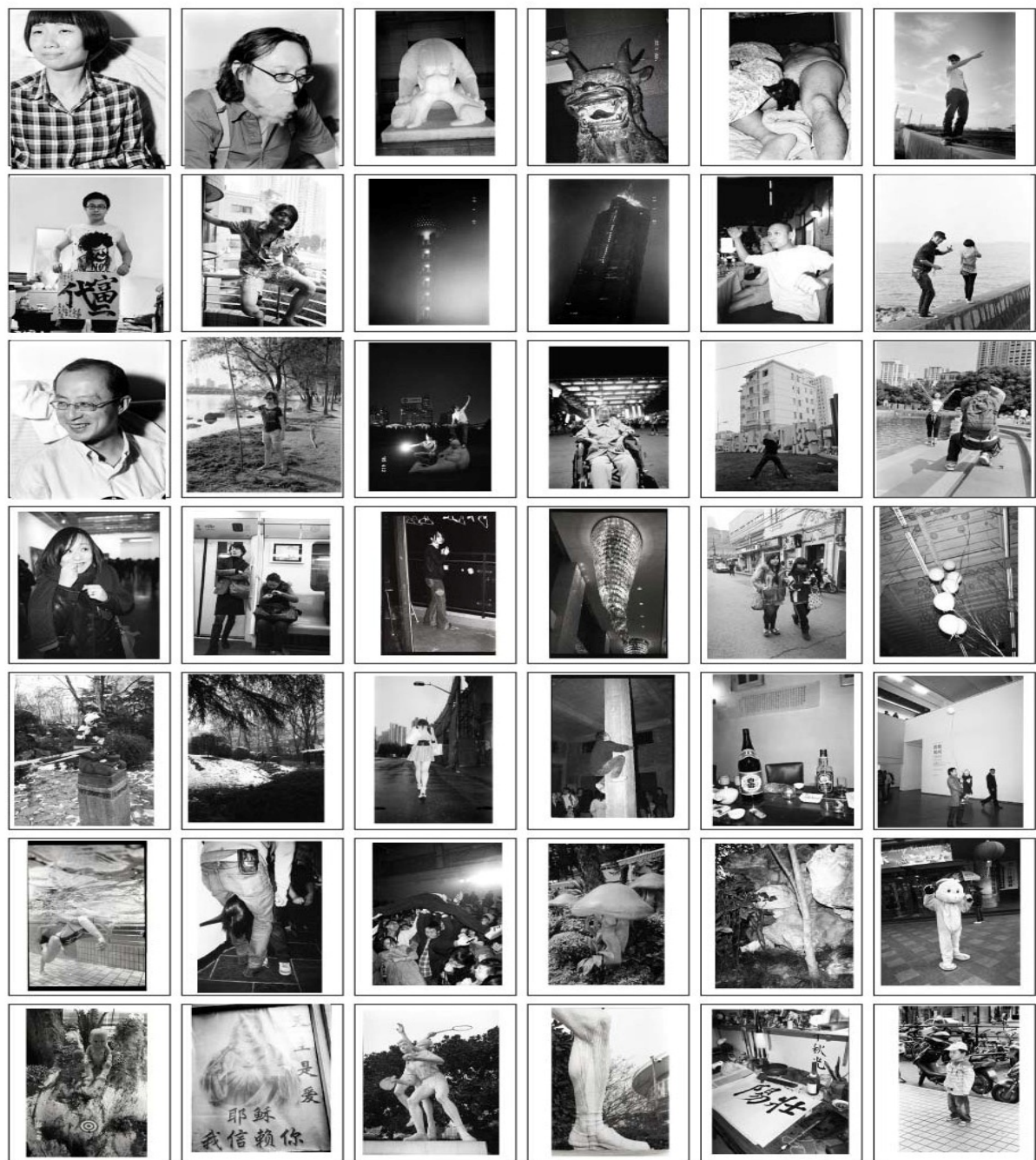
60x50cm each (including the white border) , 98pieces, b&w photo