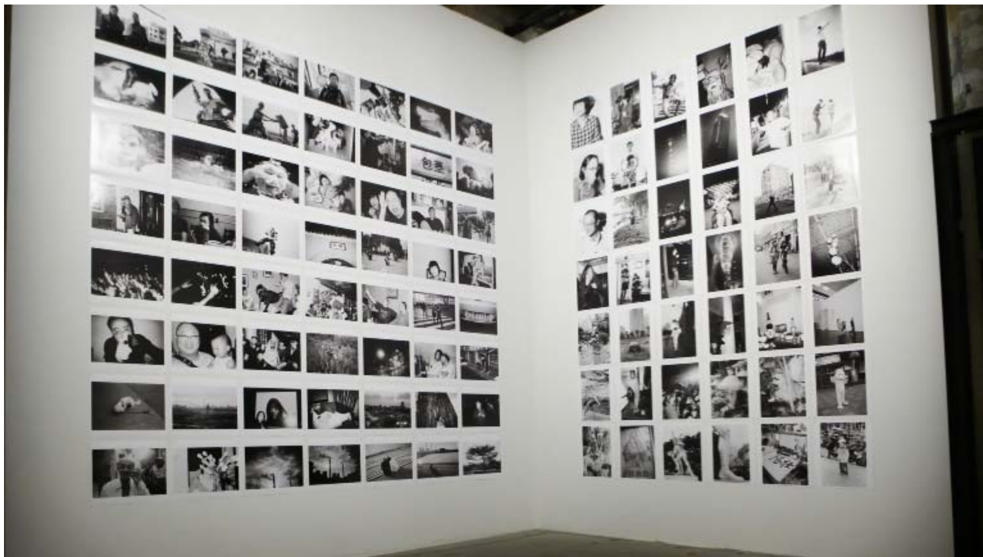
Installation view, 54th Venice Biennale, Arsenale, Venice, 2011.