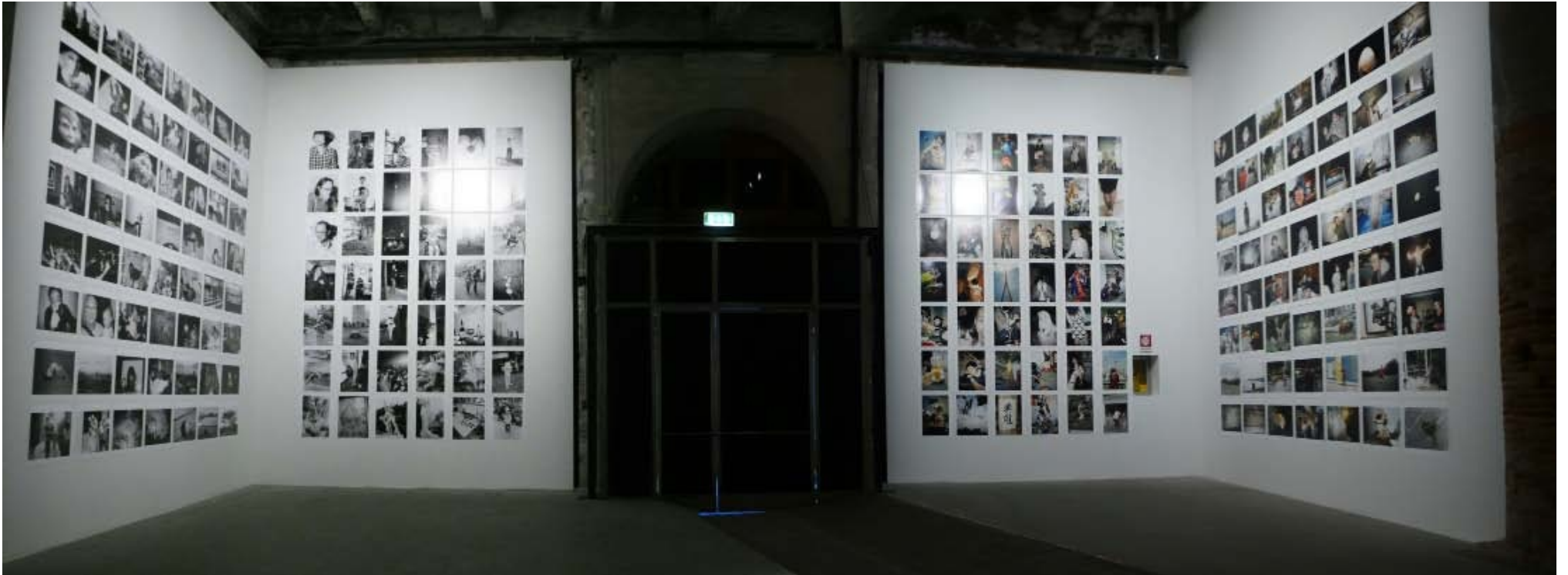
Installation view, 54th Venice Biennale, Arsenale, Venice, 2011.