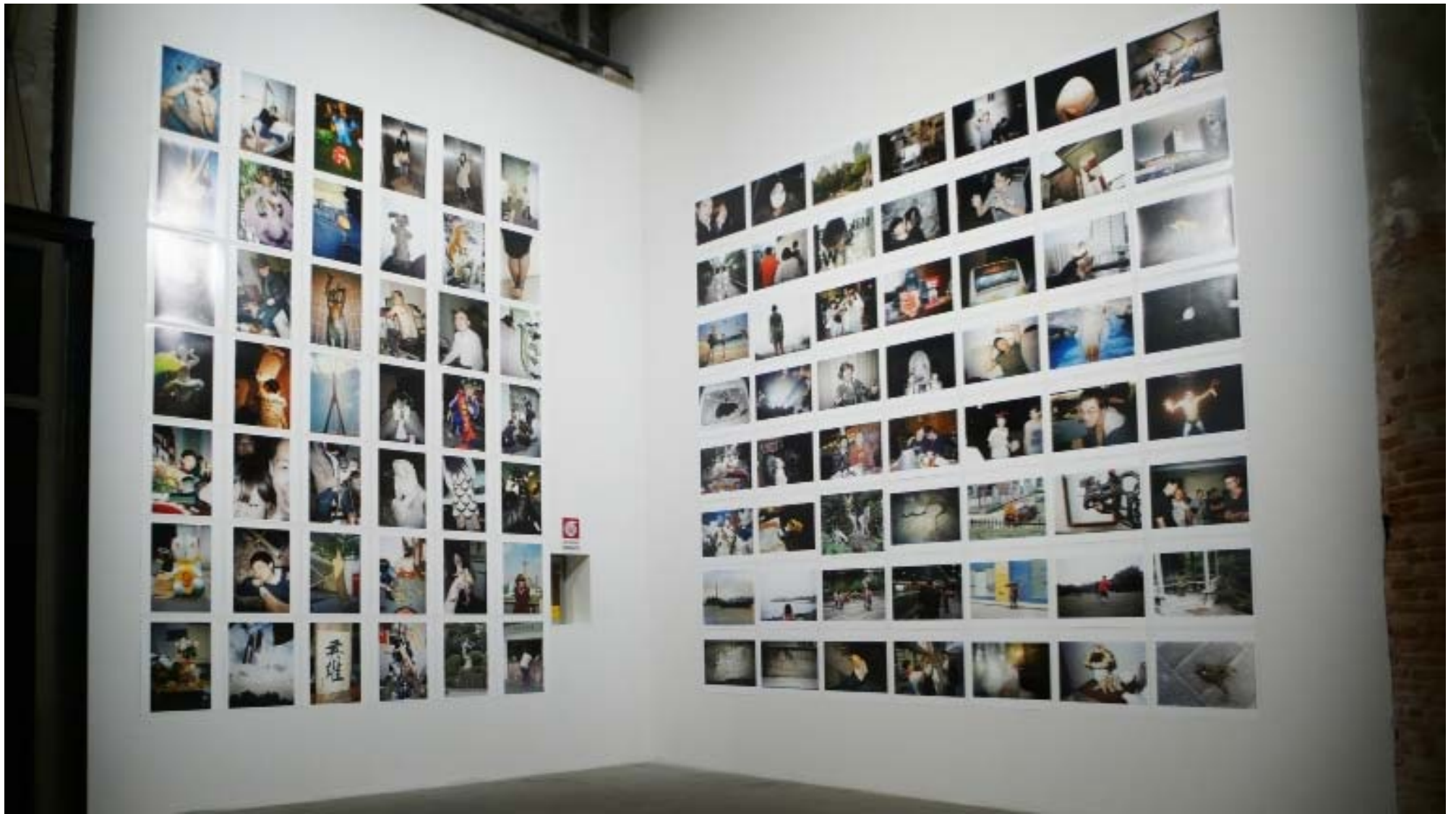
Installation view, 54th Venice Biennale, Arsenale, Venice, 2011.