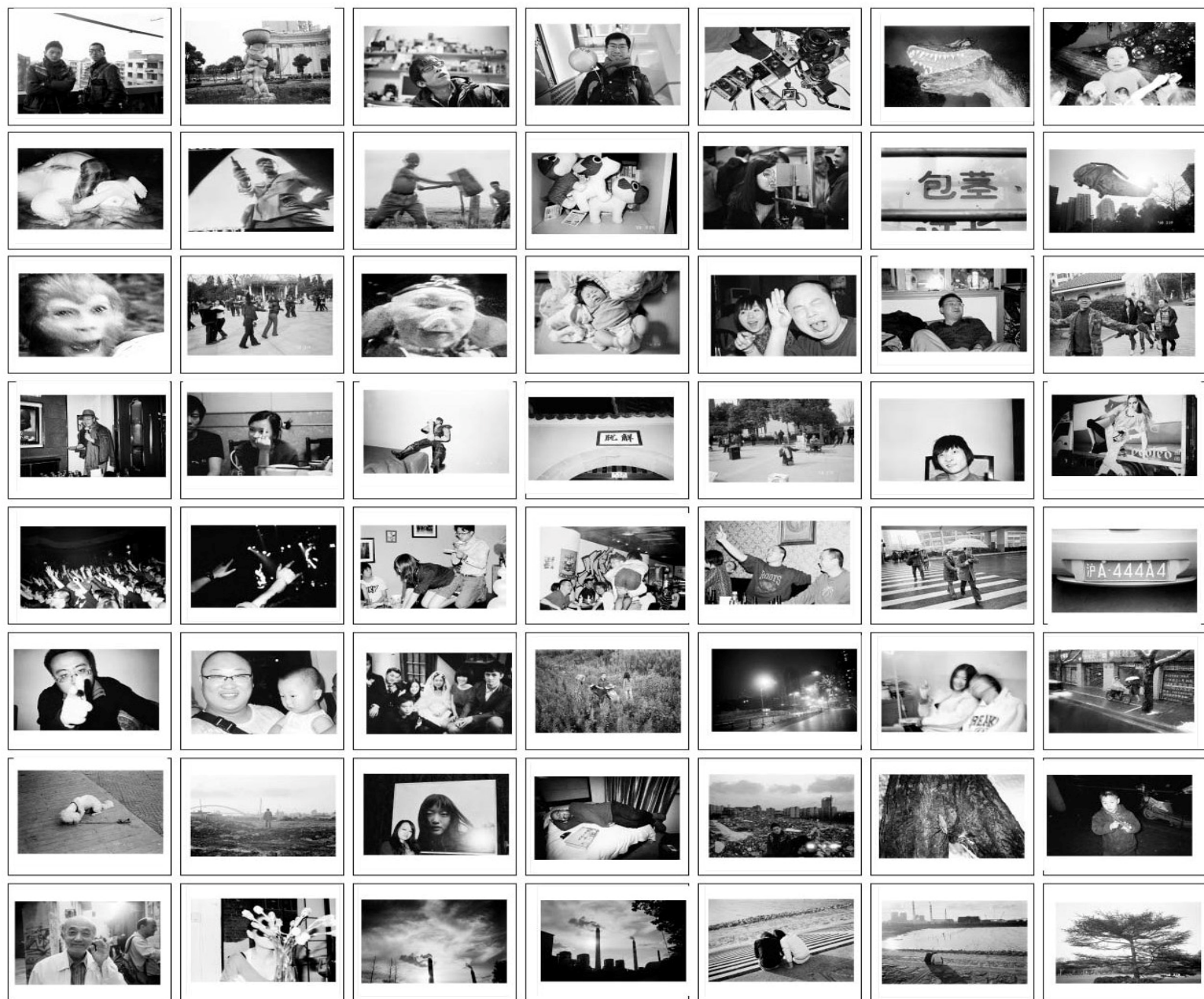
50x60cm each (including the white border) , 98pieces, b&w photo