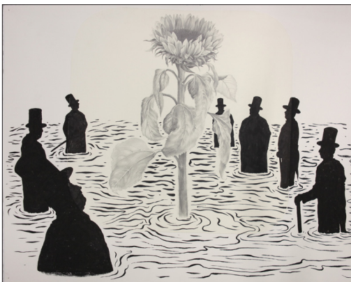
Clown's Revolution, 2010, Sun Xun