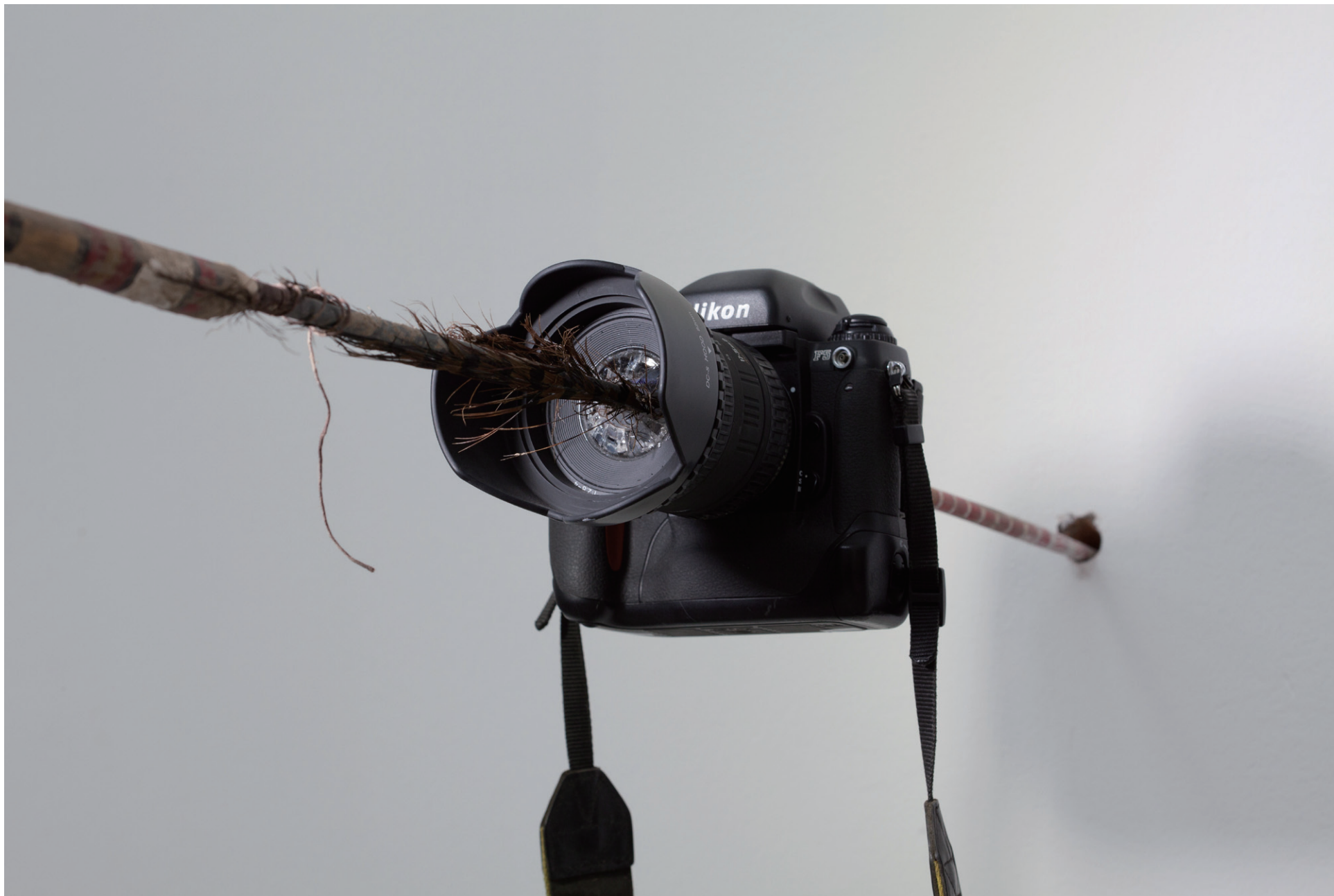
Focus , 2011, 18.0 * 22.0 * 235.0 cm , Camera (NIKON F5), aboriginal spear, Variable dimensionw