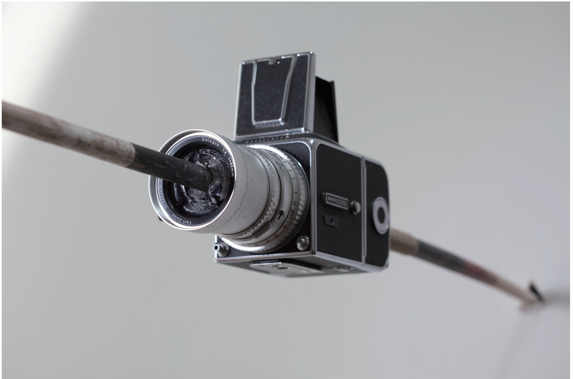
Focus , 2011 12.0 * 18.0 * 210.0 cm Camera (HASSELBLAD 500C/M), aboriginal spear, Variable dimensionw