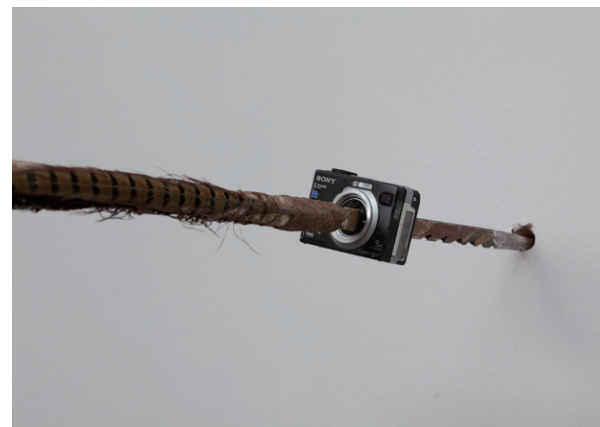
Focus , 2011 Camera (SONY DSC-W5), aboriginal spear Variable dimension 10.0 * 12.0 * 196.0 cm