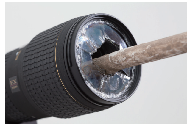
Focus , 2011 CANON EOS-20D, aboriginal spear Variable dimension 16.0 * 18.0 * 233.0 cm