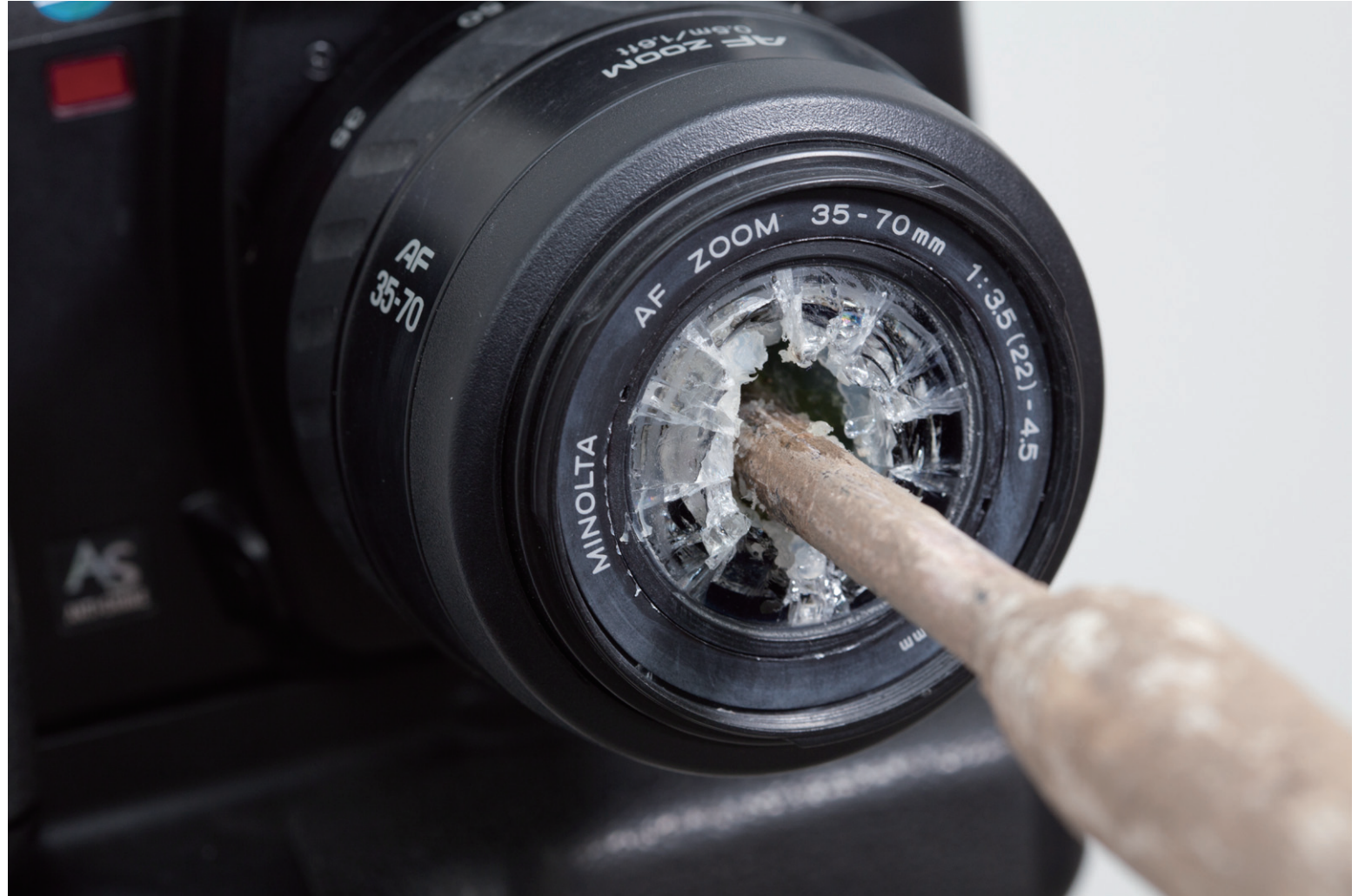
Focus , 2011 KONICA MINOLTA a-7, aboriginal spear Variable dimension 16.0 * 18.0 * 233.0 cm