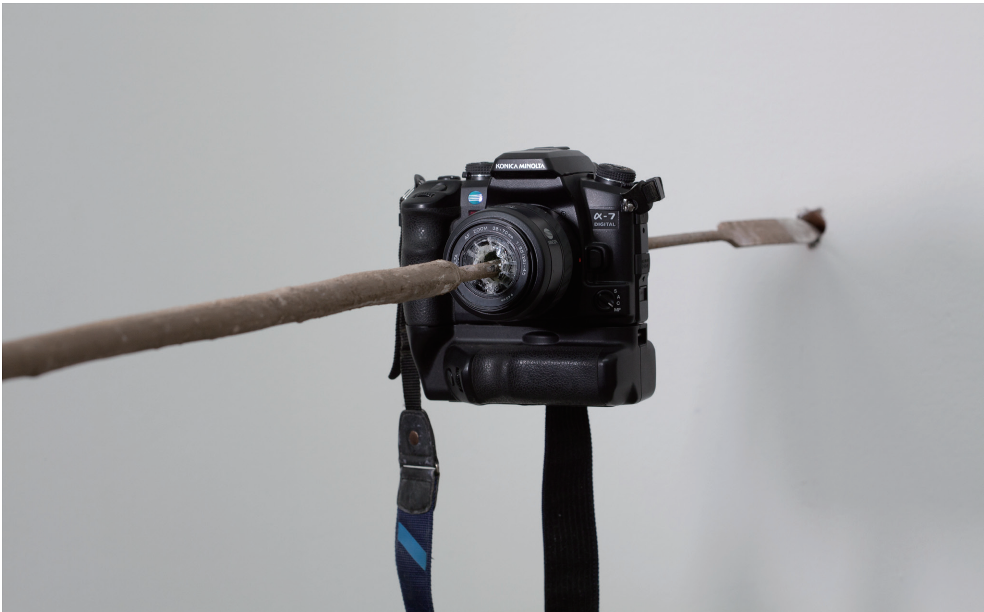
Focus , 2011 18.0 * 22.0 * 235.0 cm Camera (KONICA MINOLTA α-7), aboriginal spear Variable dimension