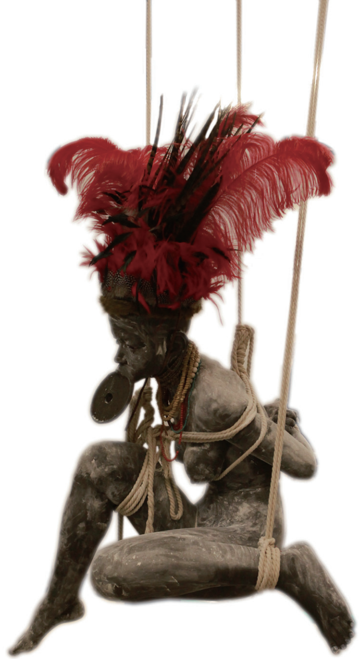
Madeln Company Play-1 2011 170.0 * 80.0 * 80.0 cm Silicon, iron, cotton filling, hemp cordage, fur, feathers, shells