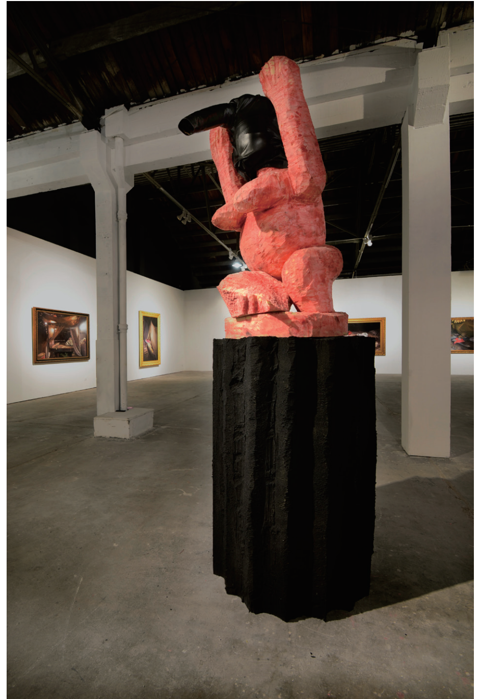
Madeln Company, inity-Game, 2011 , 160.0 * 80.0 * 110.0 cm , Polyurethane foam, cow leather, leather jacket, sensual low temperature wax