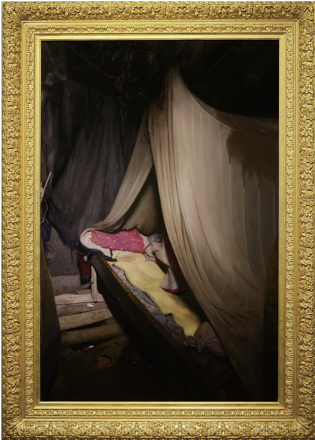
MadeIn Company Miao Residence, Malin Village, Xishui District, Guizhou, Province, China 2011 126.0 * 190.0 cm Oil on canvas