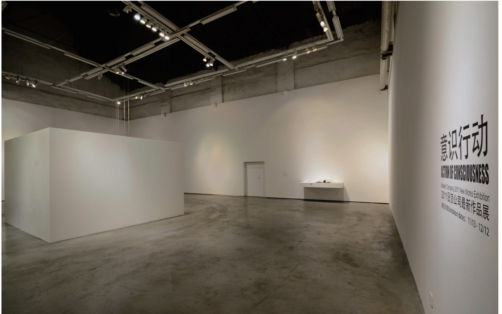
Main space Building 16