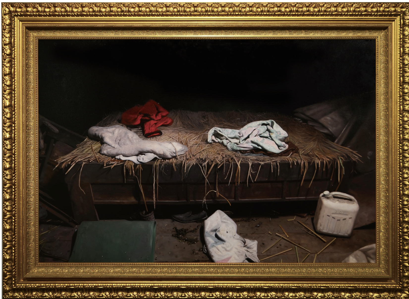
Madeln Company Liujiào Tian, Xichishui District, Zunyi Town, Guizhou Province, China 2011 126.0 * 190.0 cm Oil on canvas