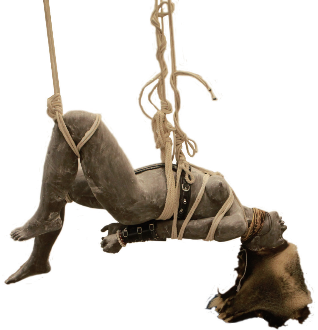
Madeln Company Play-2 2011 80.0 * 160.0 * 60.0 cm Silicon, iron, cotton filling, hemp cordage, fur, feathers, shells