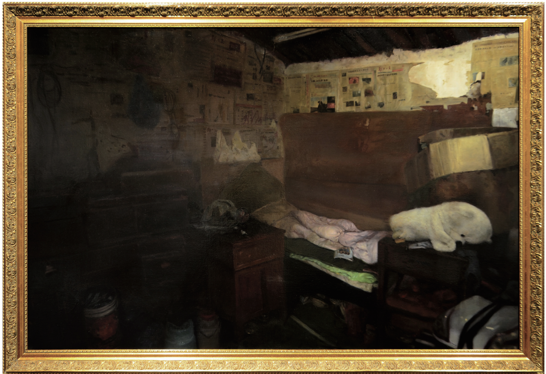
MadIn Company Qilianshan Road and Qihua Road crossroad, Putuo District, Shanghai, China 2011 146.0 * 210.0 cm Oil on canvas