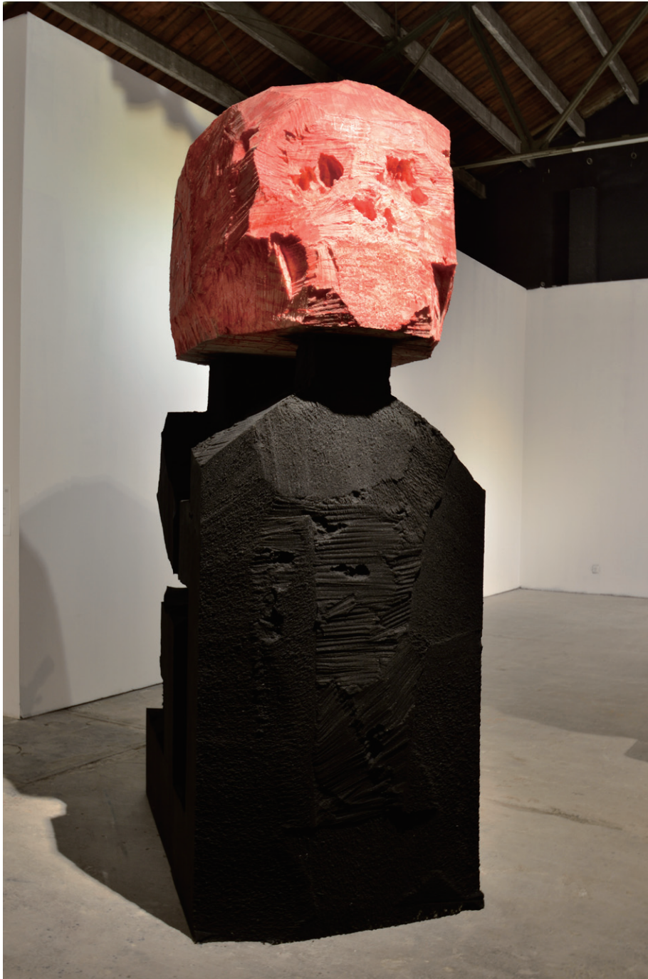
Madeline Company, Divinity-Spouse, 2011 , 285.0 * 105.0 * 125.0 cm , Polyurethane foam, Sensual low temperature wax