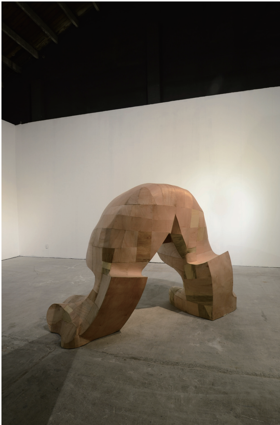
MadeIn Company, Divinity's Posterior, 2011 , 177.0 * 252.0 * 150.0 cm , Plywood,wood