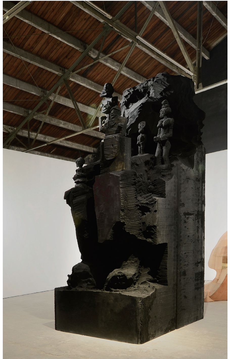
Madeln Company, Divinities Community-01 , 160.0 * 195.0 * 410.0 cm , Polyurethane foam