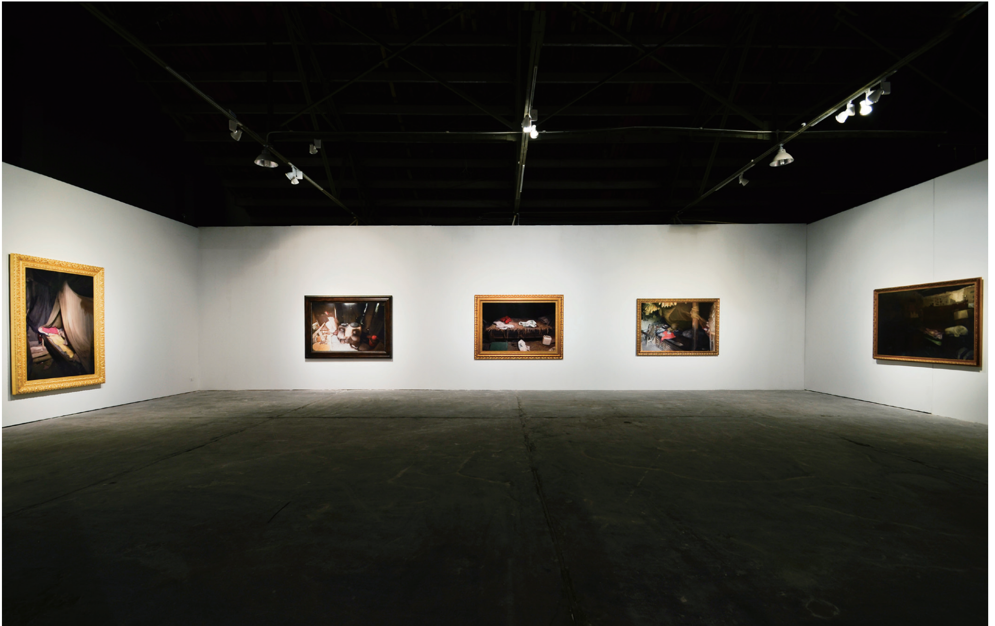
H-space Building 18