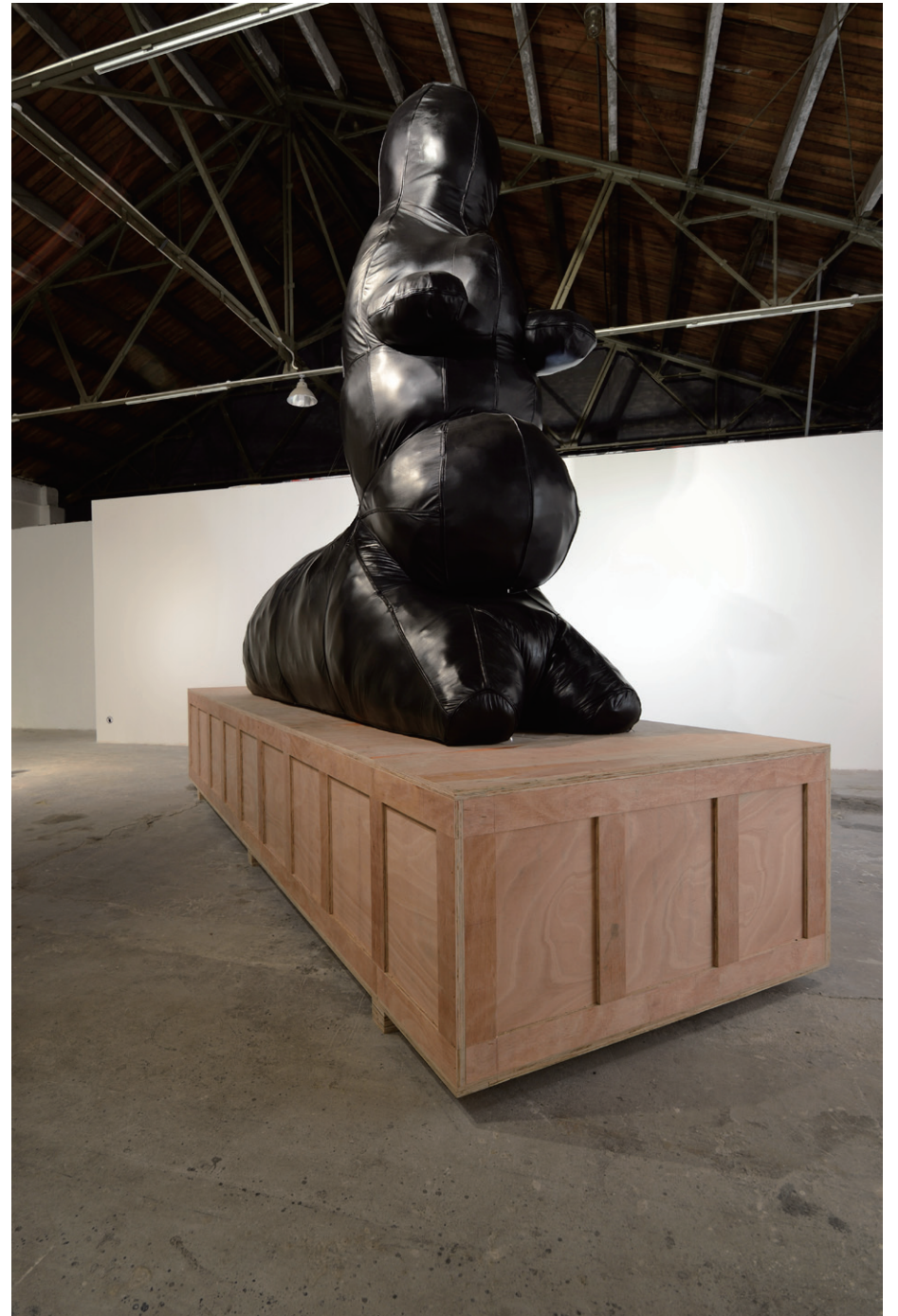
Madeln Company, Divinity- Human-Insect Hybrid , 338.0 * 130.0 * 380.0 cm , Polyurethane foam, cow leather, leather jacket, zip