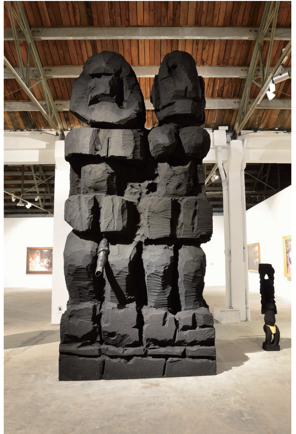
Madeln Company, Marx Divinity- Marx, 2011 , 450.0 * 205.0 * 130.0 cm , Polyurethane foam, cow leather, leather jacket