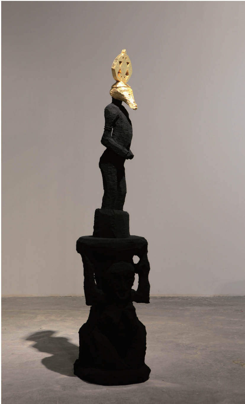
MadeIn Company, Divinity-Chocolate, 2011 , 233.0 * 53.0 * 53.0 cm , Polyurethane foam, gold leaf