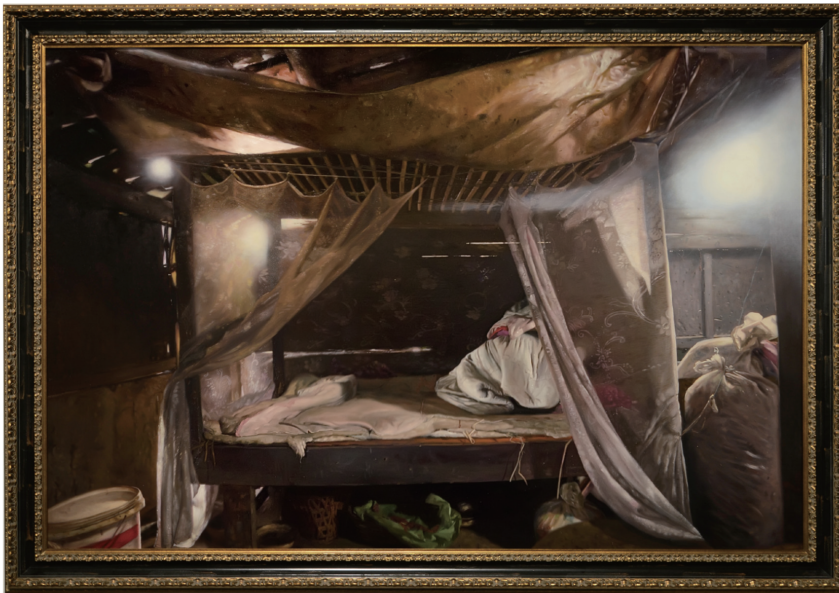
MadeIn Company Miao Residence, Malin Village, Xishui District, Guizhou, Province, China 2011 126.0 * 190.0 cm Oil on canvas