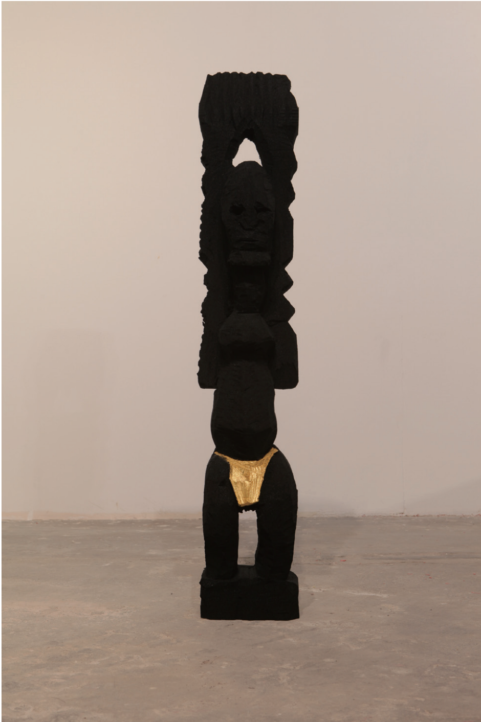
Madeln Company, Divinity- Sauna, 2011 , 144.0 * 17.0 * 30.0 cm , Polyurethane foam, gold leaf