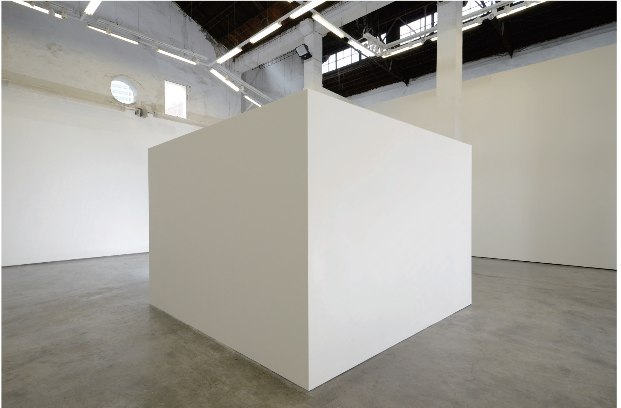
MadeIn Company, Action of Consciousness, 2011, 350.0 * 350.0 * 240.0 cm, Mixed media