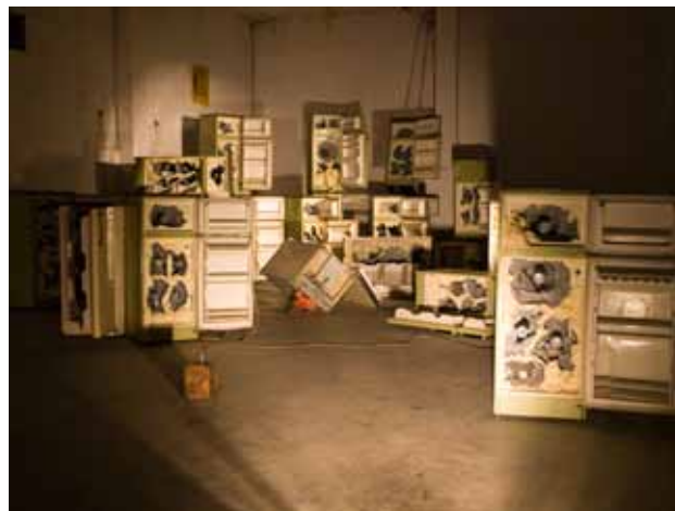
工具 -1 ◀ 装置 / 24 台电冰箱, 3 台功放 (1500 瓦), 一个程序 Tools - 1 Mixed-media installation / 24 Fridges, 3 Power Amplifiers (1500W), 1 programme