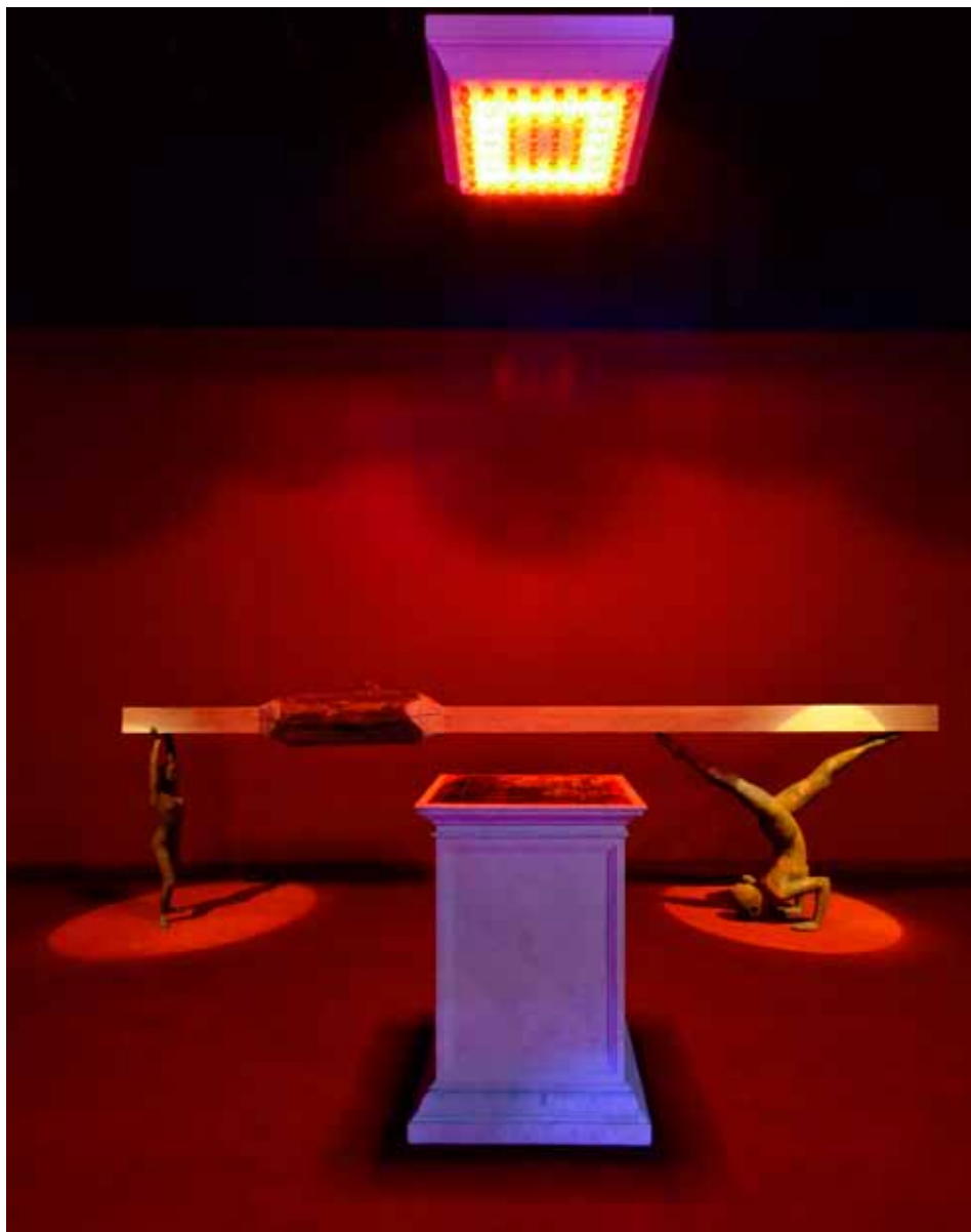
开幕 4- 平衡木 原木，铸铁雕塑

Opening 4 - Halancing beam Raw wood, cast iron sculpture 150.0 × 500.0 × 45.0 cm