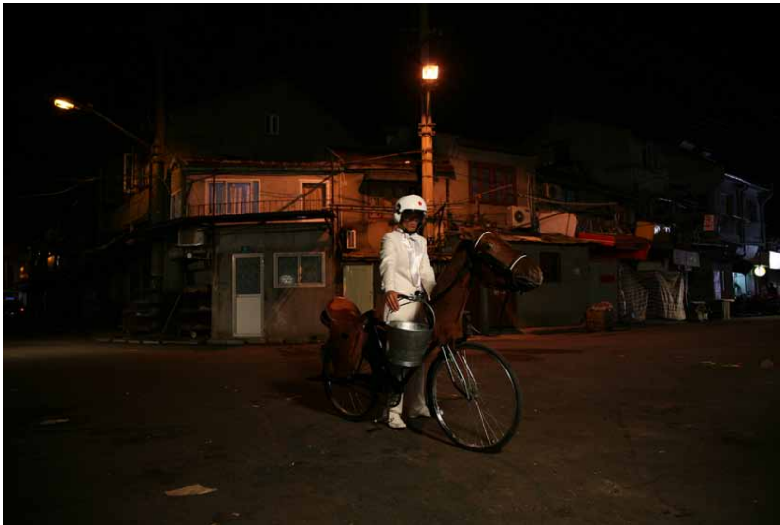
大时代 3 Great Era 3 102.0 × 153.0 cm Ed. 10