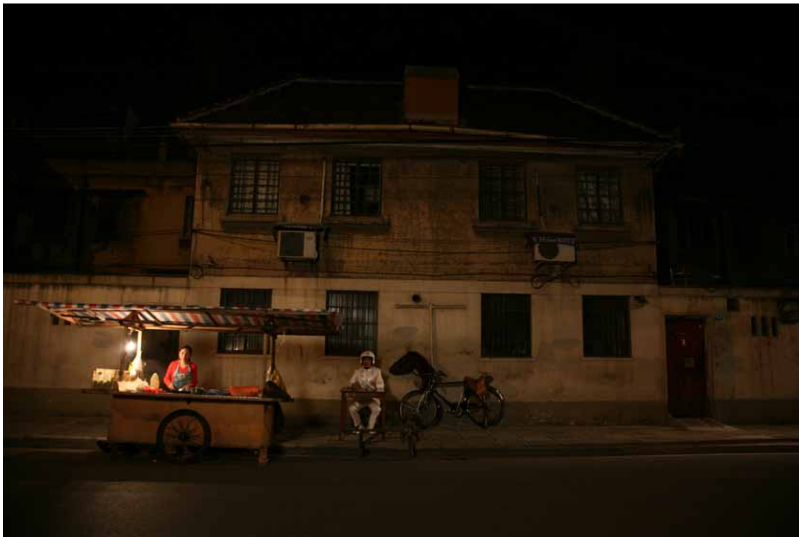
大时代 4 Great Era 4 102.0 × 153.0 cm Ed. 10