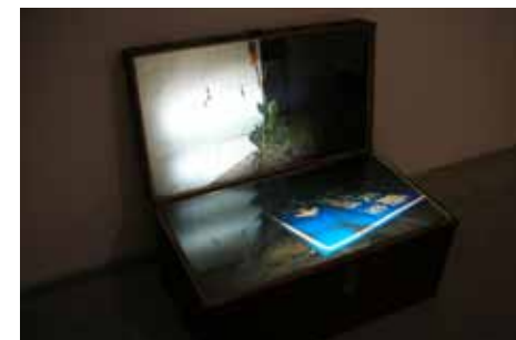
无题 装置 / 老家具, 灯箱 Untitled Installation / Old furniture, light box 90.0 × 50.0 × 45.0 cm