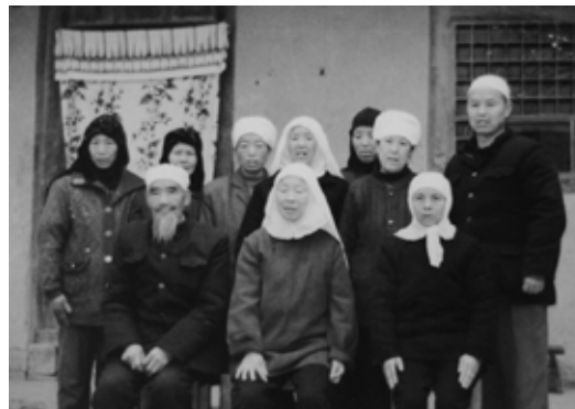
视频装置 18 minutes 42 seconds VideoInstall / Ongoing multi channel video installation various media

在“窥探”（2005年，待续）这部短片中，张鼎探索了观众与被观者，优越感与自卑感，剥削阶级与被剥削者之间的关系。这也许源于一种“认命”的态度。片中人物在性别，宗教及政治派别等方面的差异最终导致他们一系列命运的殊途。