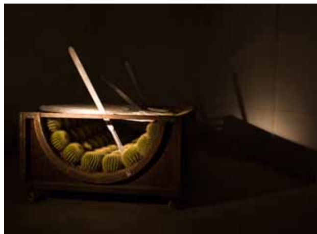
Tools - 3 Mixed-media installation / 296 Cactus, Enlarged Scalpels, Flower Soil Box of Steel Structure 210.0 × 100.0 × 360.0 cm