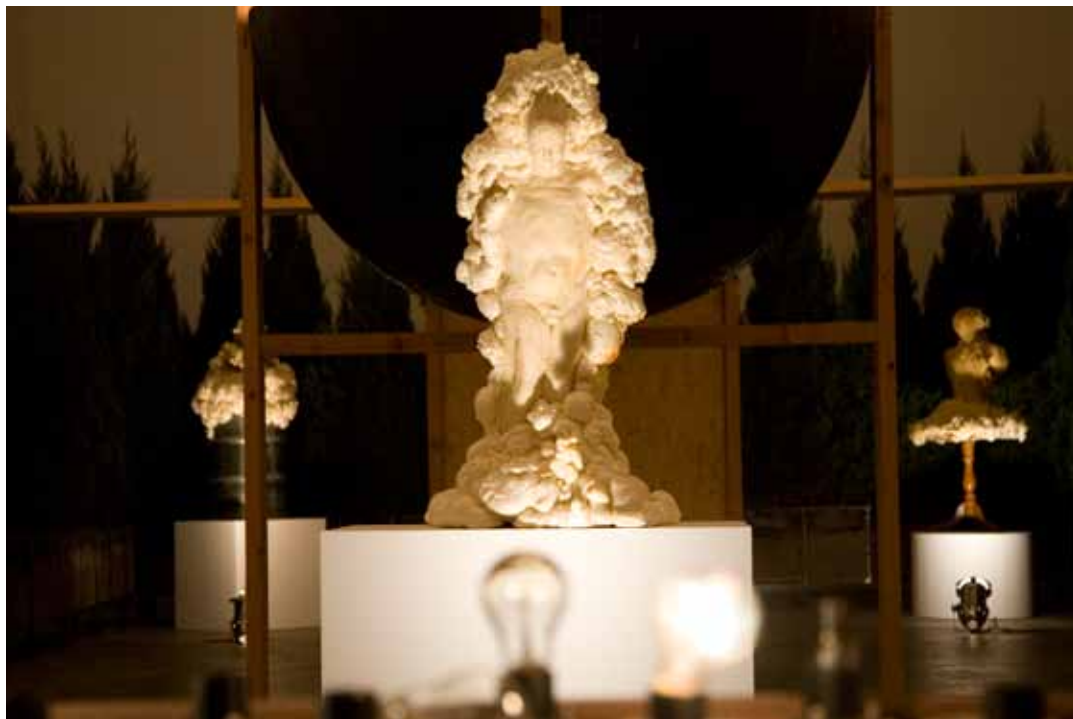
雕塑 1 装置 / 发泡剂 Sculpture 1 Installation / Foam 70.0 × 70.0 × 135.0 cm