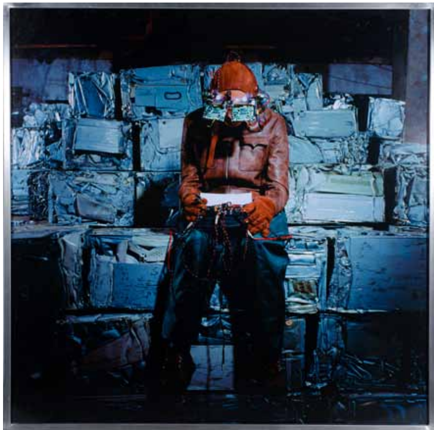
下一个 1 摄影 Next 1 Photo / C-Print 100.0 × 100.0 cm