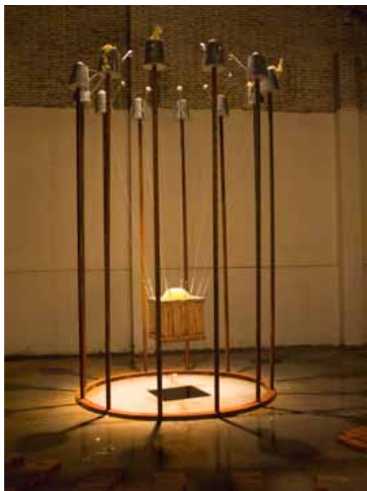
工具 -2 ▲ 装置 / 12 个花洒, 12 根钢管 (高 410cm, 直径 246cm) Tools - 2 Mixed-media installation / 12 Watering Cans, 12 Steel Tubes ( Height 410cm, Diameter 246cm) 12 Steel Wires, 1 Cactus, 1 Wood Box(55x55x51cm) 410.0 × 246.0 × 246.0 cm