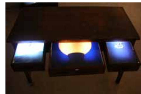
无题 - 抽屉 1 装置 / 家具, 灯箱 Untitled-Drawer 1 Installation / furniture, light box 120.0 × 78.0 × 60.0 cm