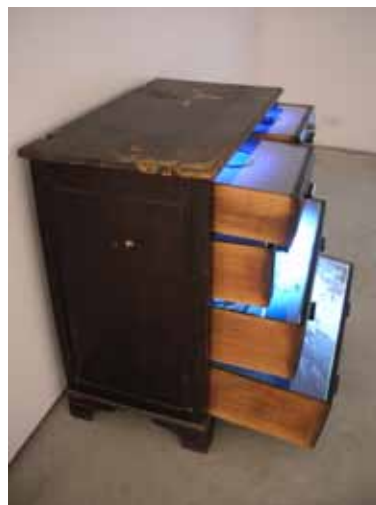
无题 - 抽屉 2 装置 / 家具, 灯箱 Untitled-Drawer 2 Installation / furniture, light box 100.5 × 54.0 × 100.0 cm