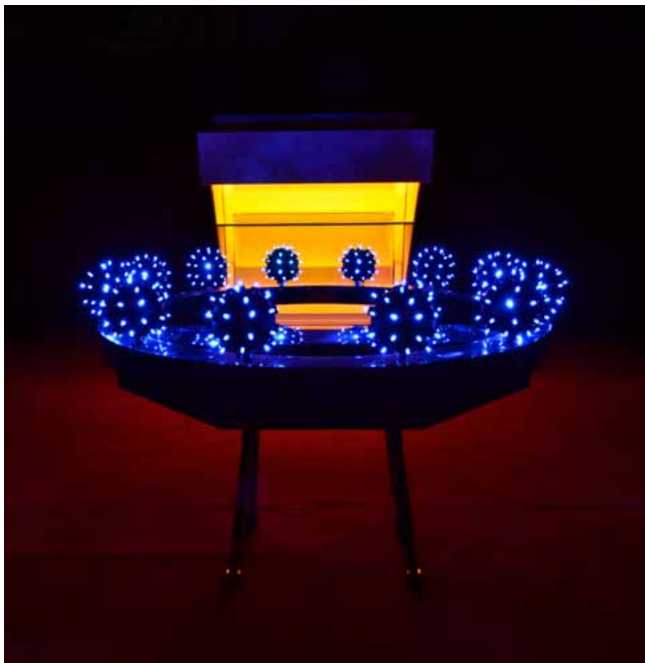
开幕 3- 鞍马 镀钛金属，镀镍金属，灯球，混音设备

Opening 3- Vaulting Horse Titanized metal, nicked metal, light ball, audio mixer 170.0 × 170.0 × 136.0 cm