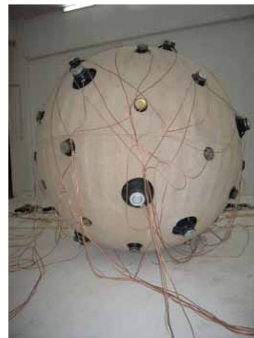
声音装置，16 声道，直径 165cm，球面为羊毛毯覆盖，DVD 播放器。