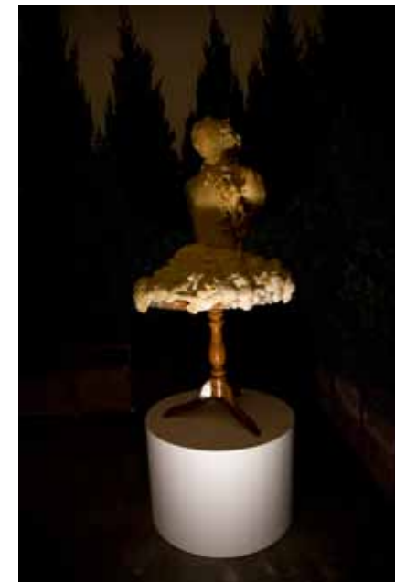
雕塑 2 装置 / 发泡剂, 圆木桌 Sculpture 2 Installation / Foam, Round wooden table 100.0 × 100.0 × 166.0 cm