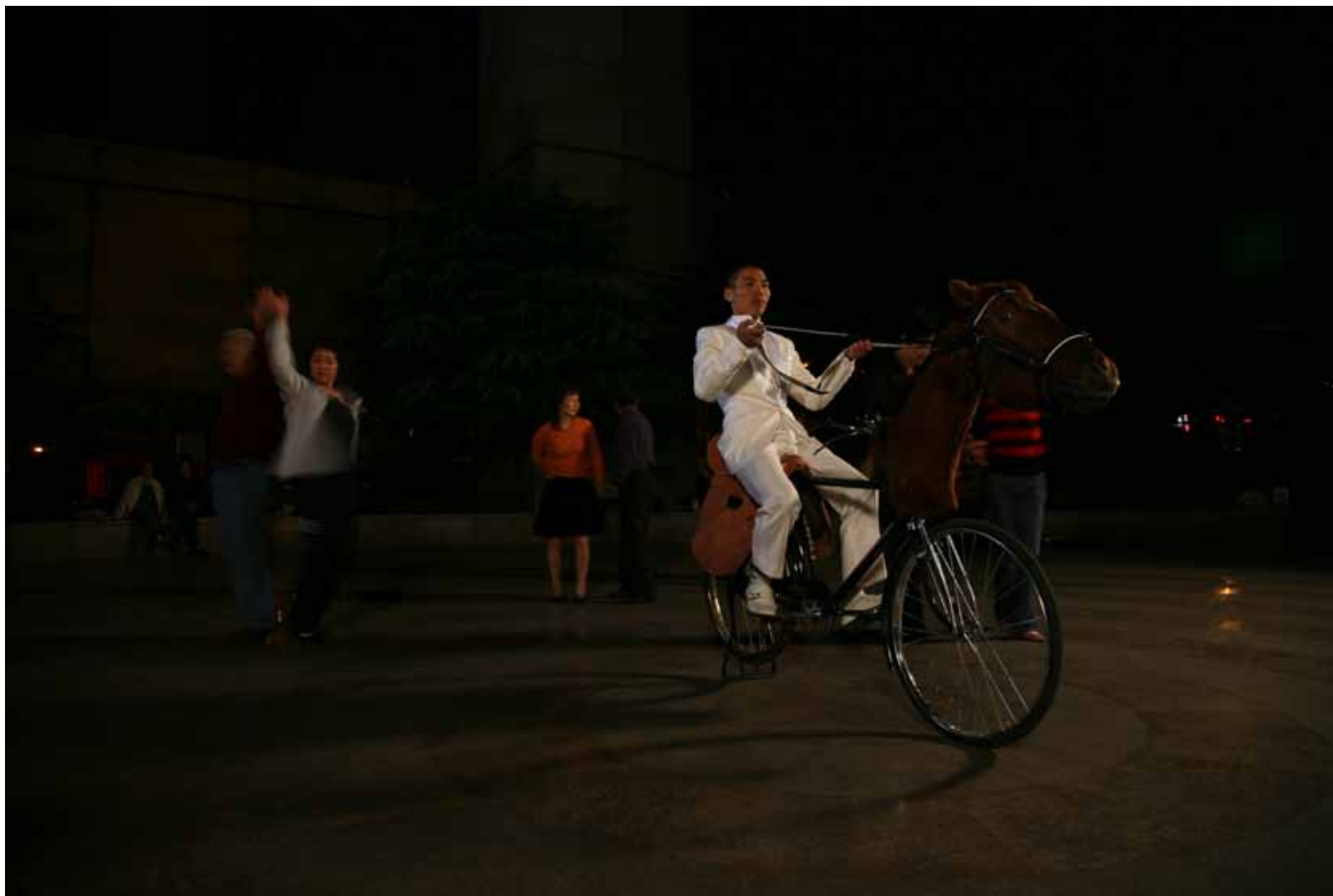
大时代 2 Great Era 2 102.0 × 153.0 cm Ed. 10