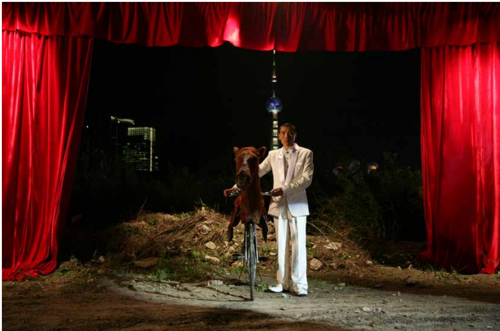
大时代 1 Great Era 1 102.0 × 153.0 cm Ed. 10