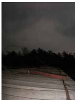
他们在一起的乐园 They are together in the amusementpark C-Print 49 pieces Ed. 4