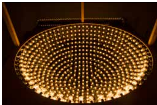
定律 1 装置 / 木料, 沥青, 灯泡, 电, 水瓶, 水

Law 1 Installation / Wood, Asphalt, Light Bulbs, Electricity, Water Bottle, Water 700.0 × 500.0 × 35.0 cm