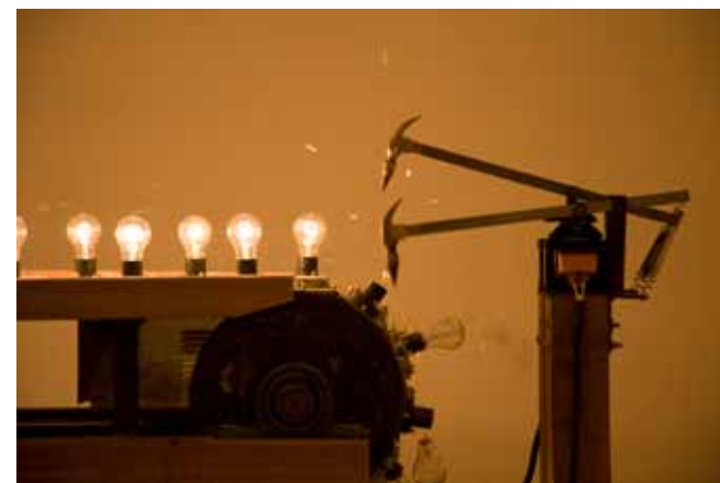
定律 2 装置 / 木料, 金属, 传送带, 电机, 电磁铁, 锤子, 灯泡 Law 2 Installation / Wood, Metal, Conveyor Belt, Electric Motor, Electromagnet, Hammer, Light Bulbs 854.0 × 48.0 × 128.0 cm