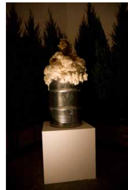
雕塑 3 装置 / 发泡剂, 油桶, 松香, 沥青 Sculpture 3 Installation / Foam, Oil Drum, Rosin, Asphalt 80.0 × 80.0 × 155.0 cm