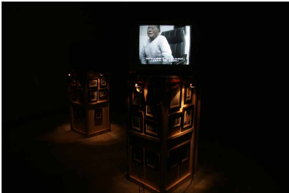
视频装置 29 minutes 54 seconds VideoInstall / Ongoing multi channel video installation various media