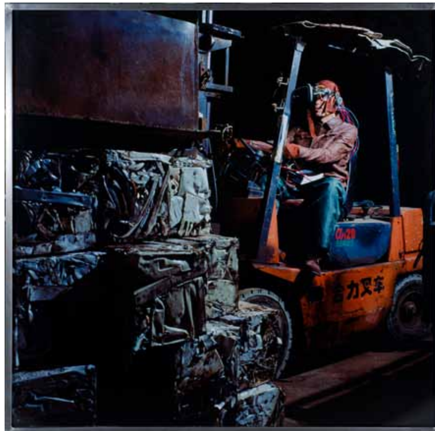
下一个 2 摄影 Next 2 Photo / C-Print 100.0 × 100.0 cm