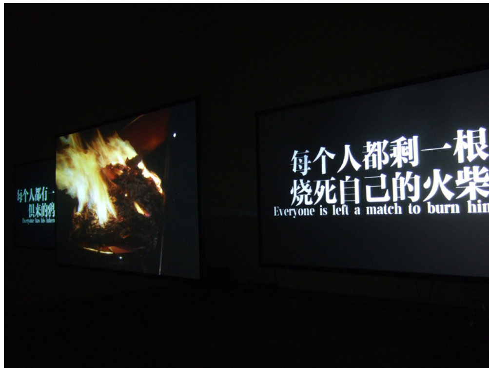
为什么是生活 录像 | 三频录像

Why Life Video | 3 Channal Video 13' 46" 2010