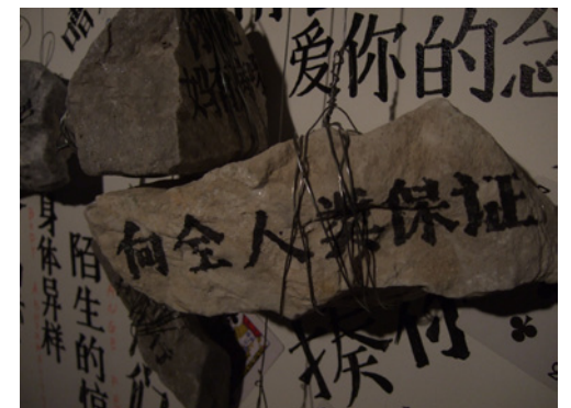
为什么是生活 2 装置 | 石头、文字 尺寸可变

Why Life 2 Installation | Stone, Literature Dimensions variable 2010