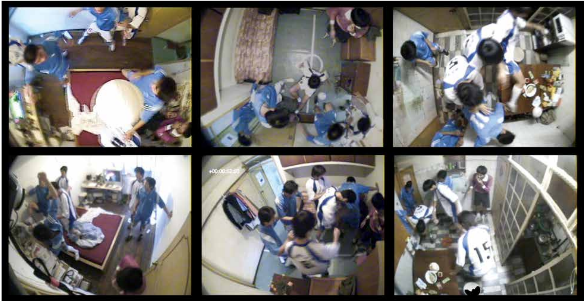
603 足球场 603 Football Field