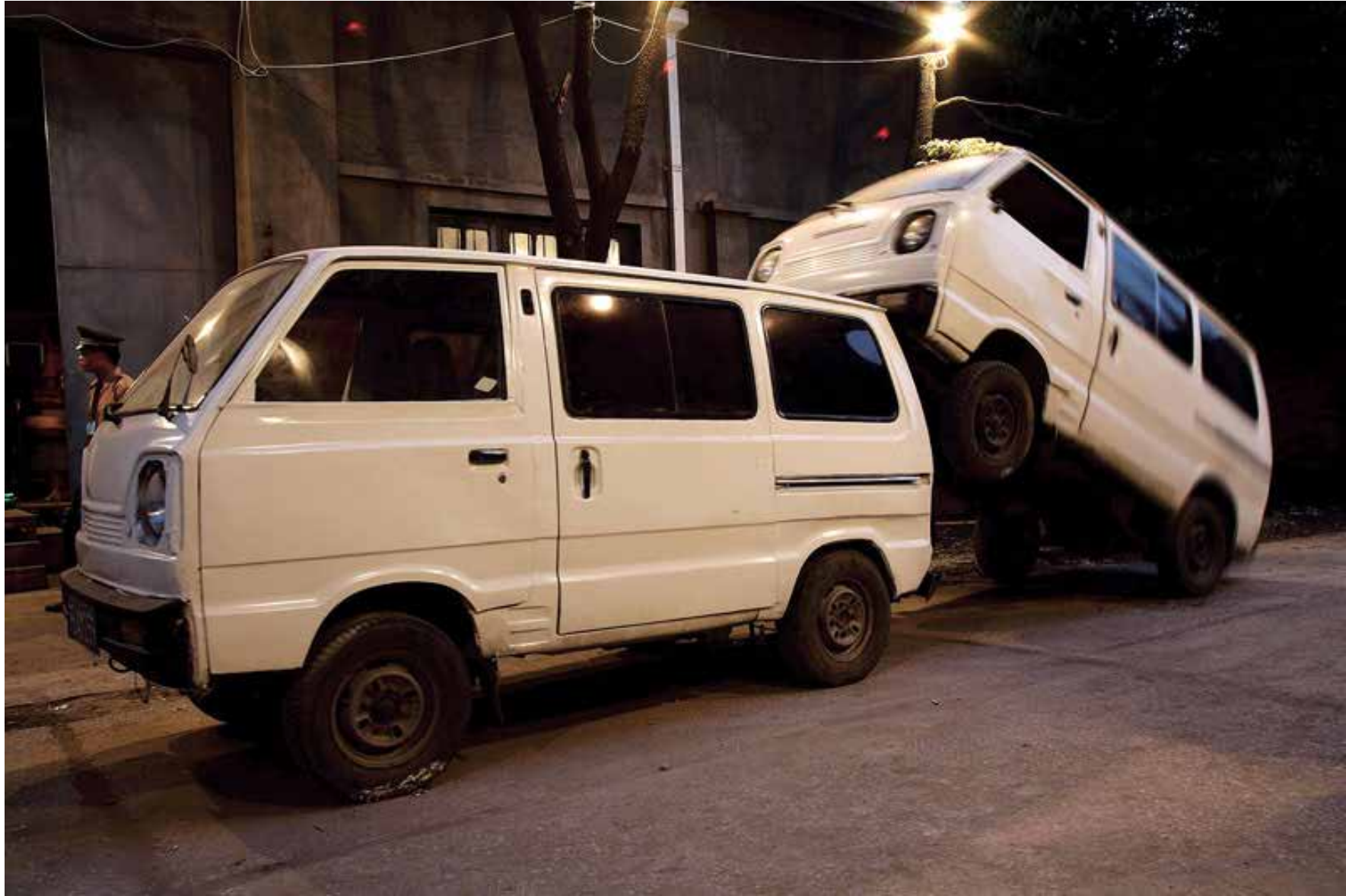
Sub-Surviving 亚生存 Two Chang'An Microbuses 二辆长安面包车 600 x 200 x 220 cm 2006