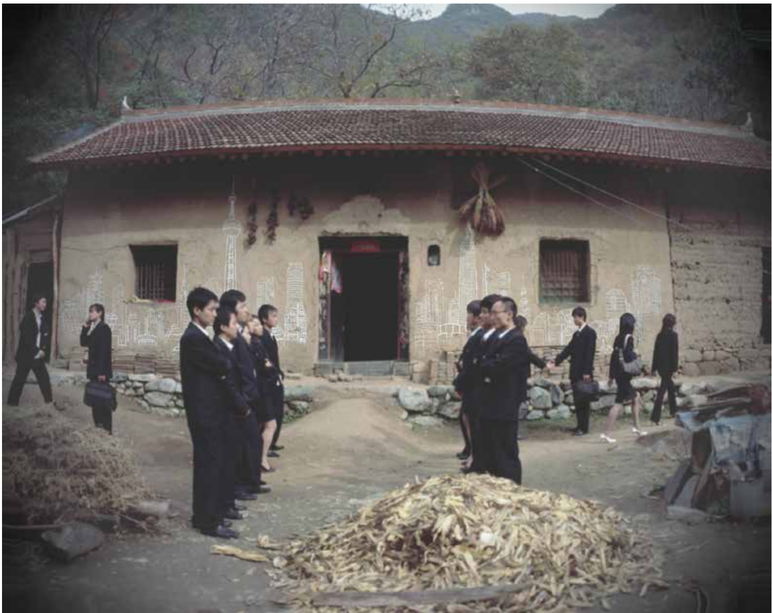
Don't Go So Fast Nr.1 别走得太快 Nr.1