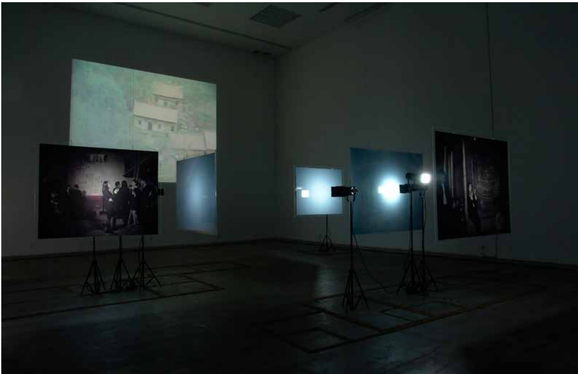
别走得太快 - 章清个展, 香格纳北京 Don't Go So Fast - Zhang Qing Solo Exhibition, ShnghART Beijing