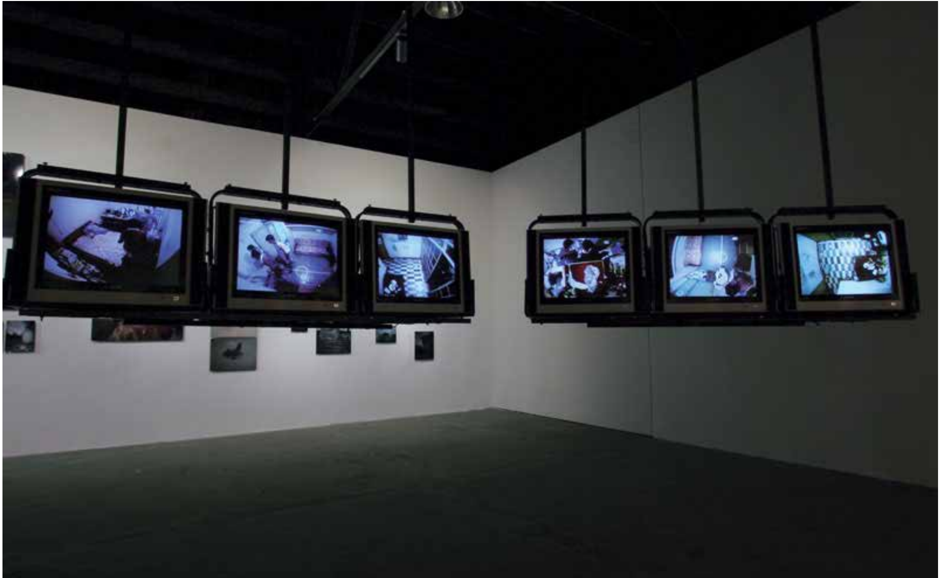
603 足球场 603 Football Field

很多灰 2, 香格纳 H 空间, 上海 A lot of Dust 2, ShanghART H-Space, Shanghai