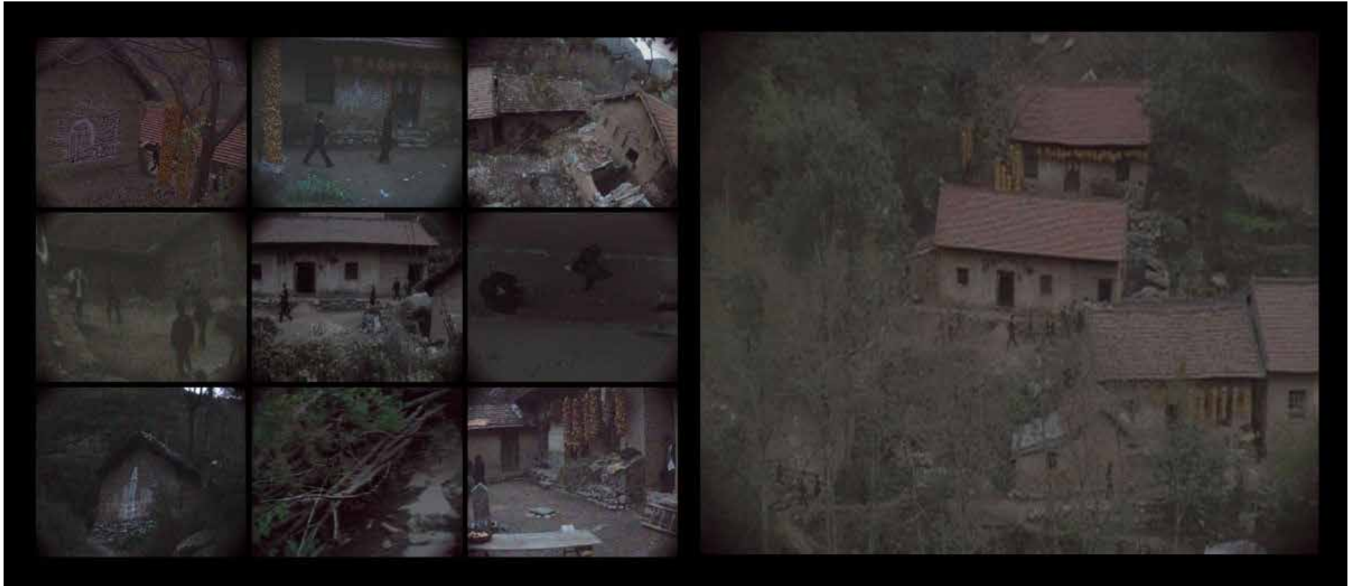
别走得太快 Don't Go So Fast

10屏, 监控录像 10 Channels, Surveillance video