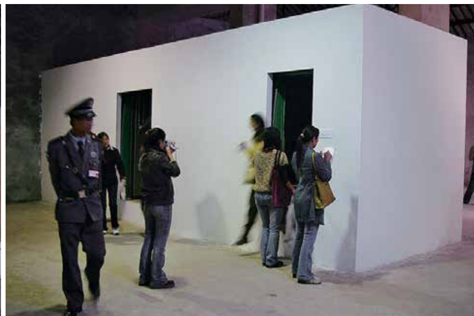
福特密室 Ford's Secret Chamber 公共汽车, 混凝土 Bus, Concrete Wall 800.0 x 260.0 x 320.0 cm 2003

在展场租来一辆公共汽车，然后用墙和顶紧紧包住车子，留下公共汽车上下两个门，现场汽车在发动。