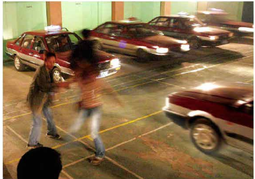
的士桑芭 Taxi Samba 行为 Performance (中国 China, 2003)