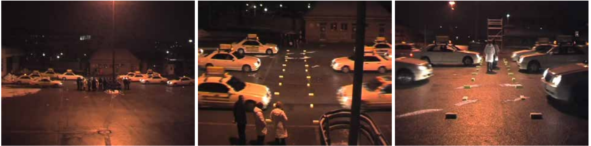
的士桑芭 Taxi Samba 行为, 录像 (德国 2005) Performance, Video (2005 in Germany) Ed.7 6' 2003

10 辆的士排成两列模仿交谊舞的队形，在速启和急停中踩着步点扭动身躯表演一场“的士桑芭”。观众可以在队列“的士”中穿行，在安全范围内体验危险。现场处处擦出尖锐的刹车声，紧张刺激。《的士桑芭》是章清对常规概念的挑战。我们对“的士”的日常定义无非是载人载物的交通工具，但《的士桑芭》中的“的士”是一个疯狂玩具，“随时都将失去控制”的危险感成为一种难得的观展体验。