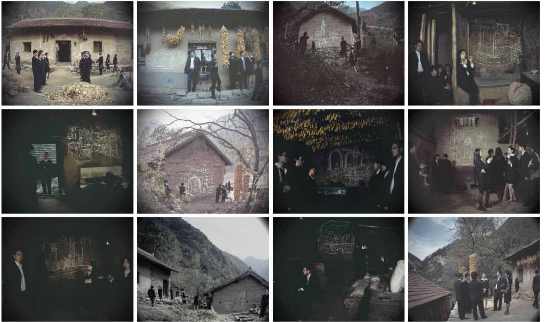
别走得太快 Nr.1-12 Don't Go So Fast Nr.1-12 摄影、灯箱 C-Print、Light Box Ed.5 119 x 150 cm 2008