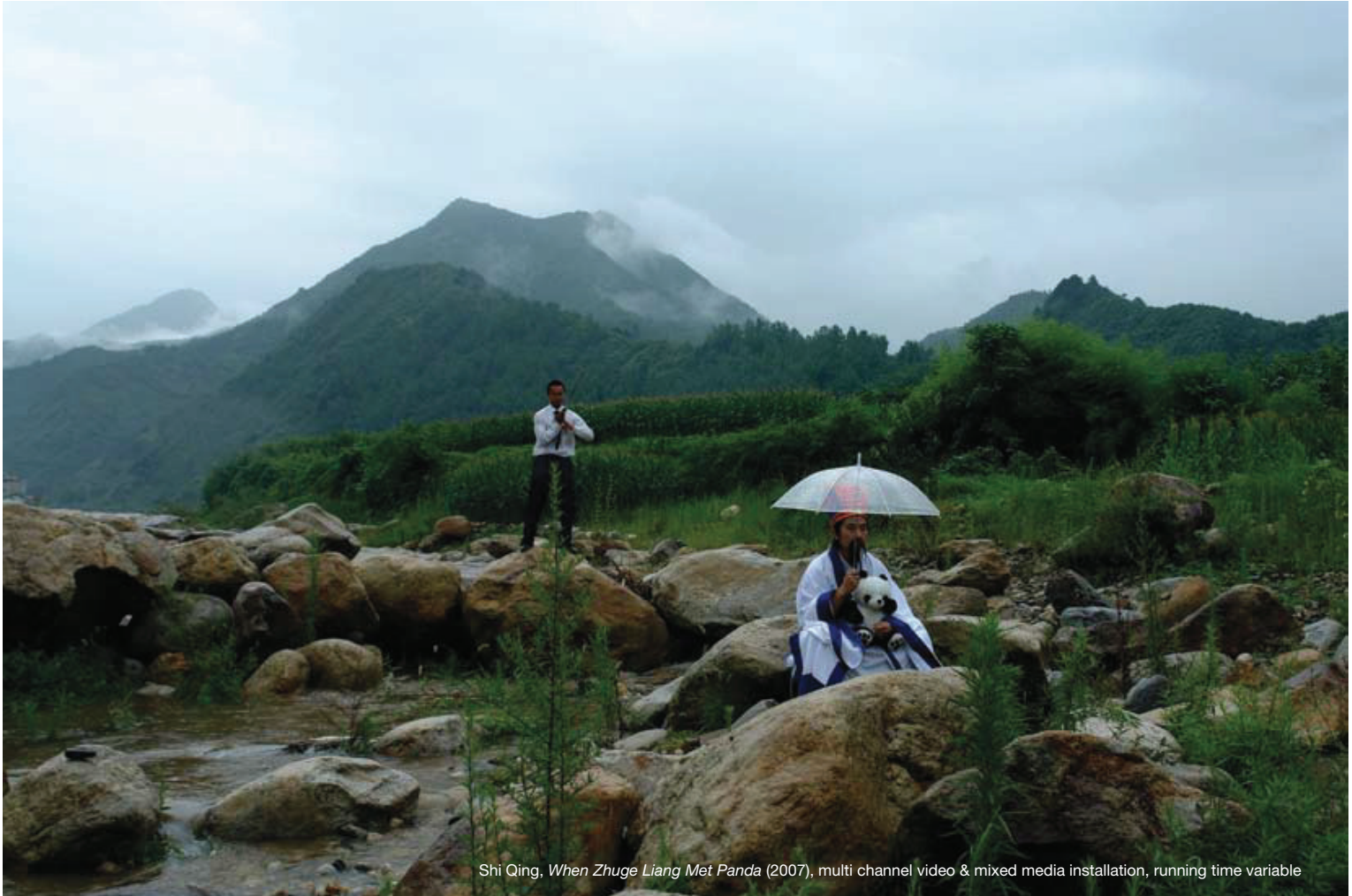
Shi Qing, When Zhuge Liang Met Panda (2007), multi channel video & mixed media installation, running time variable