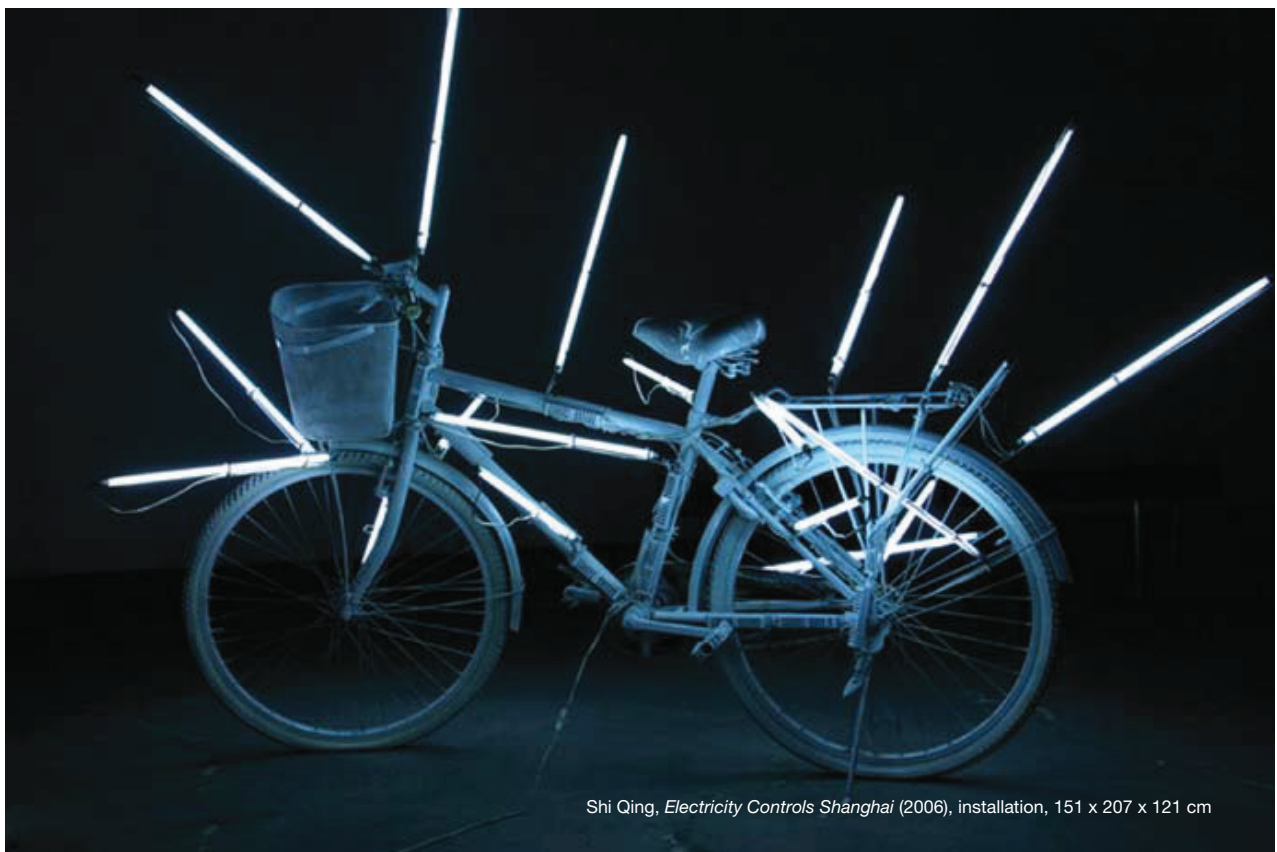
Shi Qing, Electricity Controls Shanghai (2006), installation, 151 x 207 x 121 cm

Recent exhibitions include When Zhuge Liang Meets Panda, ShanghArt's F-Space, Shanghai (2007), Rejected Collection, Ke Center of Contemporary Art, Shanghai (2007) NoNo(NONO), Long March Space, Beijing (2007), Electricity, BizArt Center, Shanghai (2006) The Second Guangzhou Triennial, Guangdong Museum of Art, Guangzhou (2006), Prague Biennial 2, National Gallery, Prague, Czech Republic (2005), and 4th Busan Biennale, Busan Metropolitan Art Museum, Busan, Korea (2004).