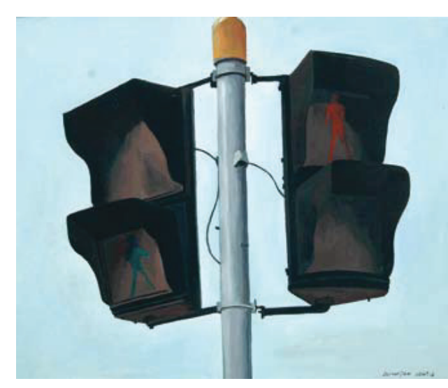
Liu Weijian, Properties (2007), acrylic on canvas, 60 x 80 cm, 20 pieces

Recent exhibitions include The Call of the Crows, BizArt Art Center, Shnghai (2007), Aired, ShanghART Gallery, Shanghai (2007), Energy, Today Art Museum, Beijing (2007), China Power Station: Part II, Astrup Fearnley Museum of Modern Art, Oslo, Norway (2007), Shouting Truth, Platform China Contemporary Art Institute, Beijing (2007), China's Cutting Edge: New Video Art from Shanghai and Beijing, Anthology Film Archives, New York City, USA (2006), Future Landscapes, Duolun Museum of Modern Art, Shanghai (2006).