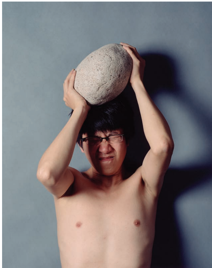
你是此物的此时 | 摄影 You Are the Specific Moment for This | Photo | 120x150cm | 2013 | CXY_1466 | Ed. 5