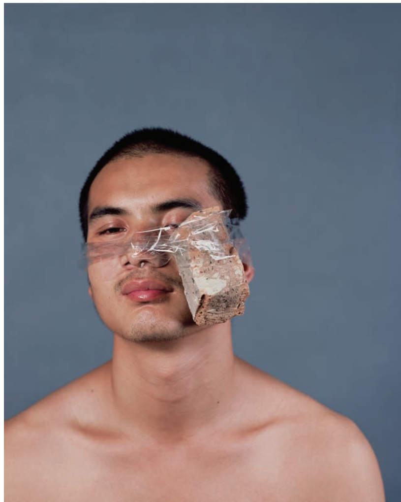
肉身消化世界01 | 摄影 The Flesh Assimilates the World 01 | Photo | 120x150cm | 2013 | CXY_4575 | Ed. 5