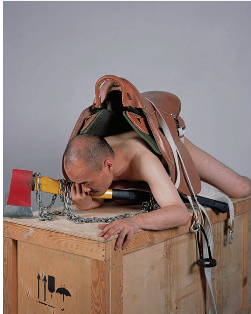
让模特显示出沮丧，给他苦难的道具，让绝望本身的真相成为可疑的图像 | 摄影 Making the Model Depressive, Giving Him the Tool of Misery, Turning the True of Despair Itself into a Dubious Image Photo | 120x150cm | 2013 | CXY_8752 | Ed. 5