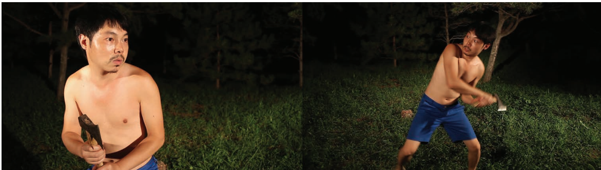
砍死你 | 双频录像 Chopping You up Deadly | Multi-Channel Video | 4' | 2013 | CXY_2862 | Ed. 6