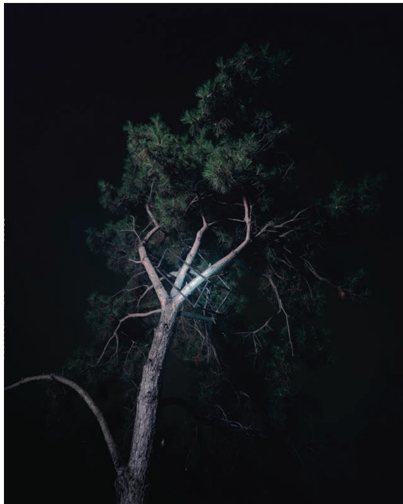
在他看来自我是种不存在的神圣主体 | 摄影 In His Opinion, Self Is a Sacred Body Which Doesn't Exist | Photo | 120x150cm | 2013 | CXY_8065 | Ed. 5