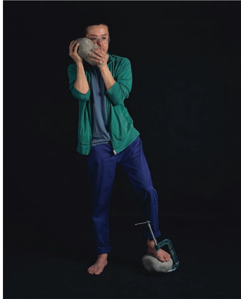
以不严肃的方式显示出全部的紧张 | 摄影 Showing All Tension in a Casual Way | Photo | 120x150cm | 2013 | CXY_8297 | Ed. 5