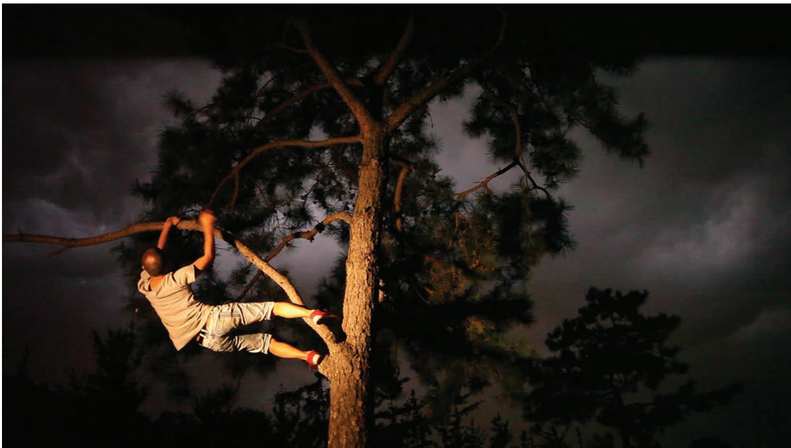
我们活过的刹那，前后都是暗夜 | 单频录像 The night already past, the little while we last | Single-Channel Video | 2' | 2013 | CXY_ | Ed. 6