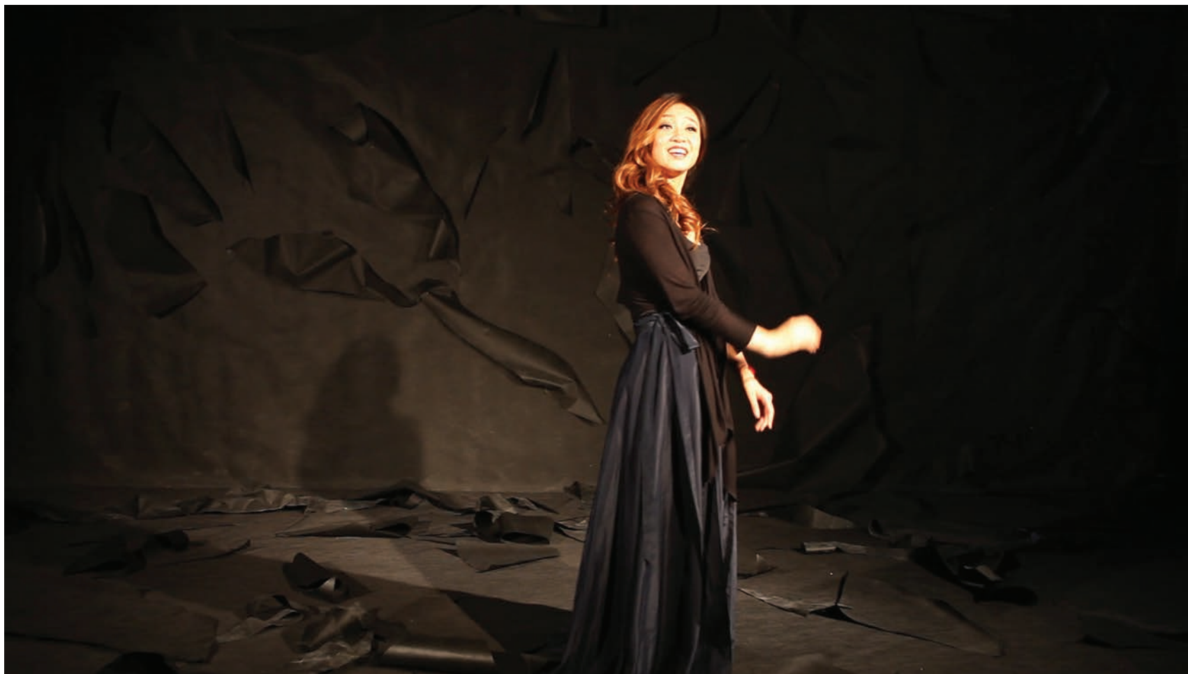
最丑的那部分 | 单频录像 The Smelliest Part | Single-Channel Video | 11' 27" | 2013 | CXY_1736 | Ed. 6