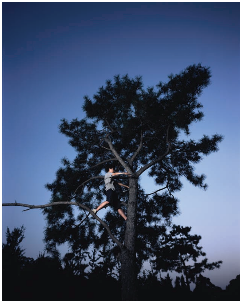
我们称之为现实的东西其实很业余 | 摄影 What We Call as Real Is Actually Amateurish | Photo | 120x150cm | 2013 | CXY_6232 | Ed. 5