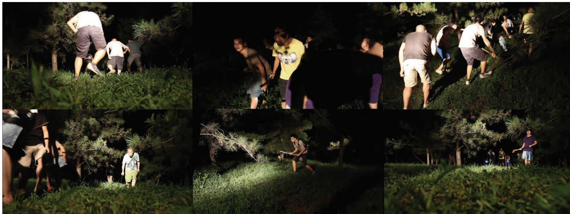
业余暴徒 | 单频录像 The Amateurish Mob | Single-Channel Video | 6' 16" | 2013 | CXY_8571 | Ed. 6