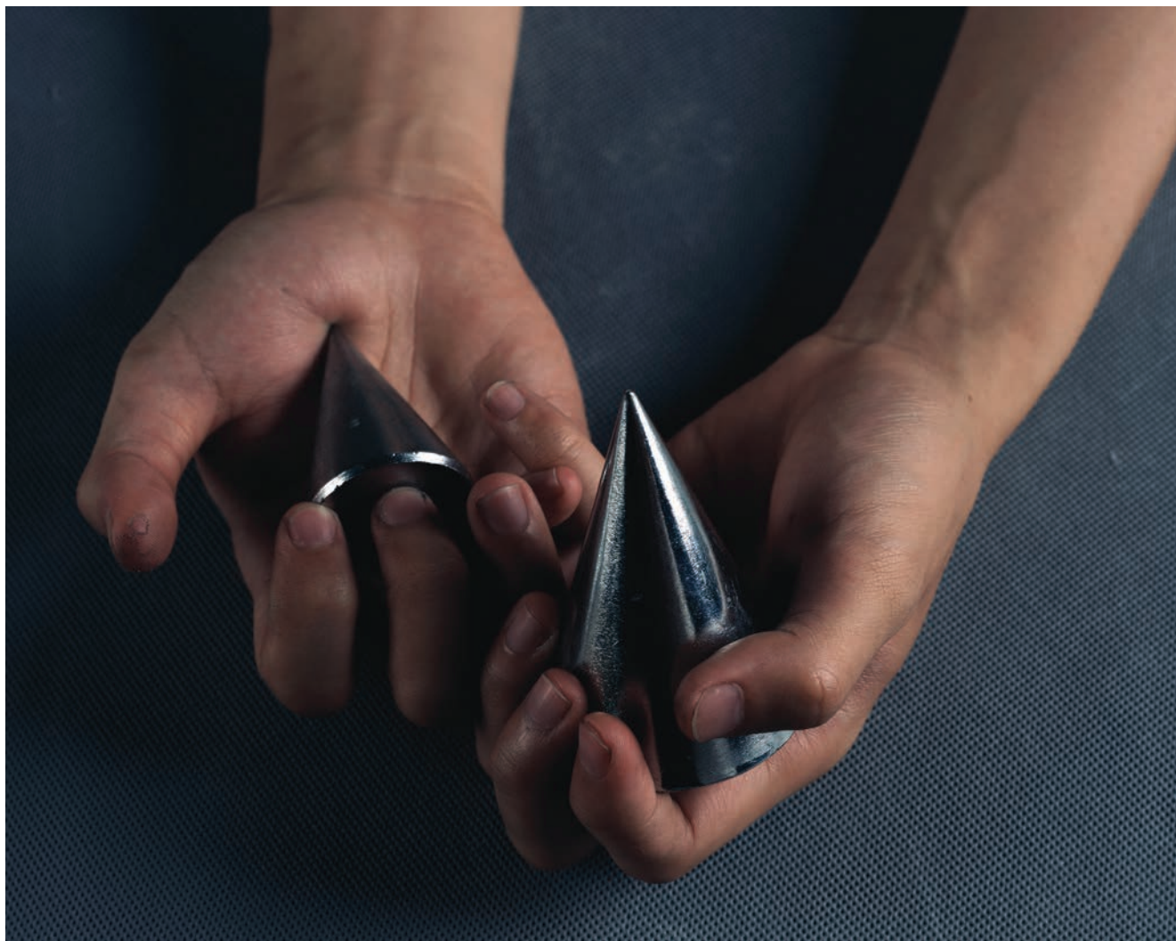
你是此物的终极启示 | 摄影 You Are the Final Enlightenment for This | Photo | 120x150cm | 2013 | CXY_3396 | Ed. 5