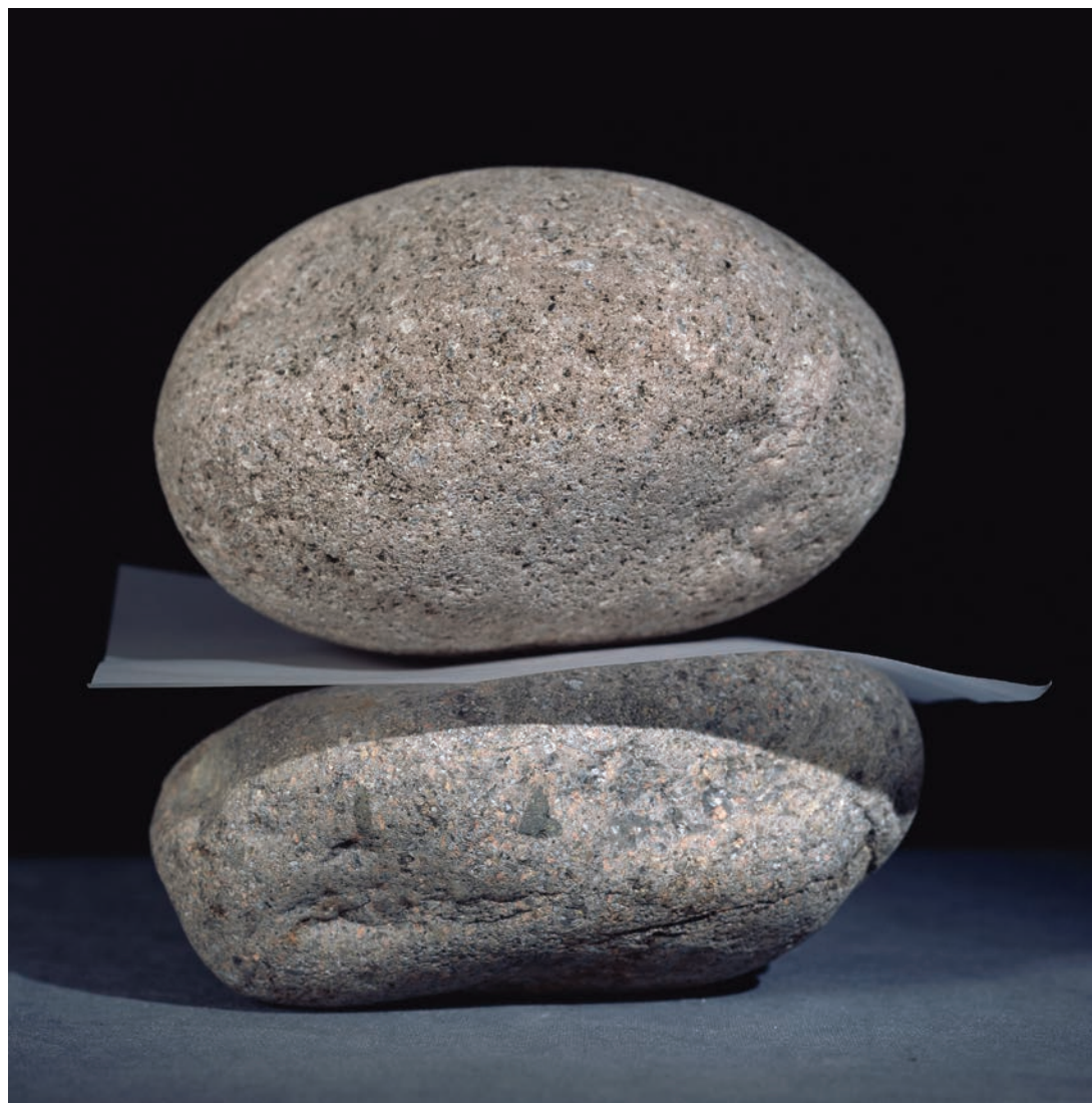
简洁的令人不加解释的静寂 | 摄影 Simple Peace without Explanation | Photo | 120x150cm | 2013 | CXY_8752 | Ed. 5