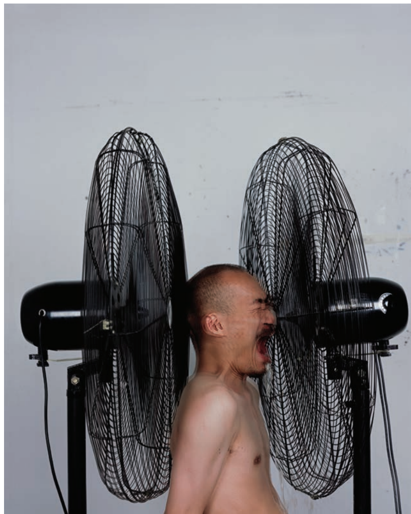
与自身的复杂交往02 | 摄影 Contacting with Self- Chaos 02 | Photo | 120x150cm | 2013 | CXY_6803 | Ed. 5