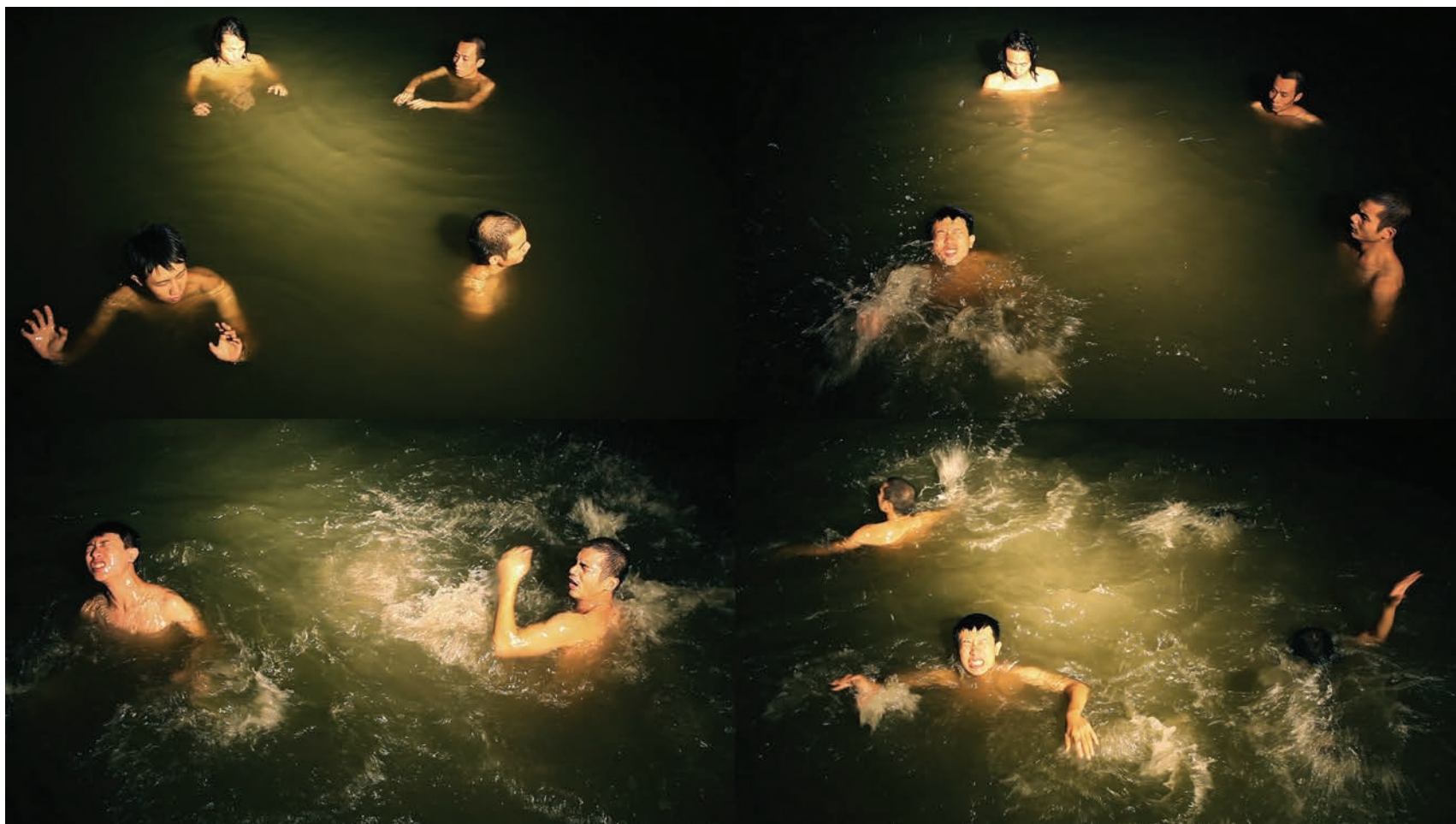
绝望表演 | 单频录像 Performing with Despair | Single-Channel Video | 3' 9" | 2013 | CXY_2488 | Ed. 6