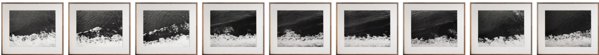
岛屿之间 系列 1 Between the Islands NO.1 , 2012