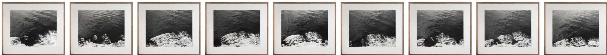
岛屿之间 系列 2 Between the Islands NO.2 , 2012