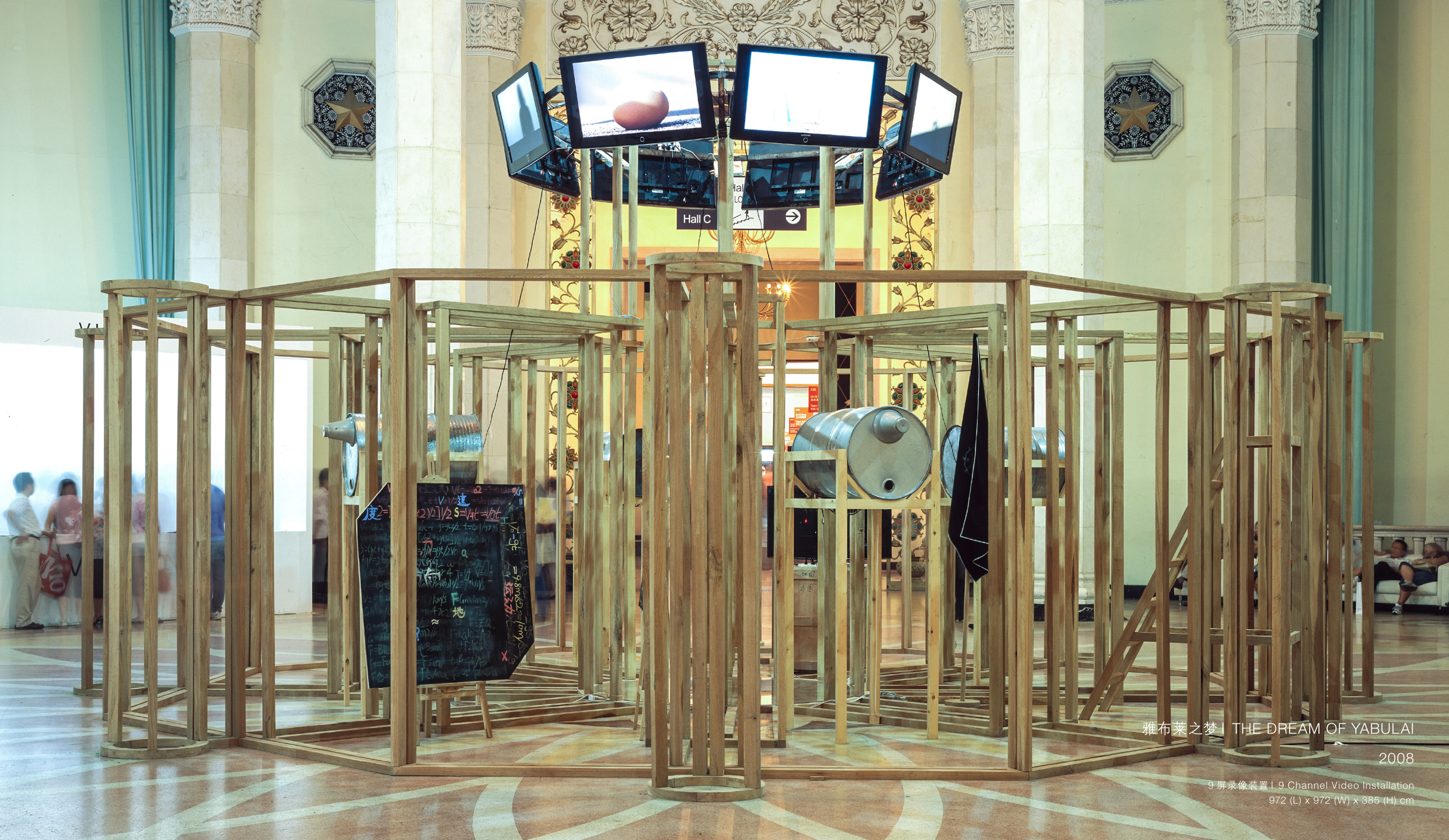
雅布菜之梦 | THE DREAM OF YABULAI