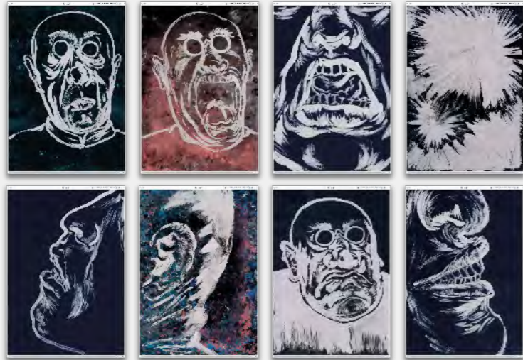
selected image stills from animation