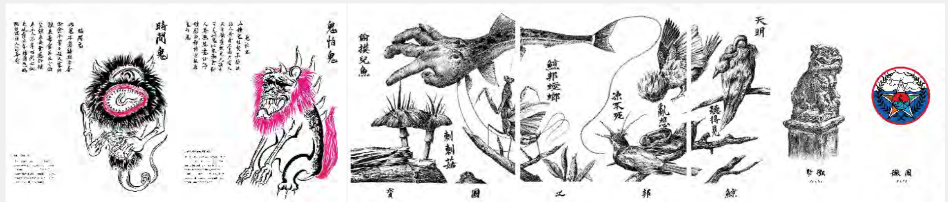
selected spreads from the book