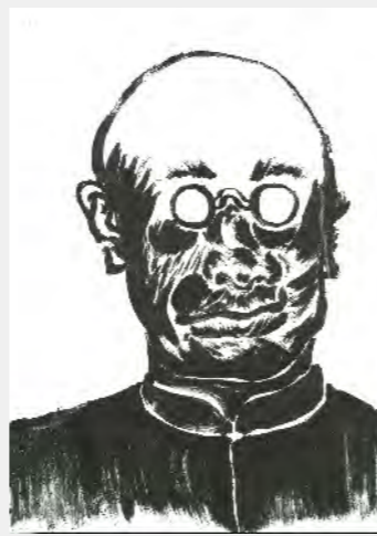
unique print for each case