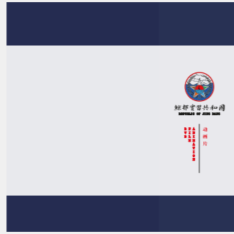
animation available in digital betacam and DVD format