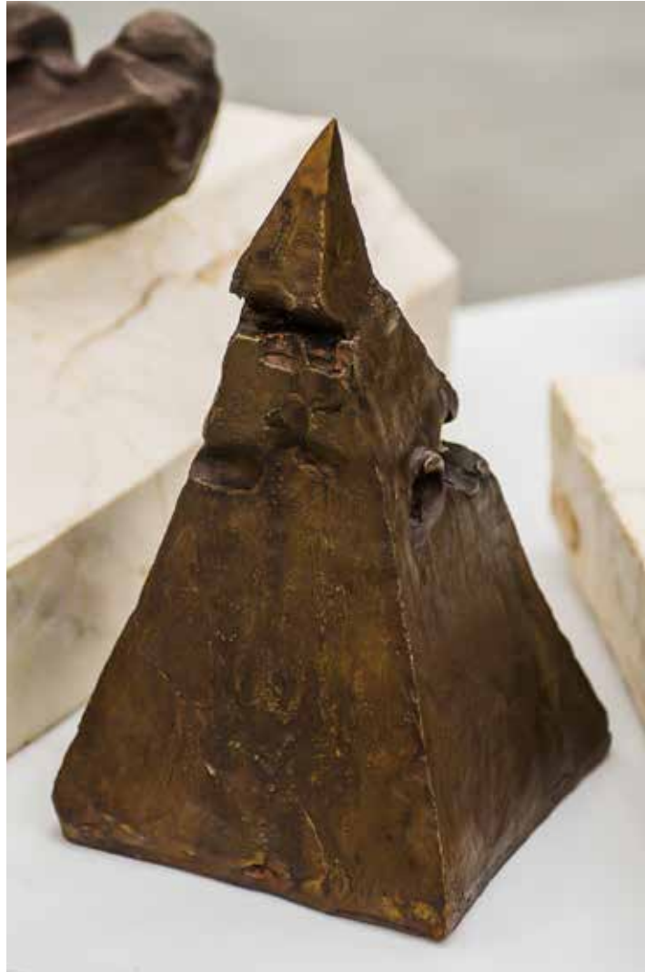
椎间盘突出 10 周年心理疗法

Psychotherapy of the Tenth Anniversary of Protrusion of Intervertebral Disc, 2014