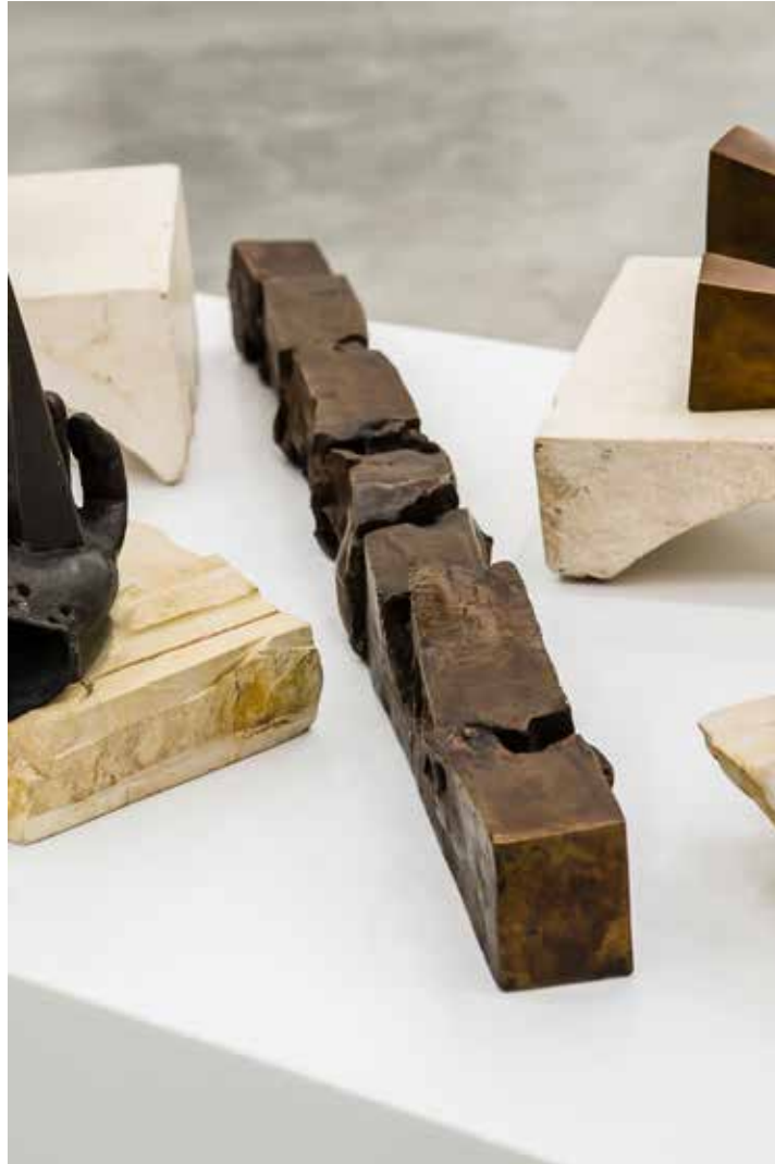
—列即将脱轨的列车把我的未来交给一条蛇 A Derailing Train Turns My Future to a Snake, 2014 雕塑 | 青铜 Sculpture | Bronze, 8.8 × 85.4 × 9cm, CXY_3470