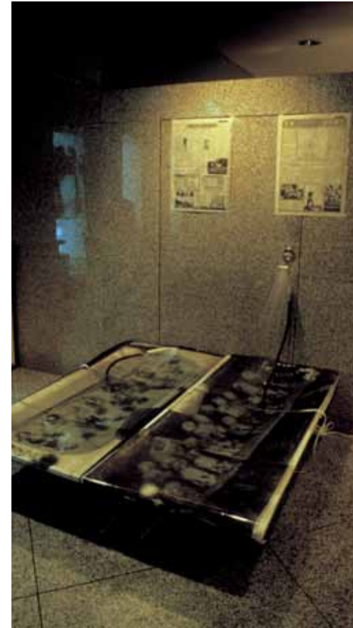
清洗 • 1941 大同万人坑 / 1995 Washing • Datong Mass Graves, 1941 / 1995