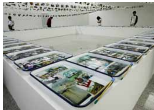
清洗 • 新闻水 / 2007 Washing • News Water / 2007