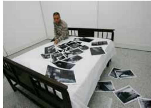
我奶奶去世前后 / 1989-2007 Before and After My Grandmother Passed Away / 1989 – 2007