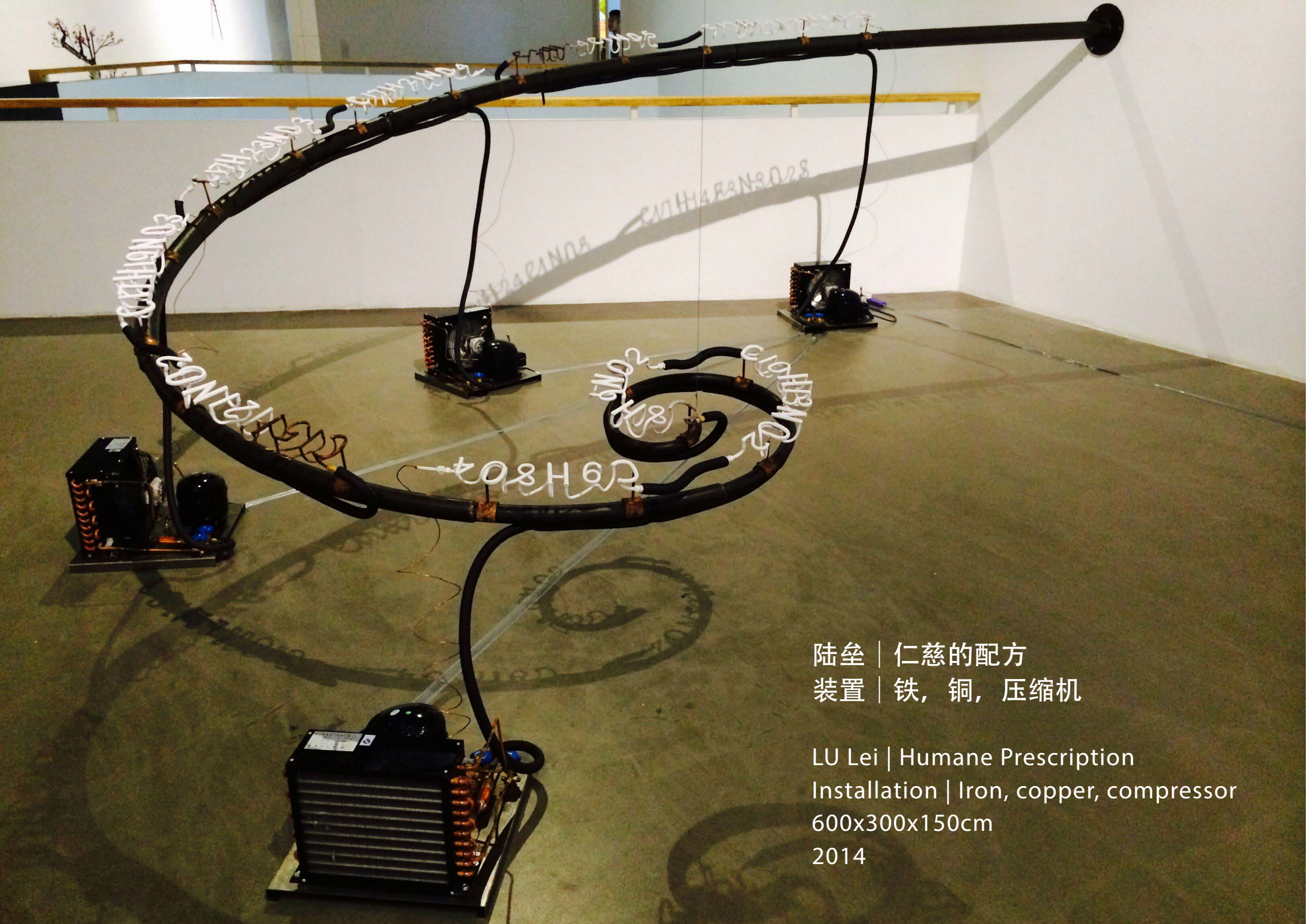
陆垒 | 仁慈的配方 装置 | 铁, 铜, 压缩机