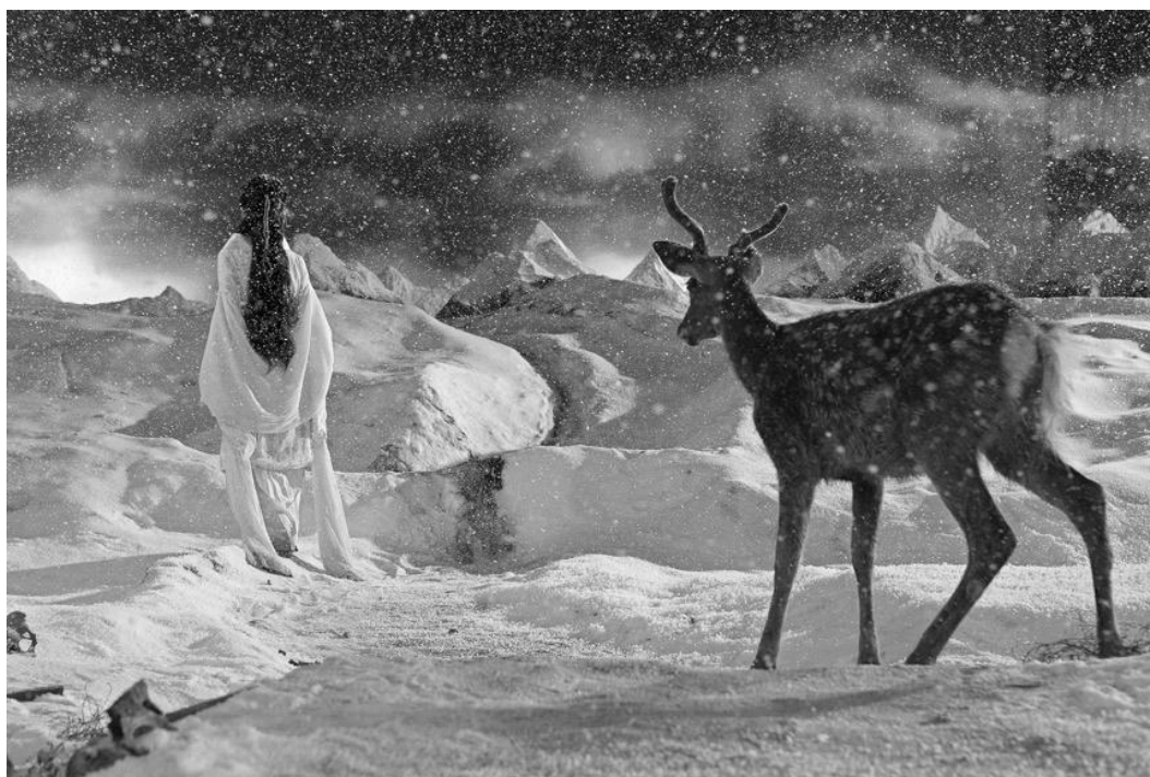
YANG Fudong, Yejiang/The Nightman Cometh , 2011, 35mm black and white film, 19min 20sec