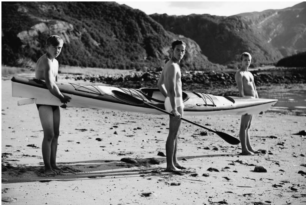
Yang Fudong, The Light That I Feel , 2014, 8 channel video installation, Sandhornøya, Norway, (Project commissioned by SALT 2014)