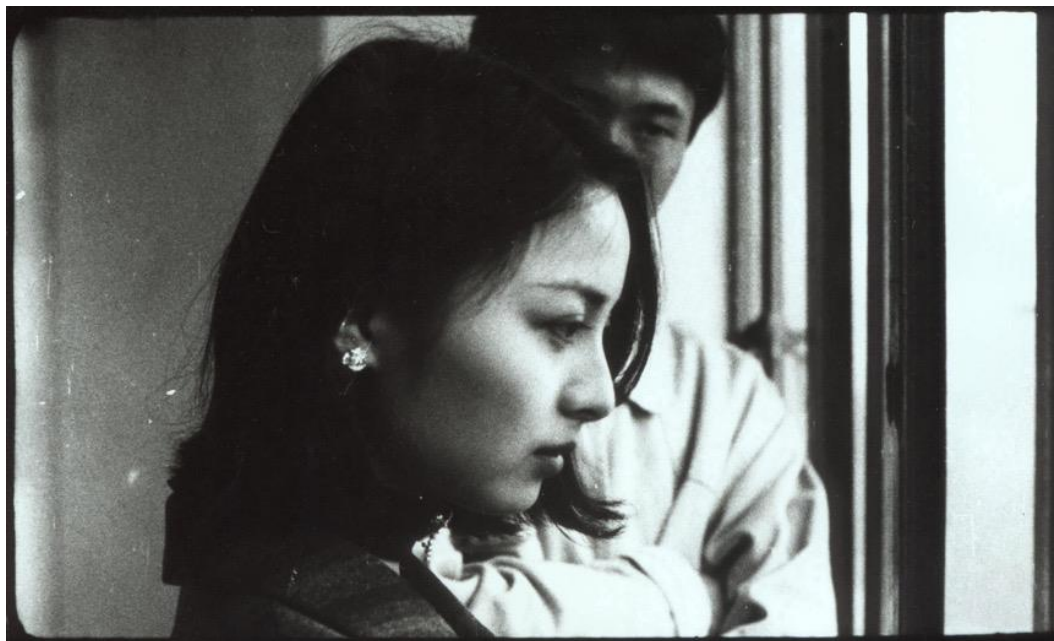
An Estranged Paradise , 35 mm black & white film, 1997-2002, 76 min , film still