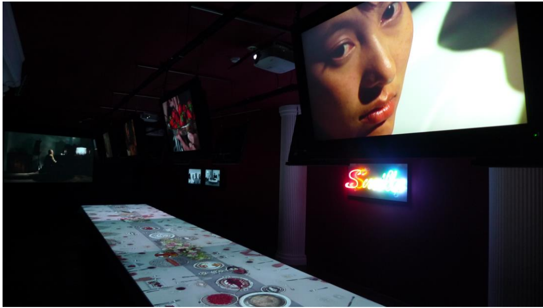
Yang Fudong, General's Smile , 2009, video installation (Installation view in Hara Museum of Contemporary Art, Tokyo, Japan, 2009)