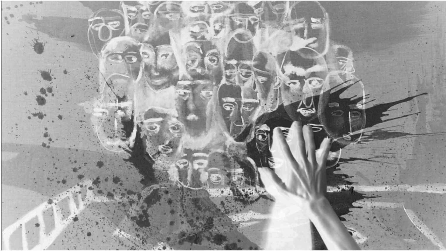
乔治的规则：骑士臆语 The Rules of Charge: A Knight's Lunacy

单路视频 Single-channel video 3'32" LYQ_7472