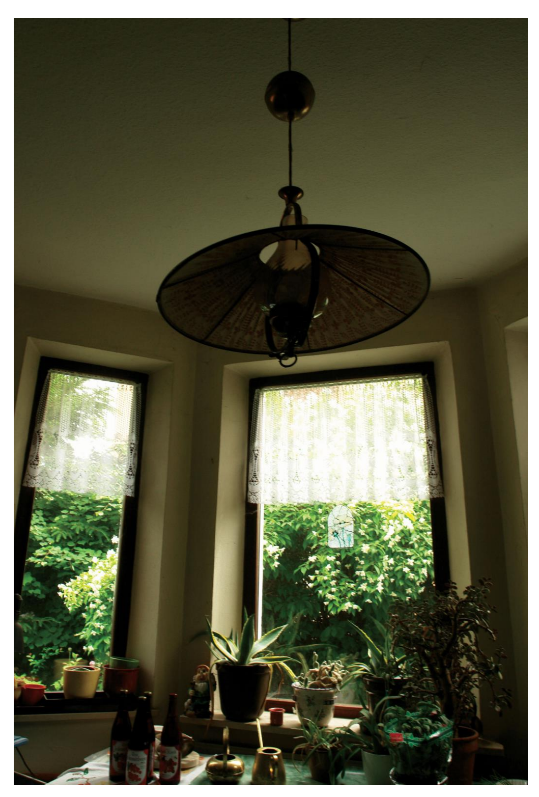
Oma (Mistebach) 2018, Photograph, 50 x 33cm 5 + 2AP Code: MS_7264_S