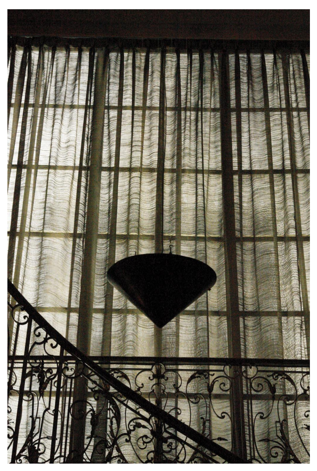
Olga (Lisabon) 2018, Photograph, 50 x 33cm 5 + 2AP Code: MS_9459_S