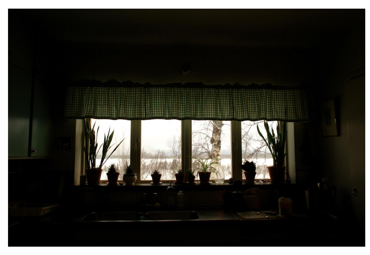
Ema's Kitchen (Saxnas) 艾玛的厨房 (Saxnas) 2018, Photograph, 33 x 50cm 5 + 2AP