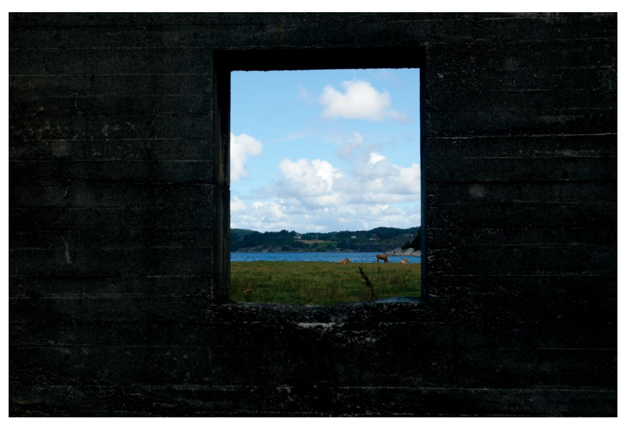
The Island (Bergen) 岛(卑尔根) 2018, Photograph, 33 x 50cm 5 + 2AP