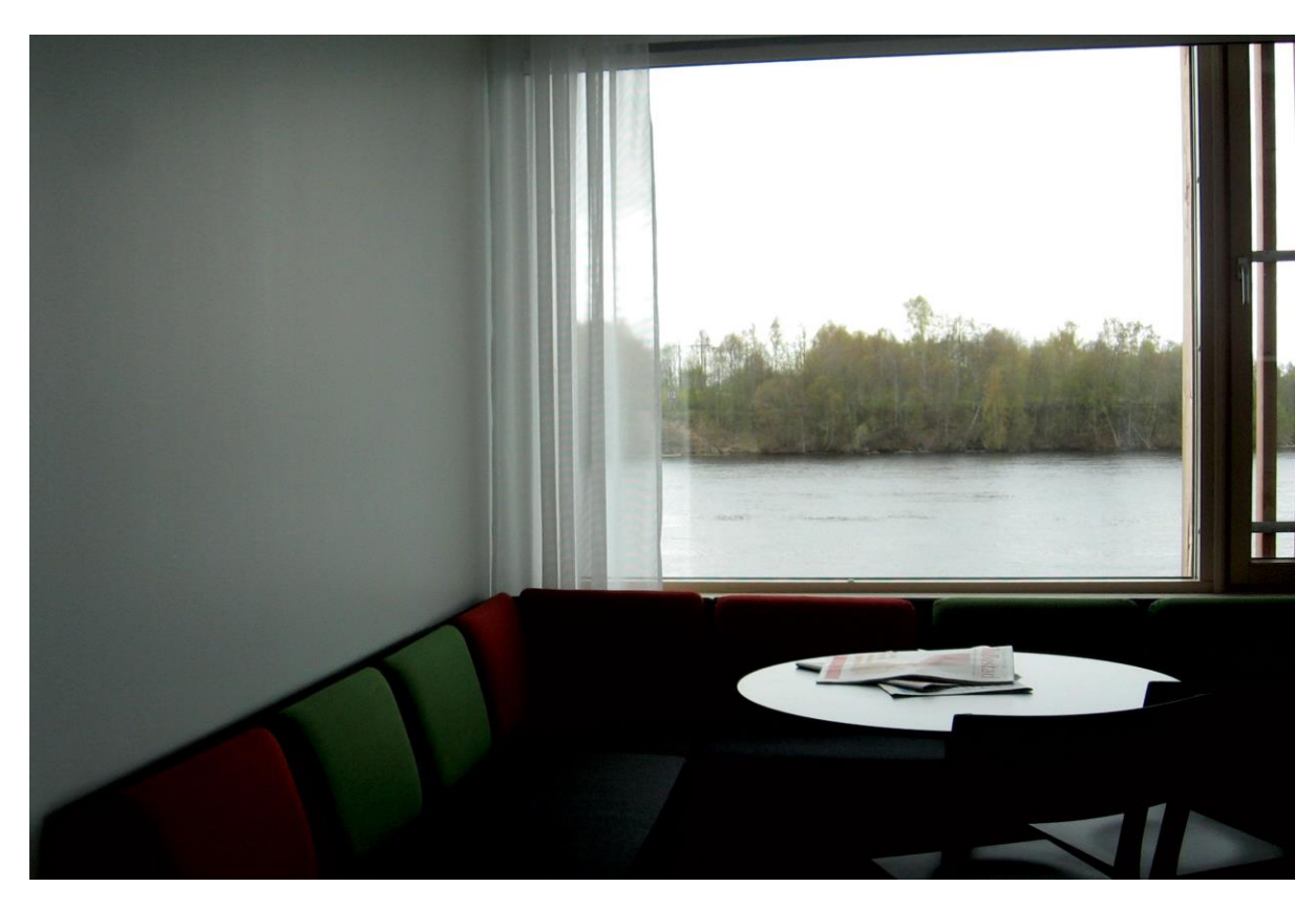
Ecke (Umea) 角落 (于默奥) 2018, Photograph, 33 x 50cm 5 + 2AP