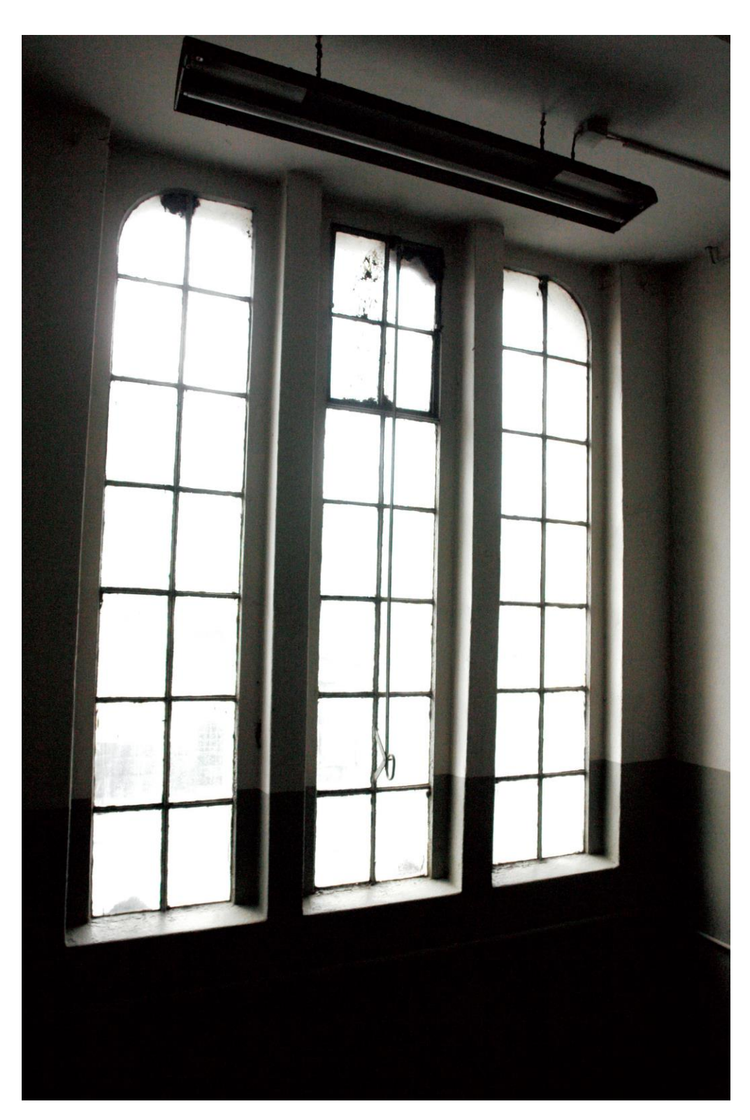
Fabriek (Kirschau) 2018, Photograph, 50 x 33cm 5 + 2AP Code: MS_7264_S