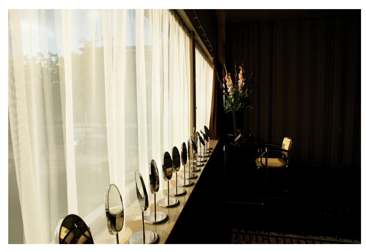
Sonneveld (Rotterdam) Sonneveld (鹿特丹) 2018, Photograph, 33 x 50cm 5 + 2AP