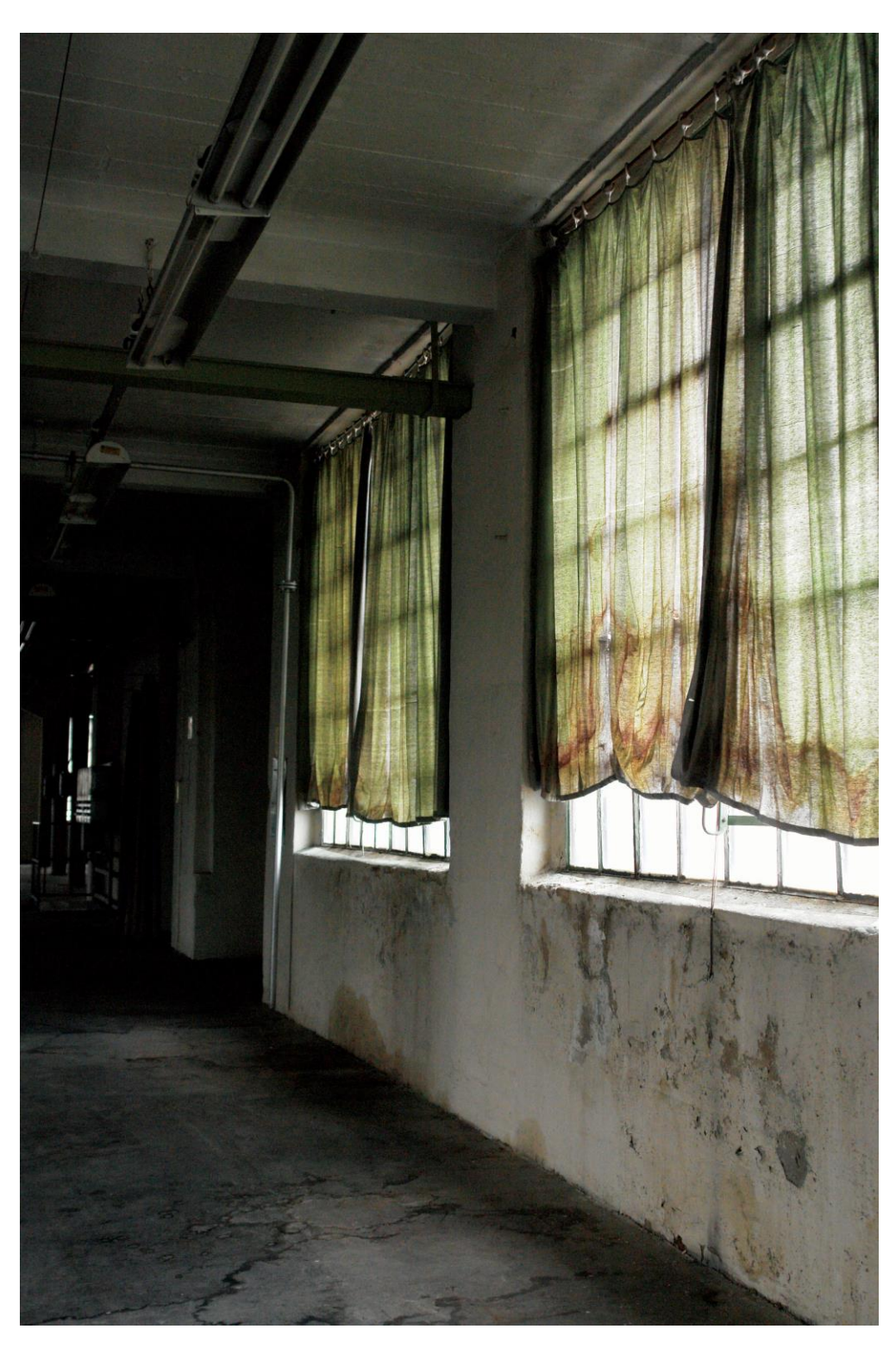
Curtain (Kirschau) 窗帘 (Kirschau) 2018, Photograph, 50 x 33cm 5 + 2AP Code: MS_5610_S