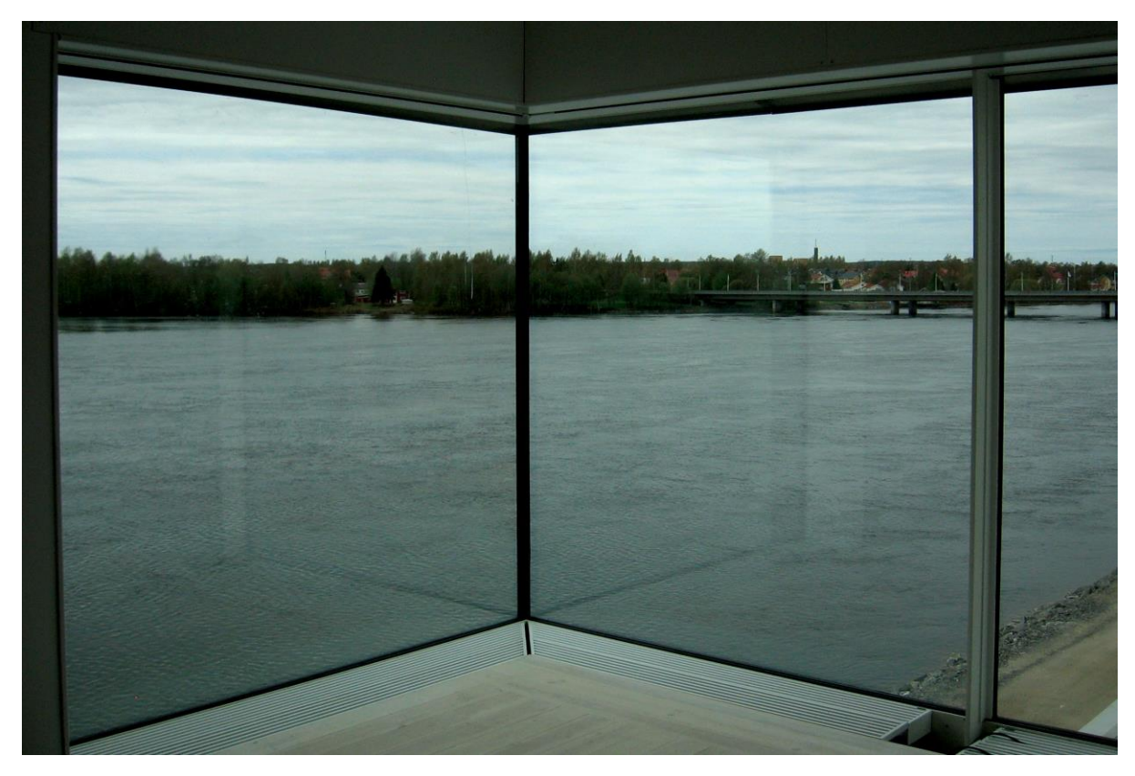
River (Umea) 河 (于默奥) 2018, Photograph, 33 x 50cm 5 + 2AP Code: MS_0221_S