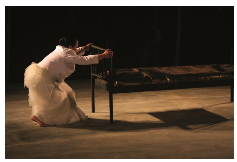
The Dust 灰 2013, Single-Channel Video 18 minutes 14 seconds 5 + 2AP Code: MS_9458_S