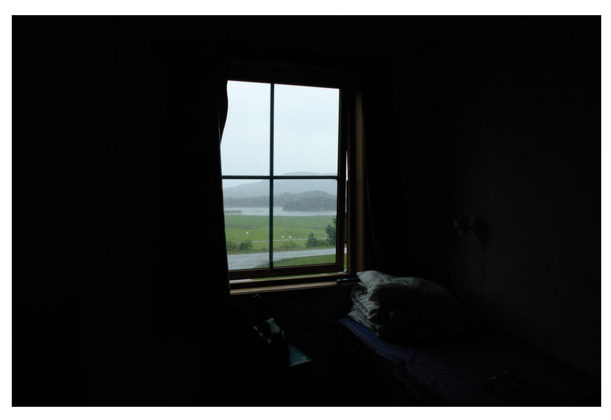
The Stone (Bergen) 石头(卑尔根) 2018, Photograph, 33 x 50cm 5 + 2AP Code: MS_1615_S