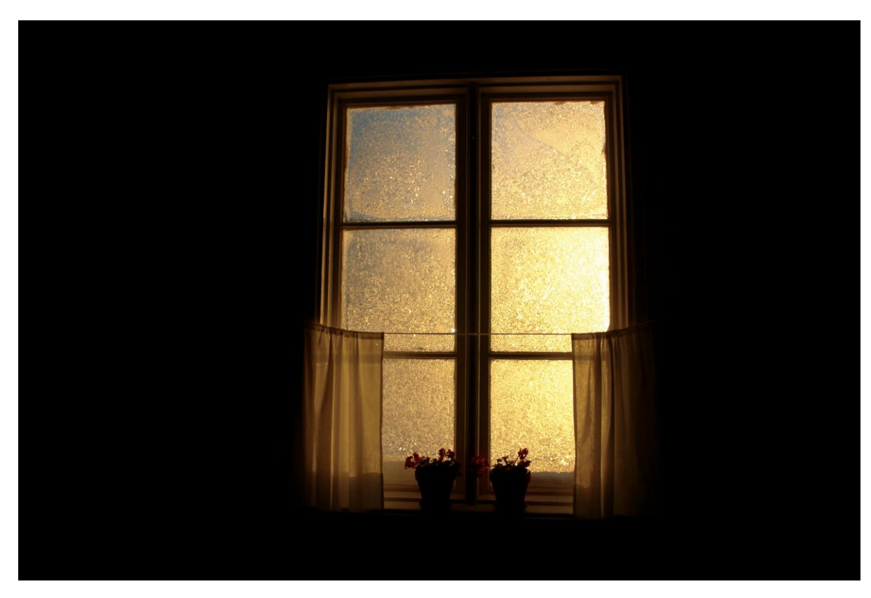
Classroom (Umea) 教室 (于默奥) 2018, Photograph, 33 x 50cm 5 + 2AP