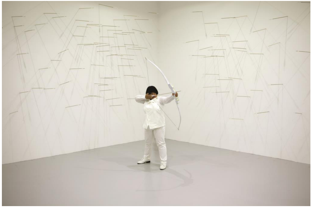
Transaction of Hollows 虚空交易 2017, Performance Code: MS_4347_S