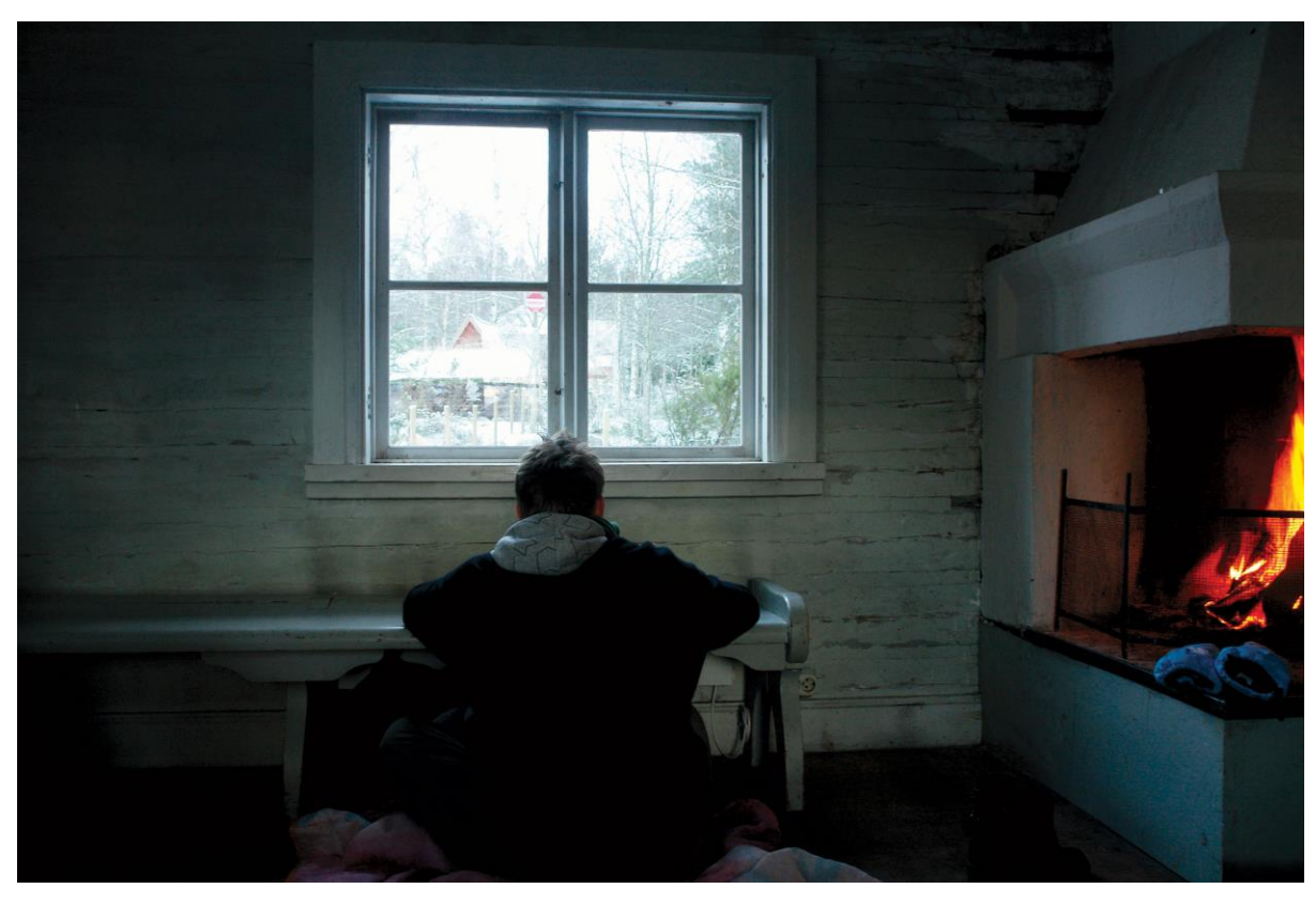
Fireplace (Umea) 璧炉 (于默奥) 2018, Photograph, 33 x 50cm 5 + 2AP Code: MS_0715_S