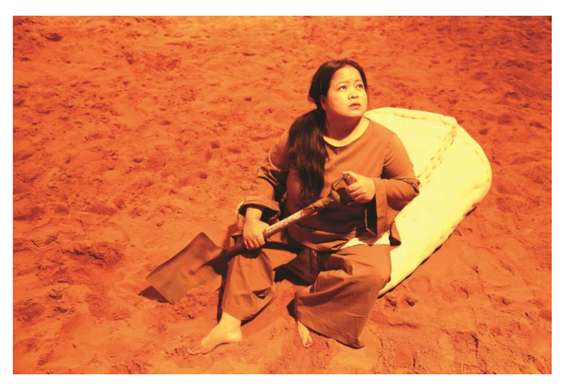
24,901 Miles 24,901 英里 2015, Single-Channel Video 15 minutes 5 + 2AP Code: MS_9170_S