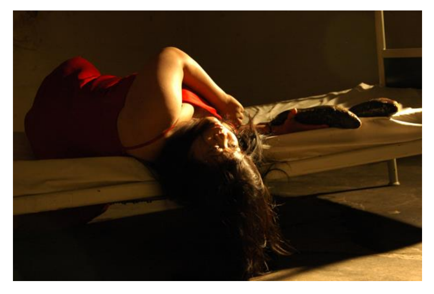
Ugo 2007, Single-Channel Video 6 minutes 6 seconds 5 + 2AP Code: MS_8662_S