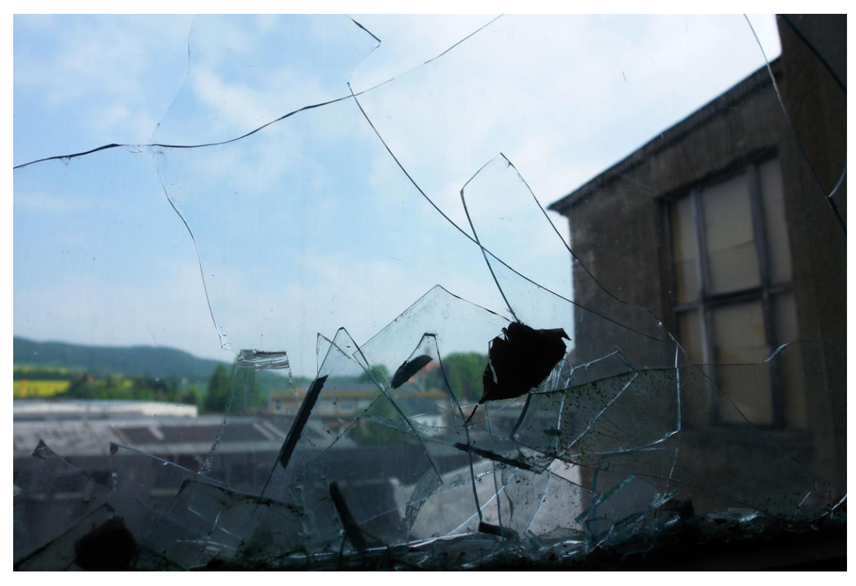
Broken (Kirschau) 破碎 (Kirschau) 2018, Photograph, 33 x 50cm 5 + 2AP Code: MS_6918_S