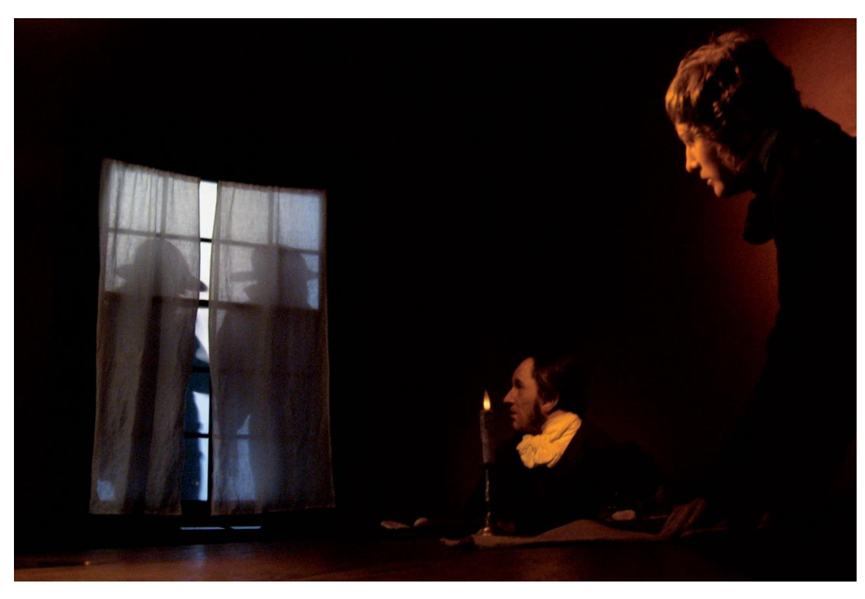
Museum (Ottawa) 博物馆(渥太华) 2018, Photograph, 33 x 50cm 5 + 2AP Code: MS_5342_S