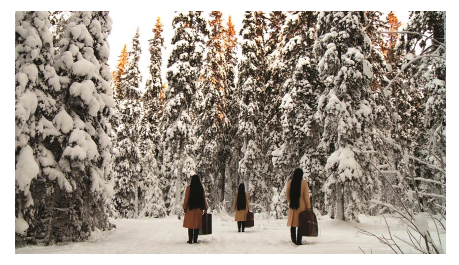
The Dusk 黄昏 2010, Single-Channel Video 25 minutes 56 seconds 5 + 2AP Code: MS_3501_S