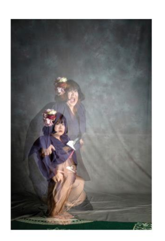
Self Portrait (Triptych) 2018, Photograph, 110 x 80cm (each) 5 + 2AP Code: MS_8685_S