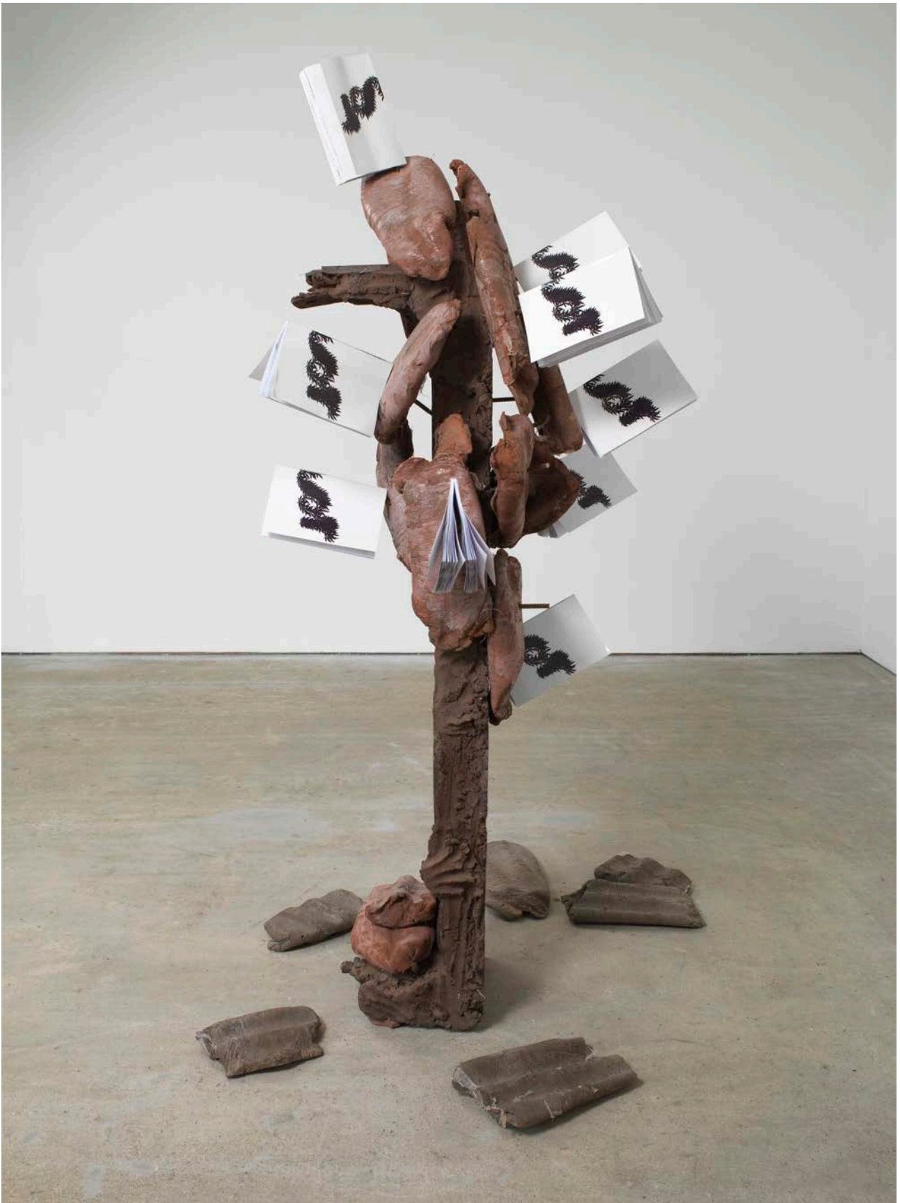
Shorey, 2016 Concrete, steel and paperback publication 190 x 125 x 112 cm