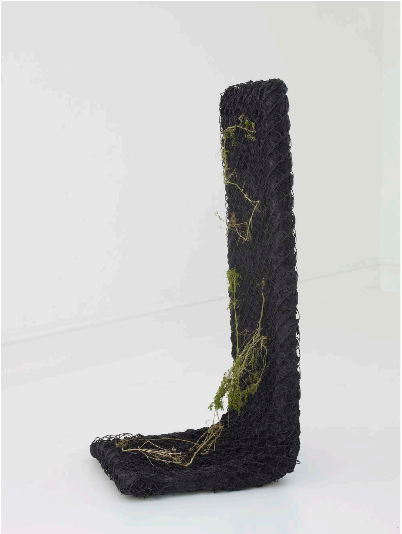
4 SHO (Working Title) 2016 Concrete, chain link fence, earth/soil, acrylic paint, weeds, paperback publications and cope page 177 x 70 x 80 cm