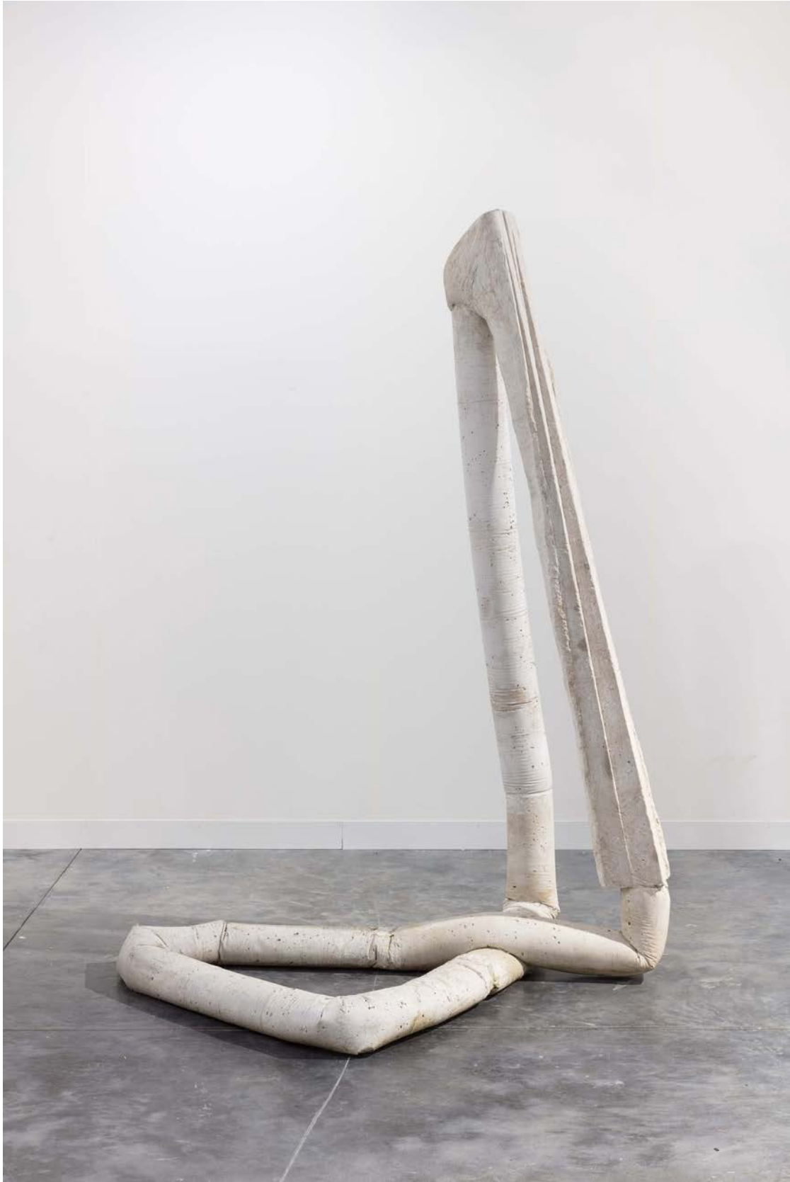
4sho (Working Title) 2016 Concrete, reinforced 205 x 122 x 112 cm