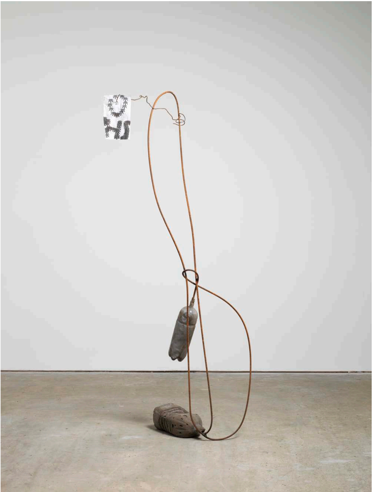
f (working title) 2016 Concrete, steel, book page (alls shores) 182.8 x 54.6 x 68.6 cm