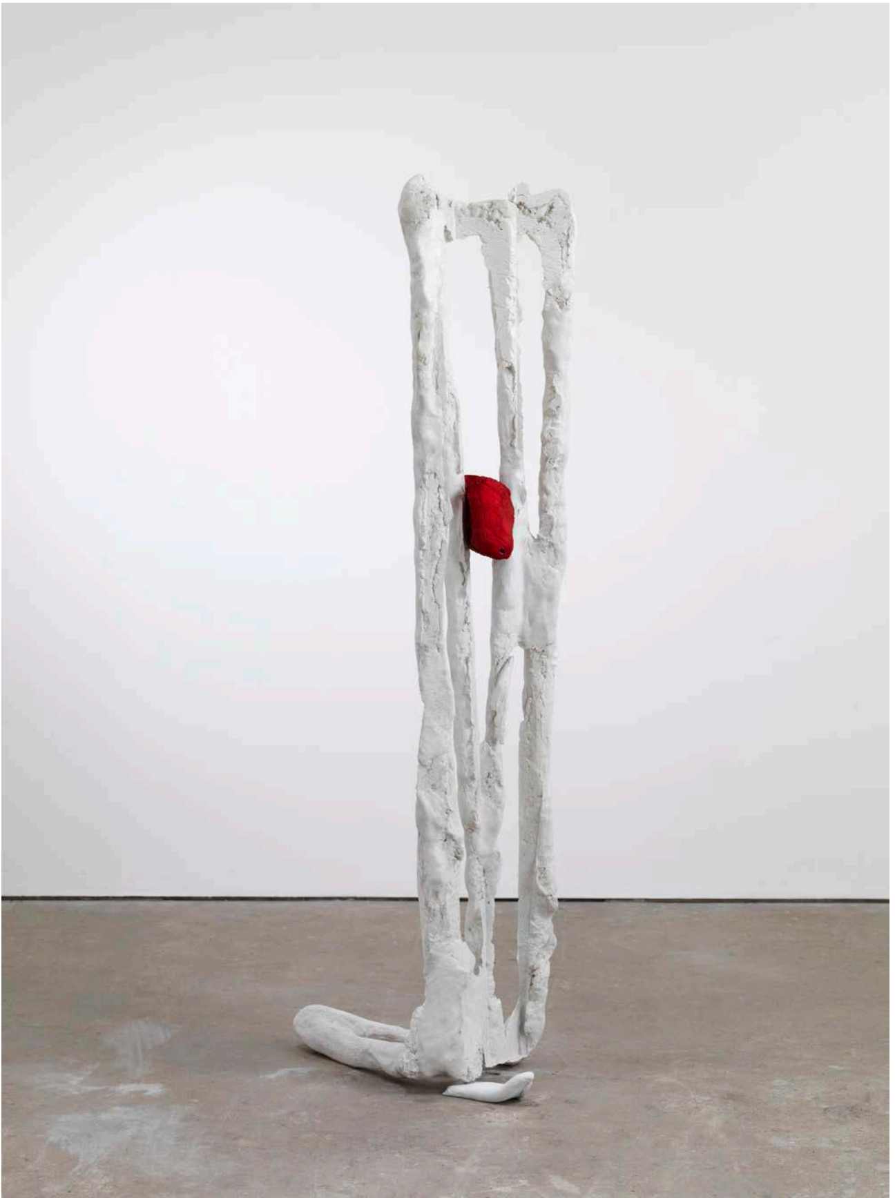
Now (Working Title) 2015 Concrete, ink saturated book 190 x 45 x 50 cm