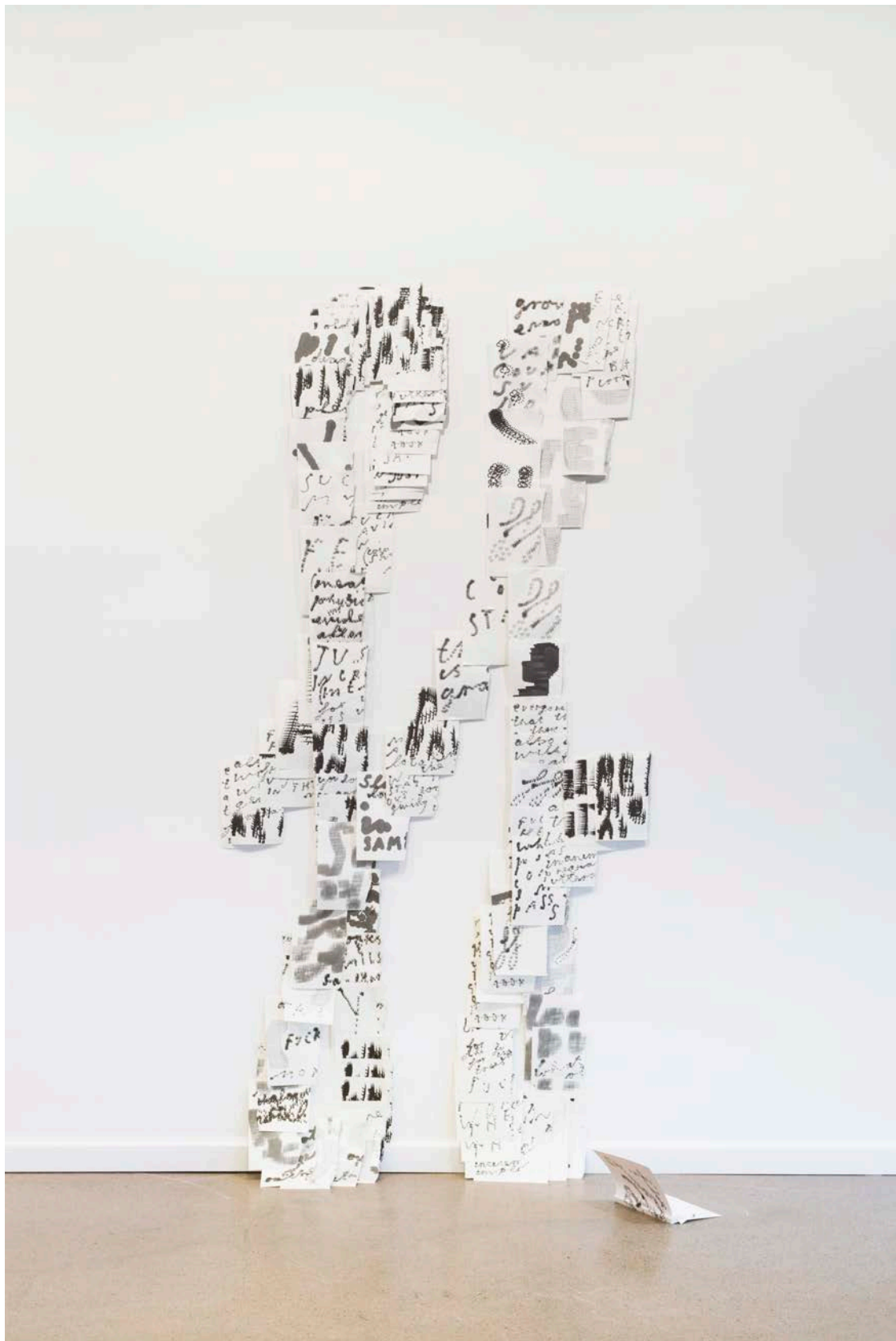
ffff unfinished notes, 2017 Paperback publication