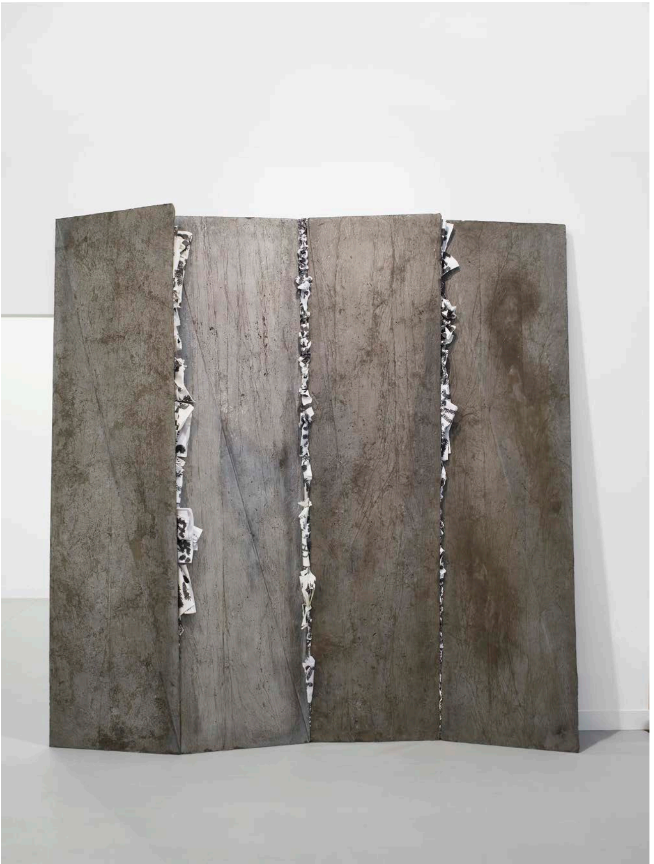
Home (working title) 2012 - 2016 Concrete 255 x 255 x 4 cm