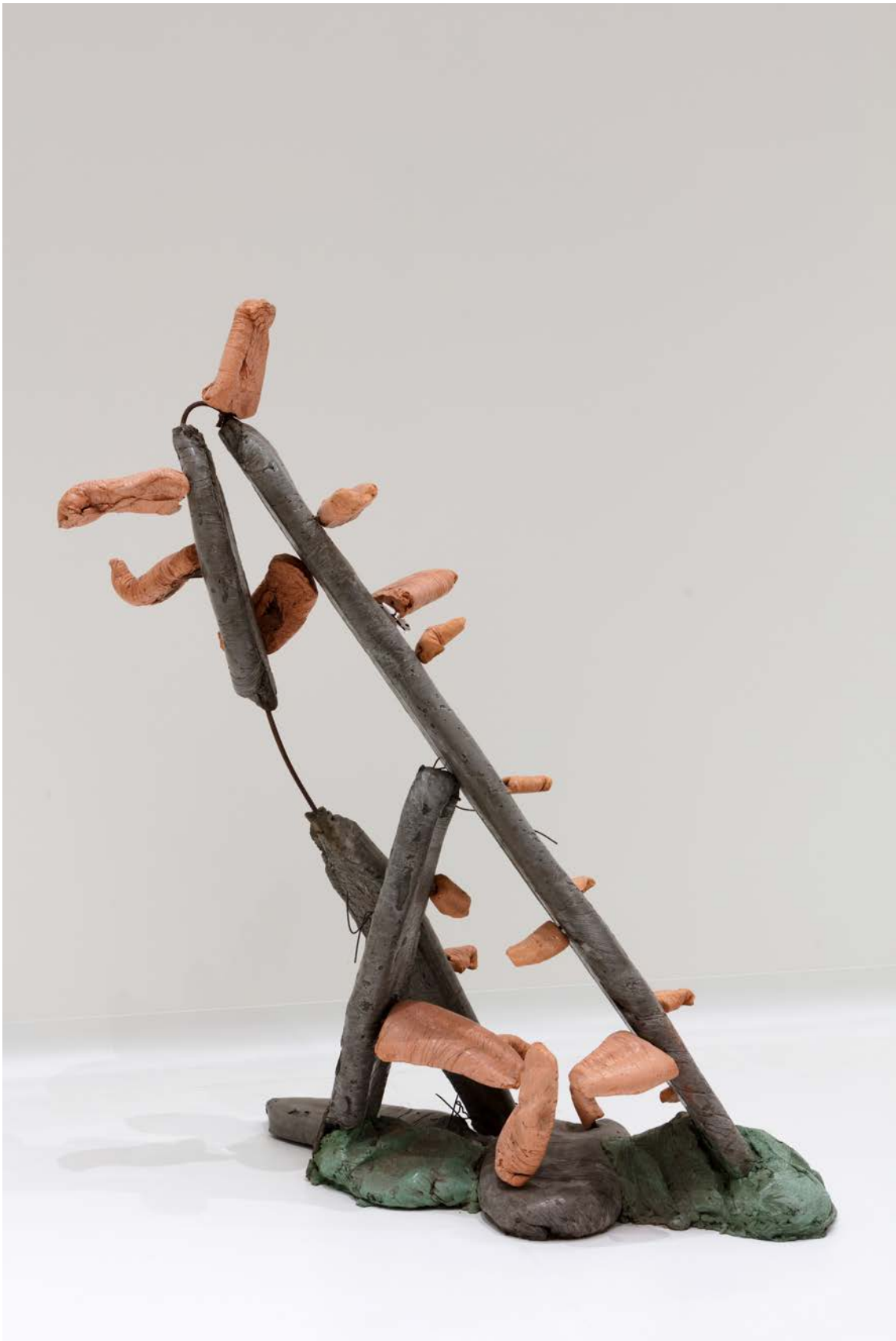
Fucked f with orange tongues on f (working title) 2016 Concrete and steel 176.5 x 66 x 135.9 cm