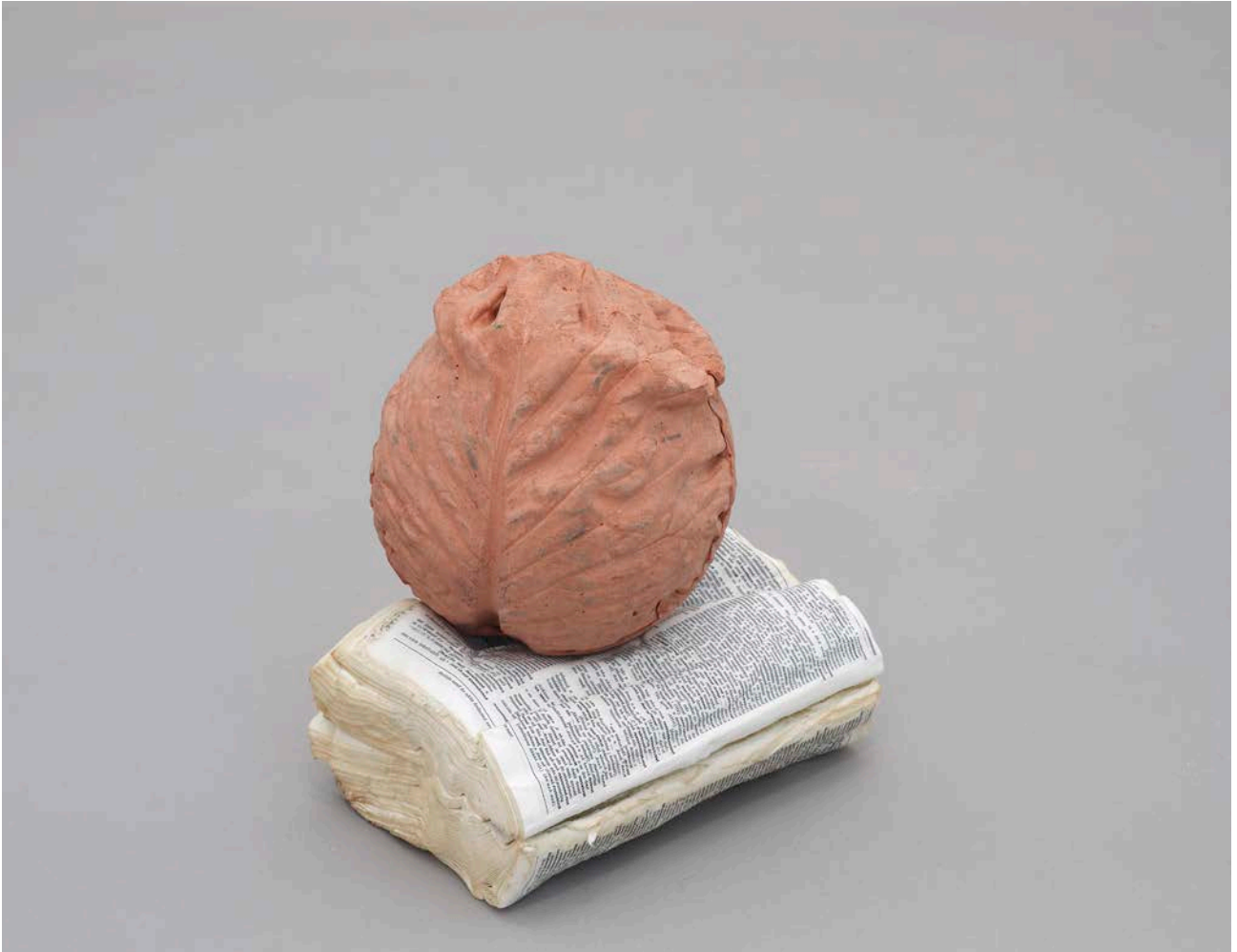
Analogue series cabbage, hnnhhnnn-hnnhhnnnh 2014 Concrete, book 26 x 20 x 23 cm