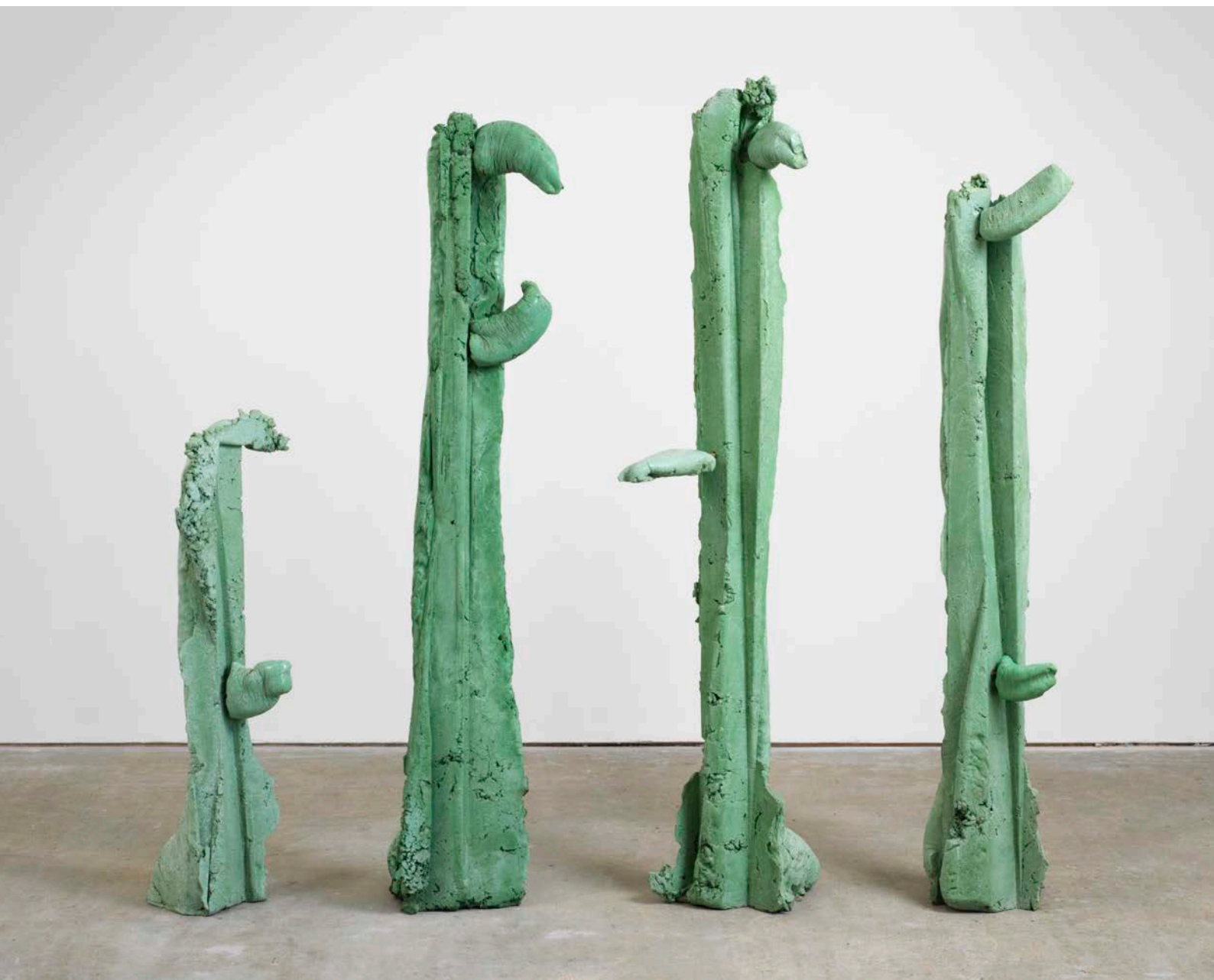
Fuck sake fuck sake (working title) 2016 Concrete and steel Overall: 183 x 196 x 36 cm