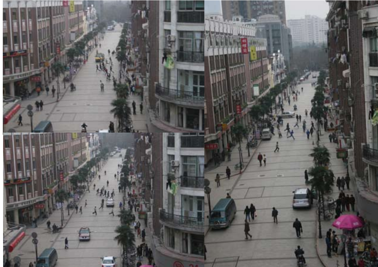
章清 Zhang Qing 地点:雁荡路 address:Yan Dang Lu Time:January 21th 时间: 1月21

“不经意的和你对话、不轻易的给你 规则” 章清 Casual dialog with you, but not so easy set you the rules” Zhang Qing