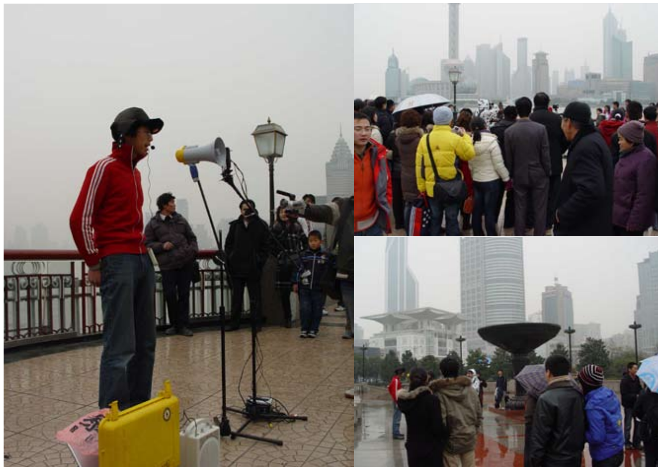
Alterazioni Video (意大利小组) 地点:外滩 address:The Bund 时间: 1月19号 从13:00到晚上 Time: January 19 from 13:00 till dark